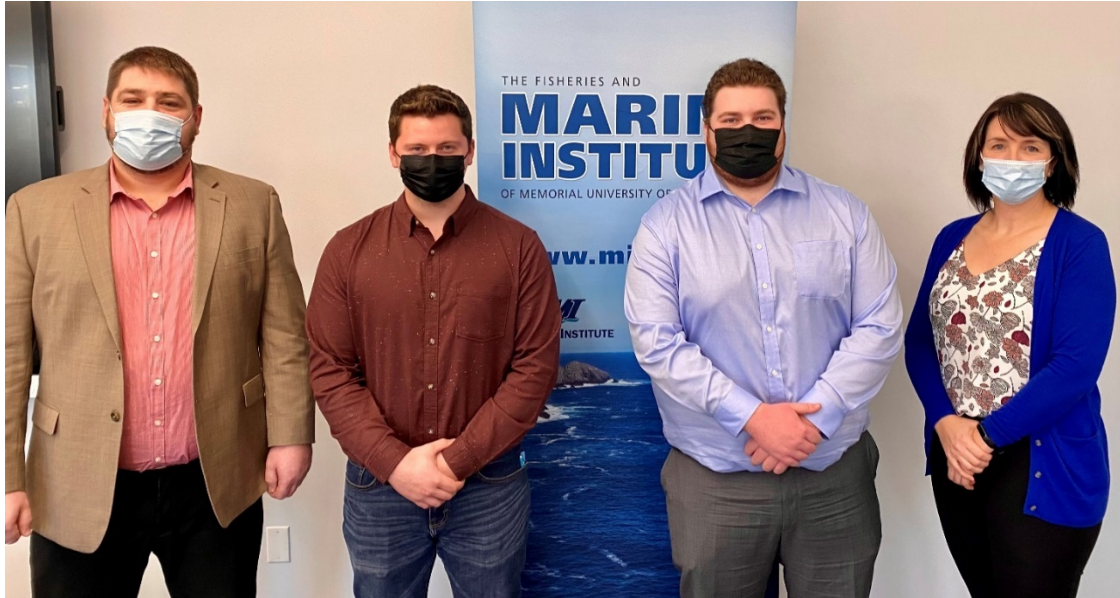
Cenovus recommitted to the Future Leaders Award at Marine Institute, supporting two Nautical Science students with a financial award and work experience.

The photos below highlight some of the ways Cenovus supported the community in 2021 (Note: Photos were taken throughout the year and reflect public health guidelines at the time).