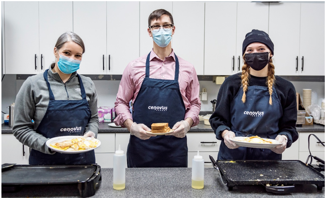
Cenovus supported the Jimmy Pratt Memorial Outreach Centre with a $15,000 contribution to their breakfast program. In addition, Cenovus employees volunteer each week to prepare the meals.