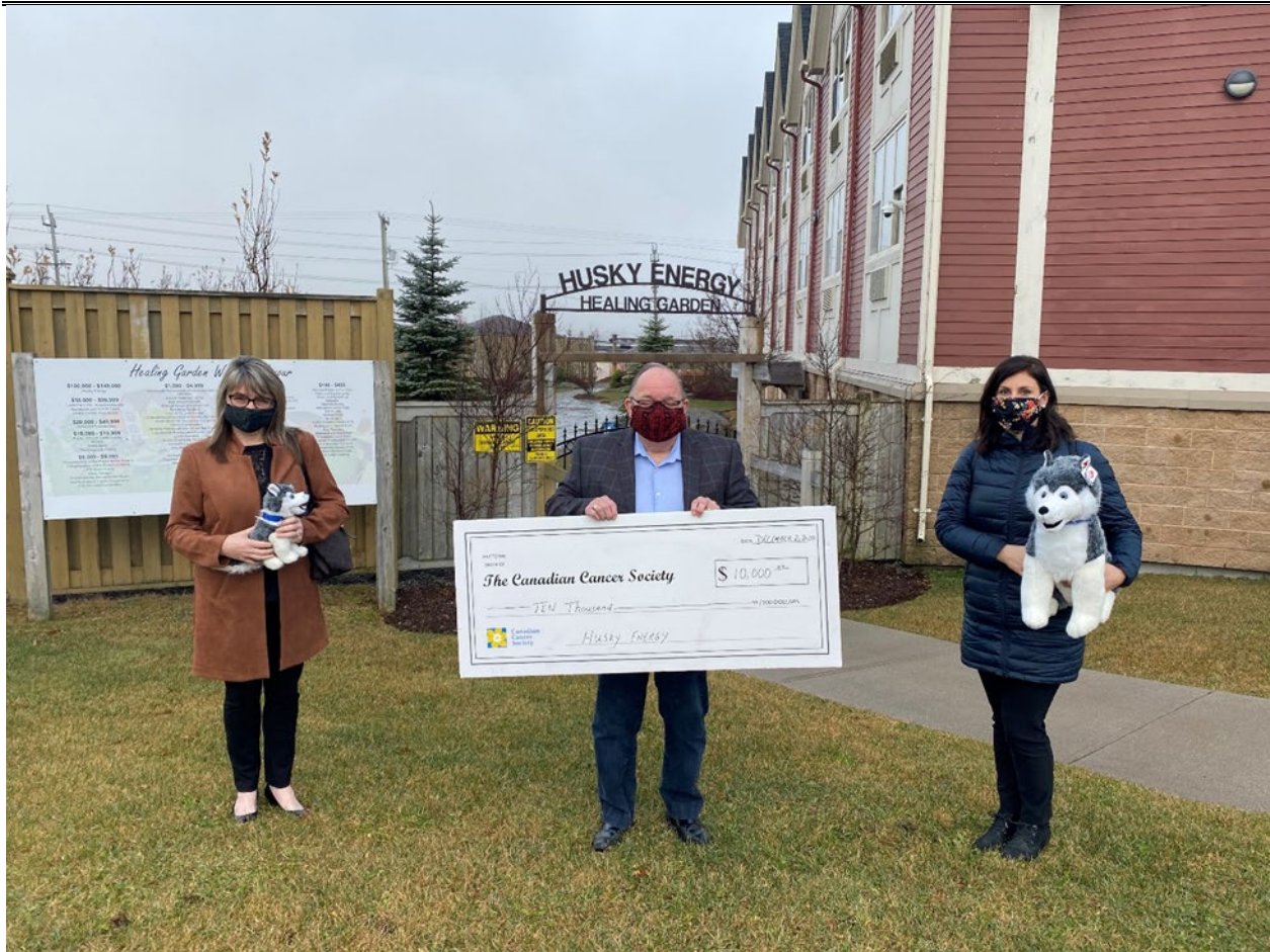
Husky contributed $10,000 to the Canadian Cancer Society NL Division to support Daffodil Place.