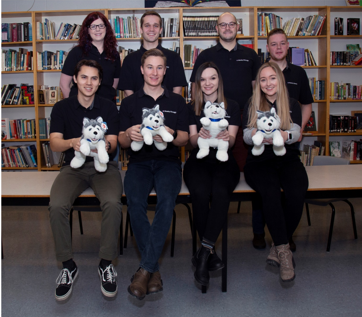
Husky employees volunteered to deliver the Junior Achievement Economics of Staying in School program at St. Kevin's High - January 2020

The photos below highlight some of the ways Husky supported the community and demonstrated its commitment to inclusion and diversity in 2020 (Note: Photos were taken throughout the year and reflect public health guidelines at the time).