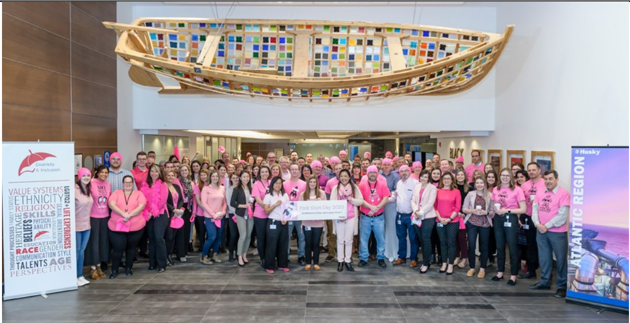
Husky employees recognized Pink Shirt Day and took a stand against bullying- February 2020.