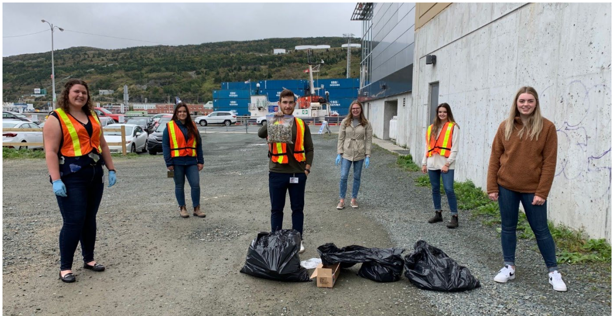
Husky recognized Environment Week with a focus on plastic pollution and a clean-up in the downtown area—June 2020.