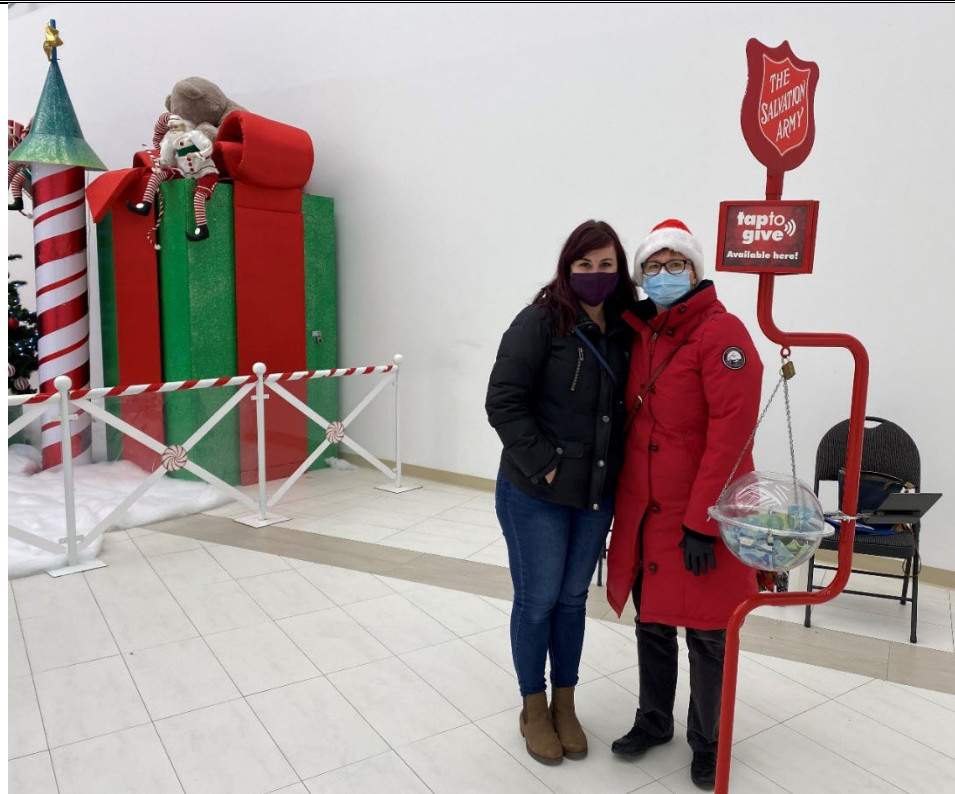
Husky employees volunteered to support the Salvation Army Kettle Campaign – December 2020.