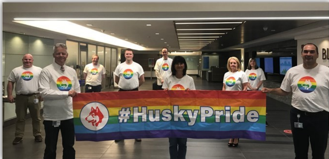
Following physical distancing guidelines, Husky participated in Pride Week in St. John's, NL - July 2020.