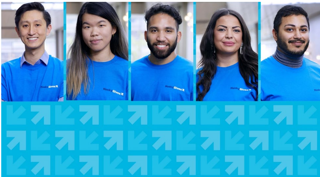
Through the Husky Gives platform, employees contributed more than $76,000 to local organizations—December 2020.