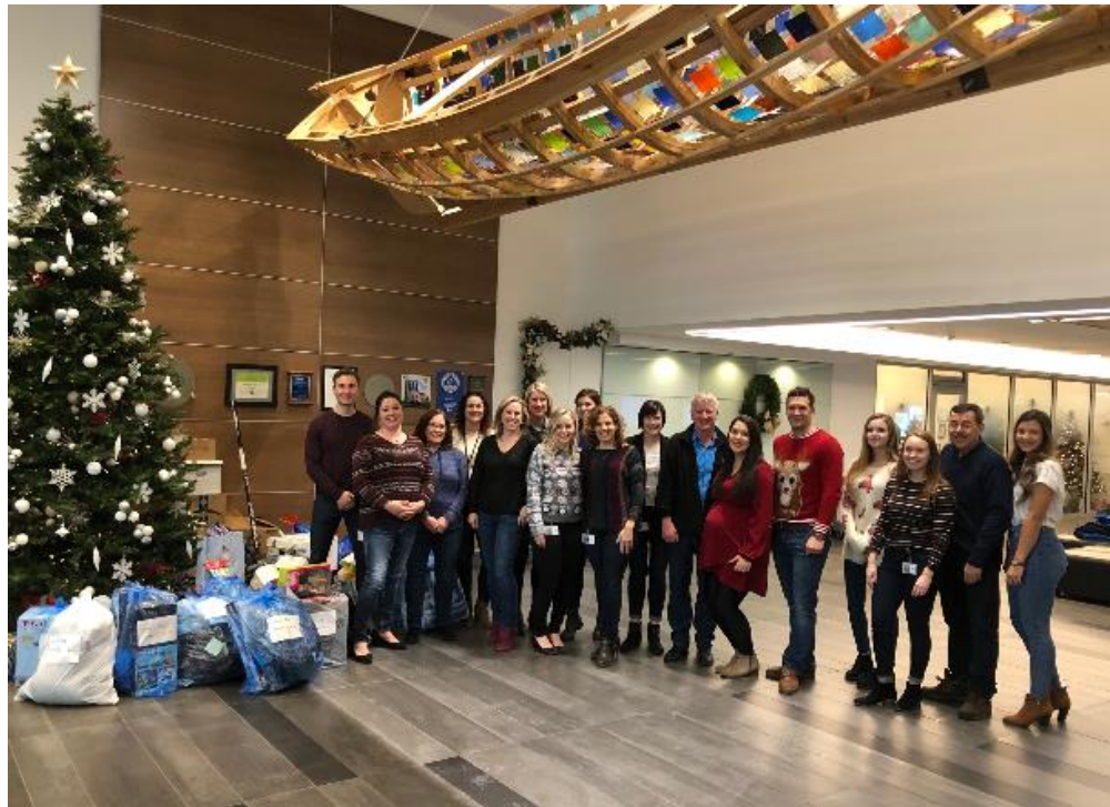
Husky supports the Single Parent Association of NL through monetary donations and Christmas gifts for 19 families, totaling over $10,000 – December 2019