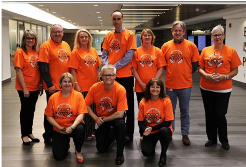
Husky employees participate in Orange Shirt Day to recognize the hardships of Indigenous children who endured the residential school system - October 2019