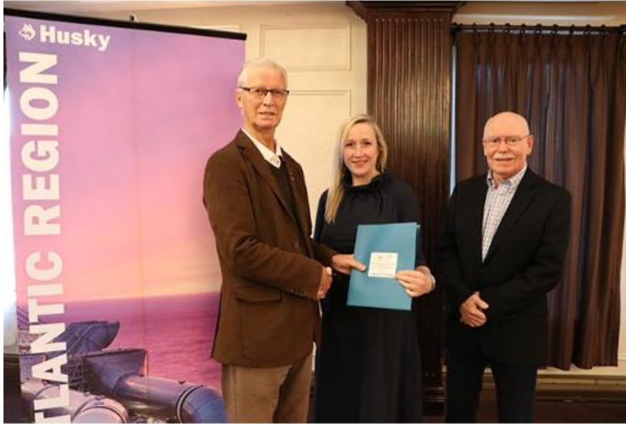
Husky's provides the Binge Eating Disorder Foundation with $10,000 to support its work raising awareness around eating disorders and providing tools to support individuals and families struggling with them – November 2019