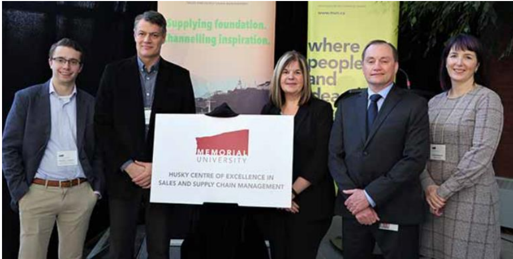
Husky contributes $1 million to create the Husky Centre of Excellence in Sales and Supply Chain Management - December 2019