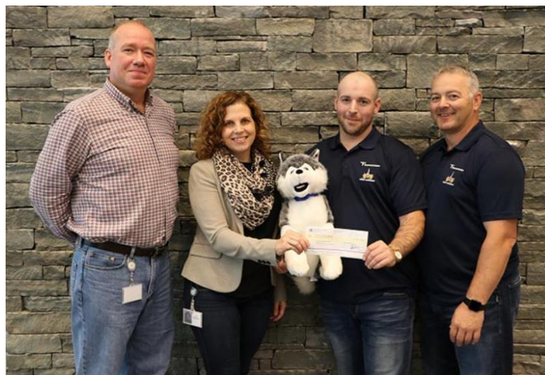
The Henry Goodrich, Transocean, Horizon and Husky donate funds to support the Happy Valley-Goose Bay Food Bank - October 2019