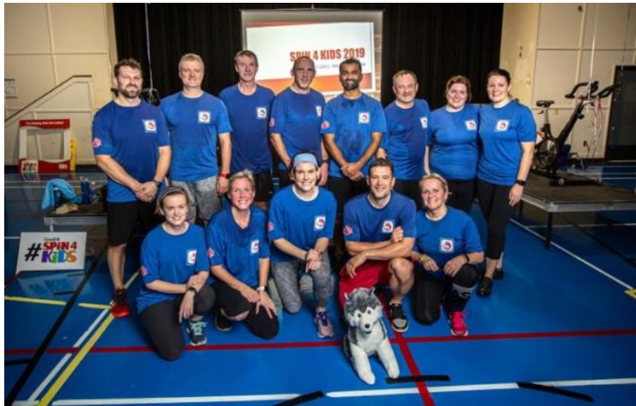
Husky employees participate in Goodlife Fitness' Annual Spin4Kids to raise funds for physical activity programs for children with special needs – November 2019