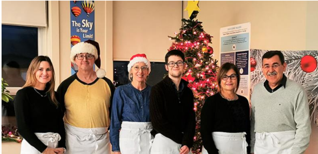
Husky employees volunteer to serve Christmas dinner for the Clean Start program, a Stella's Circle organization, which gives adults facing barriers in their community the opportunity to gain meaningful employment by providing professional cleaning services to clientele - December 2019