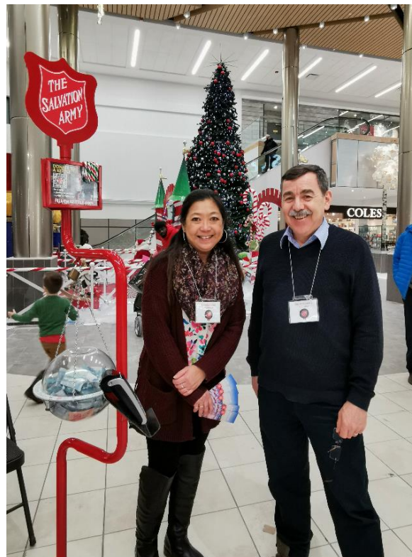
Husky employees volunteer to support the Salvation Army Kettle Campaign – December 2019