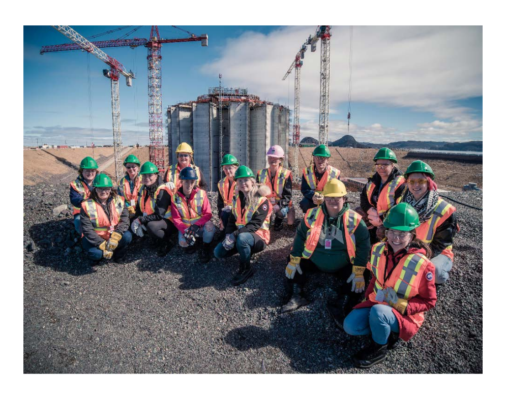
The West White Rose Project participates in WRDC's Orientation to Trades and Technology program by offering site tours - April 2019