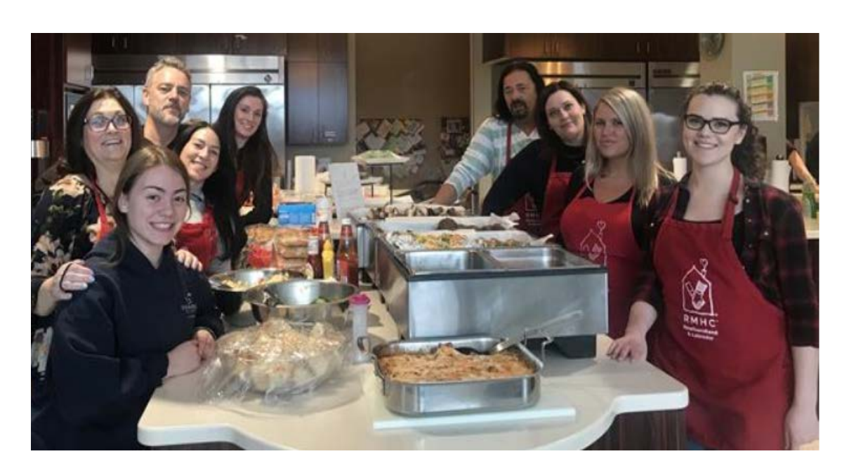
Husky's West White Rose Project SCM team volunteers at the Ronald McDonald House to cook for 48 guests – May 2019