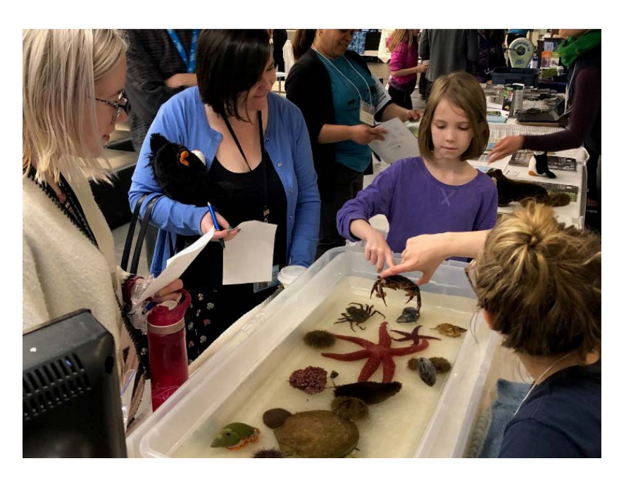
Husky invites vendors to set up booths in the 351 lobby to educate about making a positive impact on the environment for Earth Day - April 2019