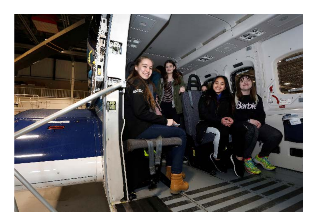
Husky has had another great year helping young girls get hands on exposure to science through WRDC's annual Techsploration program – May 2019