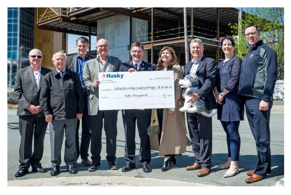
Husky donates $50,000 to the Salvation Army Centre Of Hope - June 2019