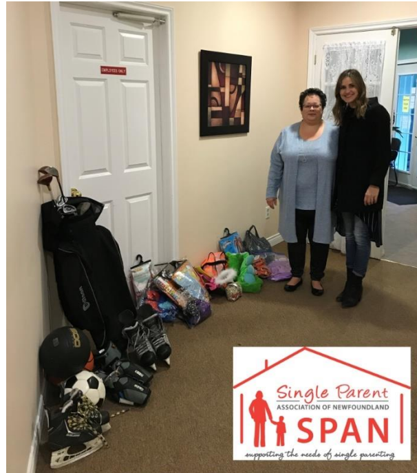
Husky employees collect and donate sports gear to the Single Parents Association - October 2018