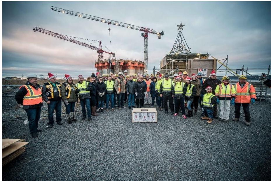
Employees at the West White Rose Project site in Argentina collect and donate funds to the Zone 6 Region D Lion's Club. – December 2018