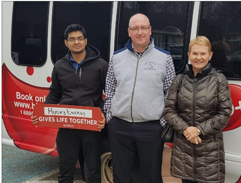
Husky employees take the life bus to the Canadian Blood Services clinic to donate blood. – November 2018