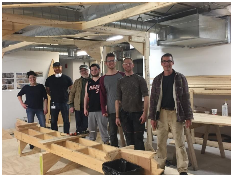
ThriveNL use Husky rental space for its Boat Building Project , an initiative where youth connected with the Thrive GED program construct a 17ft dory. - November 2018