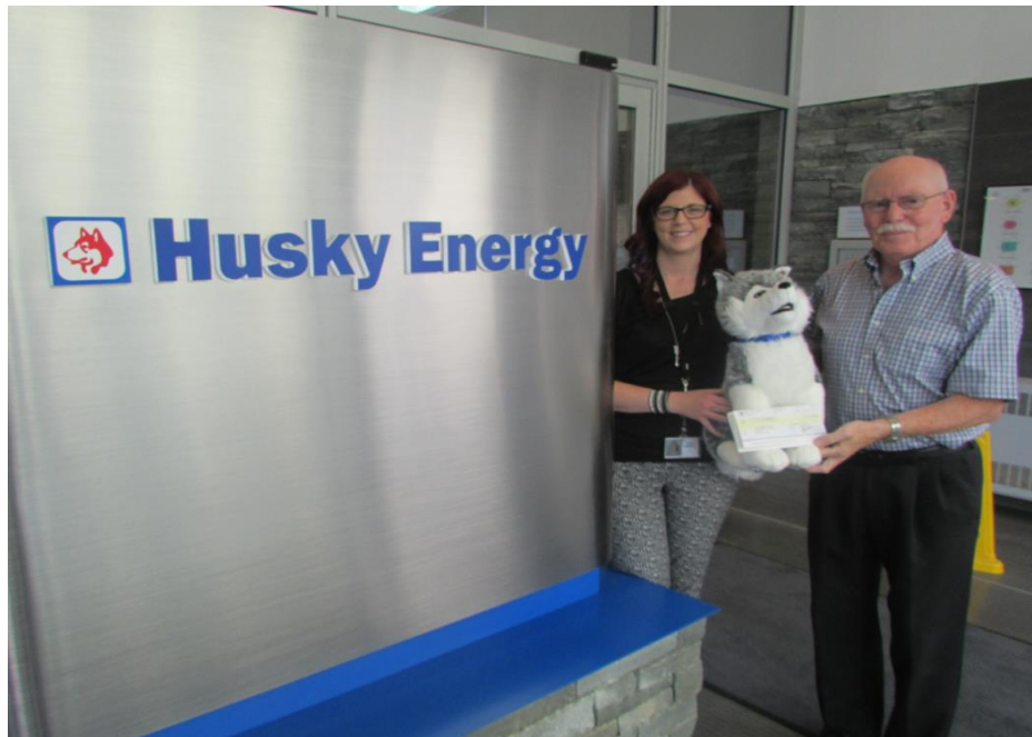
Husky contributes funds to help support the Eating Disorder Foundation of NL EFFT program – August 2018