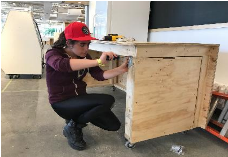
Husky donates $50,000 to the community building project for the St. John's Farmer's Market - July 2018