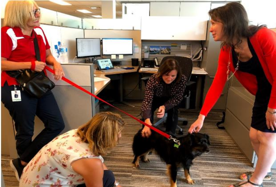
Husky sponsors the St. John's Ambulance Therapy Dog program to support mental health in the workplace – August 2018