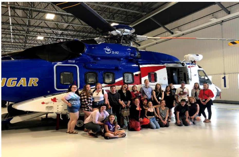
Husky coordinates Cougar tour for ThriveNL students, ages 10-17, - July 2018