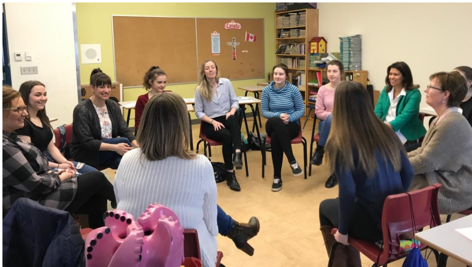
Husky representatives travel to Laval High School in Placentia, NL, for the WRDC Techsploration program – April 2018