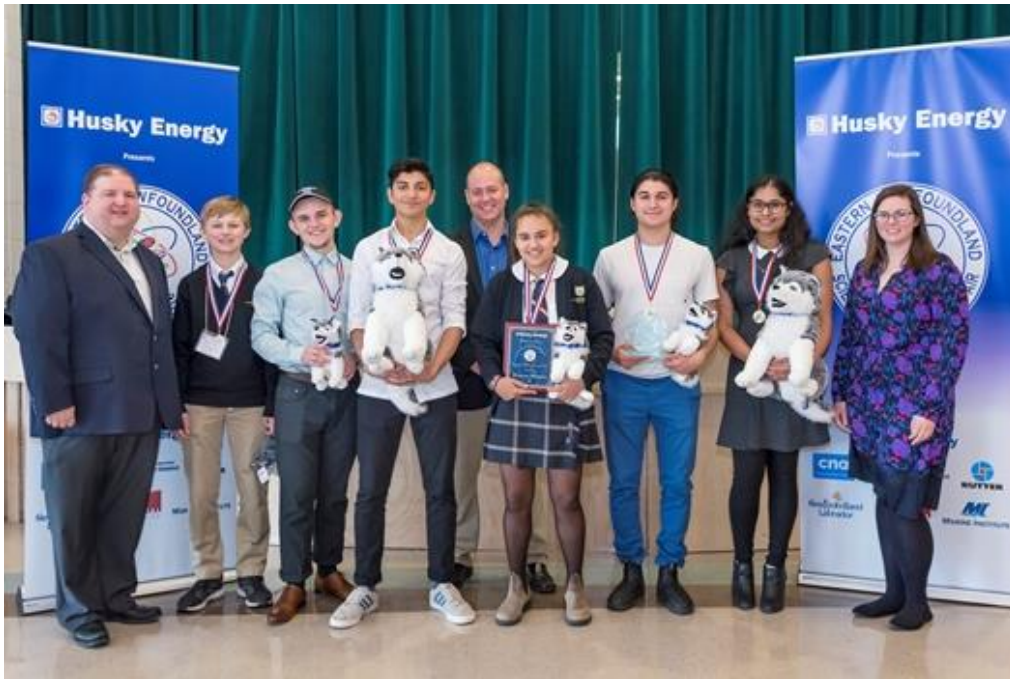
Husky sponsors the Eastern NL Science and Technology Fair – April 2018