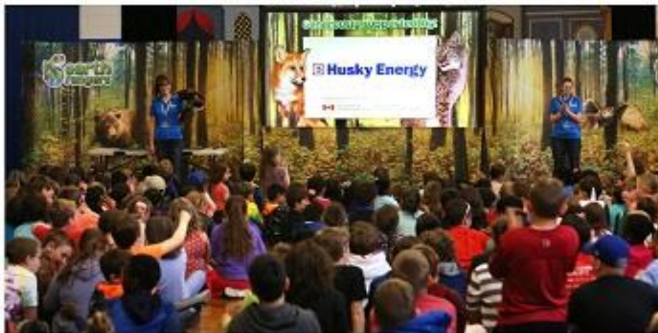
Husky sponsors a visit to MacDonald Drive Junior High from Earth Rangers to inspire children about the importance of biodiversity and conservation – June 2018