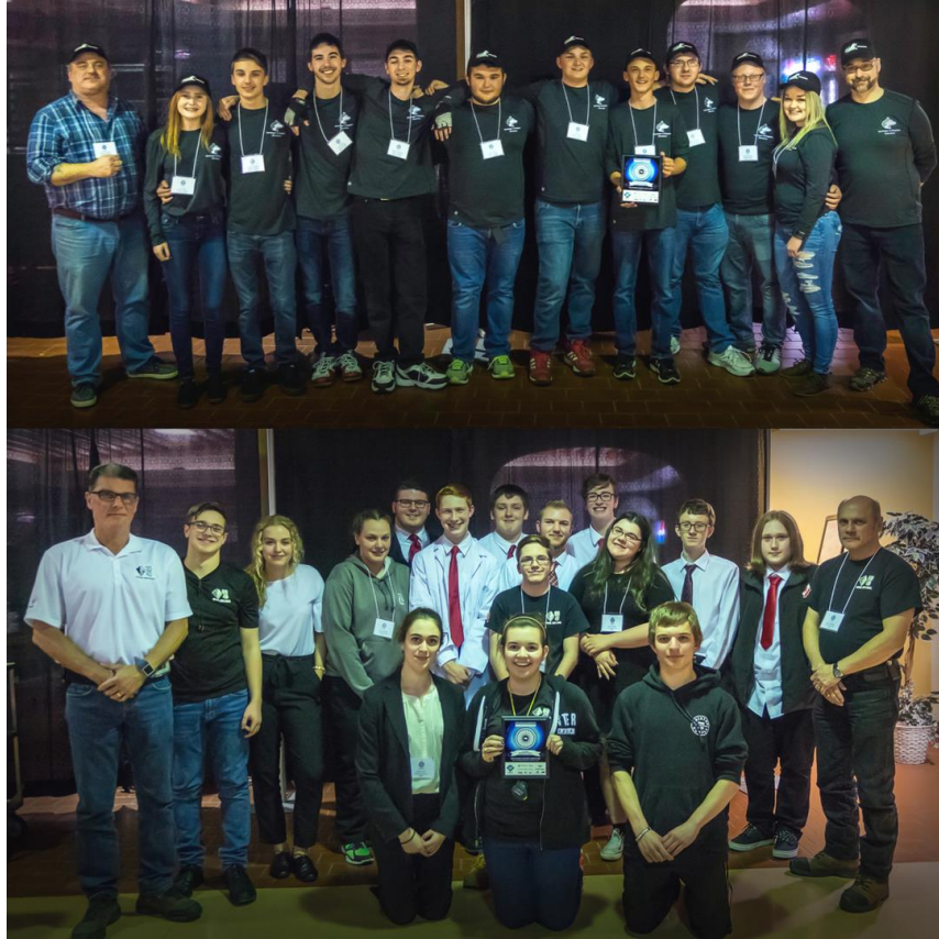
Husky was a proud event sponsor of the Newfoundland and Labrador Regional MATE 2018 Remotely Operated Vehicle (ROV) Competition– May 2018