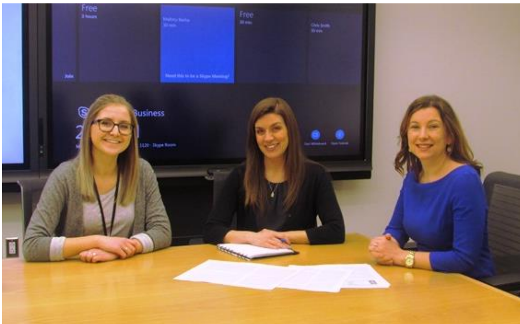
Husky's Women's Leadership Network hosts a mentorship program for work term students – March 2018