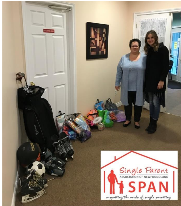
Husky employees collect and donate sports gear to the Single Parents Association - October 2018