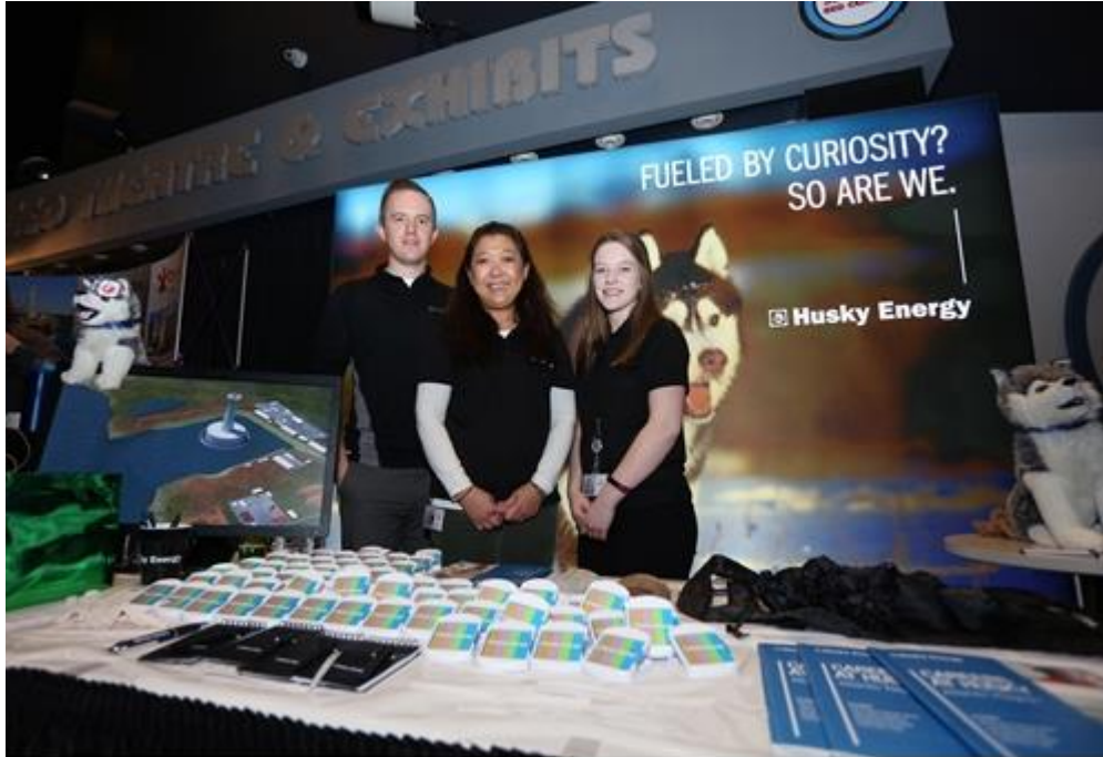
Husky employees attend Oil and Gas week – March 2018