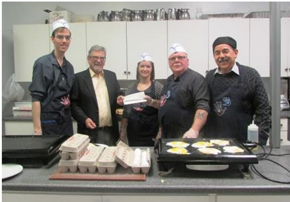
Husky donates $15,000 to the Jimmy Pratt outreach centre breakfast program – February 2018