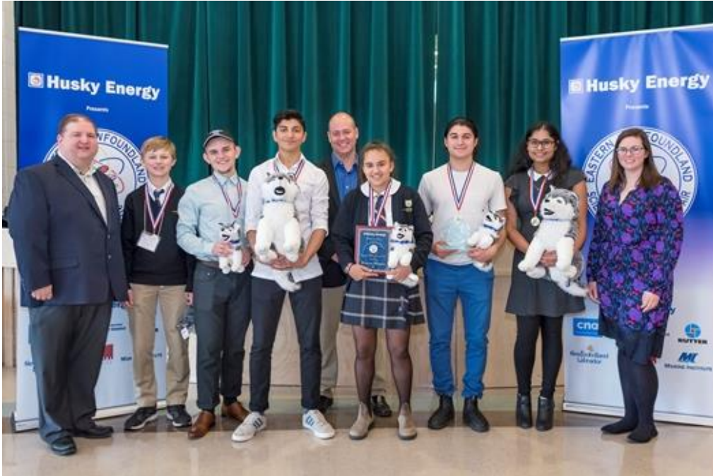
Husky sponsors the Eastern NL Science and Technology Fair – April 2018