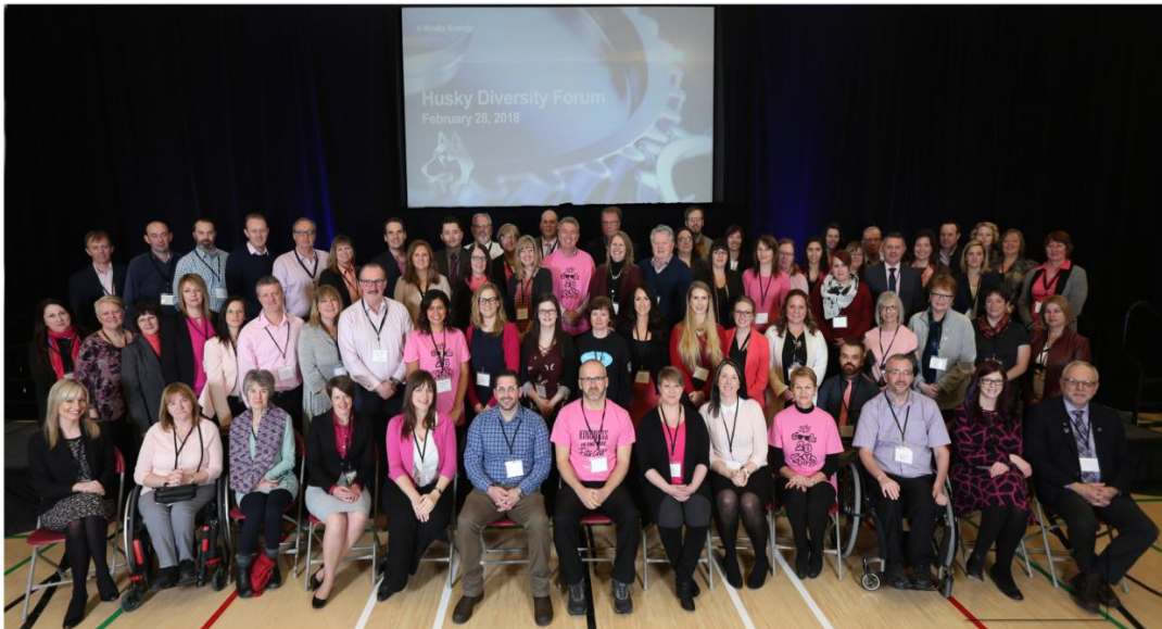
Attendees at Husky’s annual Diversity Forum wear pink in support of Anti-Bullying Day – February 2018