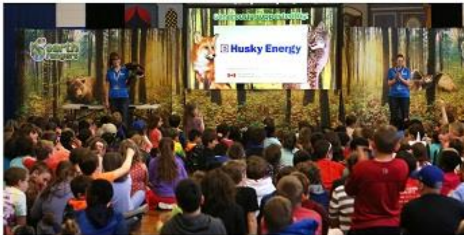
Husky sponsors a visit to MacDonald Drive Junior High from Earth Rangers to inspire children about the importance of biodiversity and conservation – June 2018