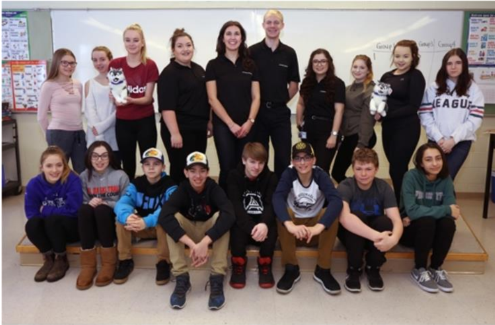
Husky employees volunteer with Junior Achievement at St. Kevin's High School – January 2018