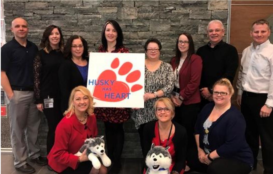
Husky employees raised $25,500 for the Husky Has Heart campaign – the funds were split amongst the Canadian Mental Health Association of NL, Kids Eat Smart, and the Single Parent Association of NL– February 2018