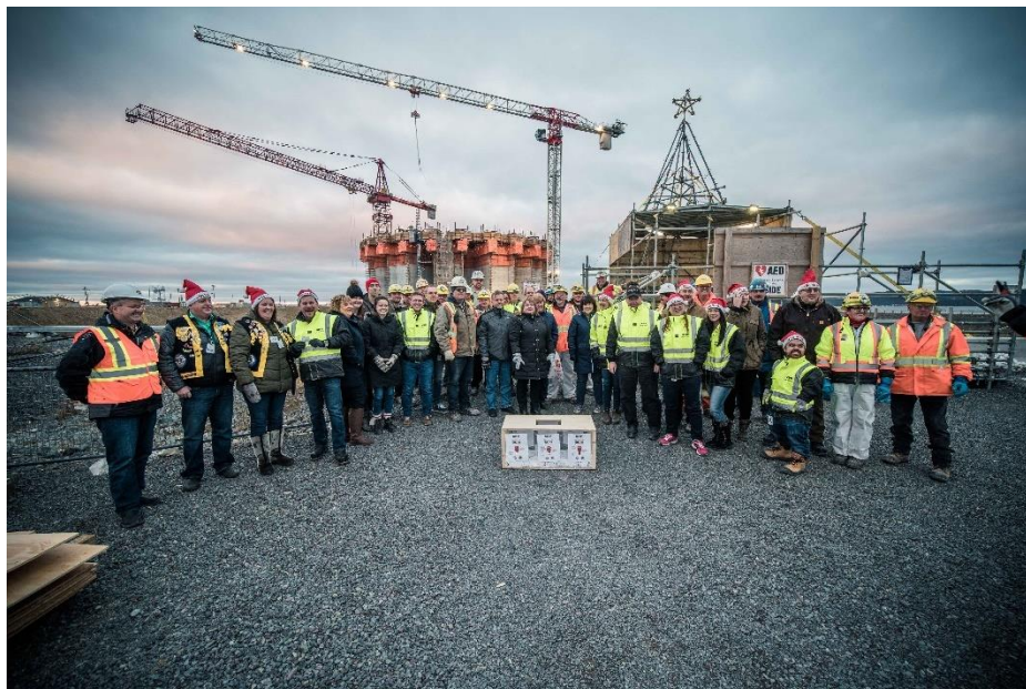
Employees at the West White Rose Project site in Argenteia collect and donate funds to the Zone 6 Region D Lion's Club. – December 2018