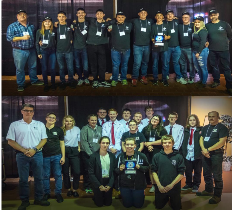
Husky was a proud event sponsor of the Newfoundland and Labrador Regional MATE 2018 Remotely Operated Vehicle (ROV) Competition– May 2018