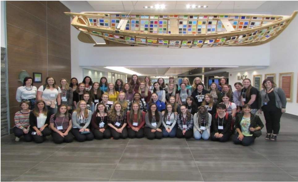
WISE students visit Husky office for 'Husky Day' to learn about company operations and various industry professions – August 2017