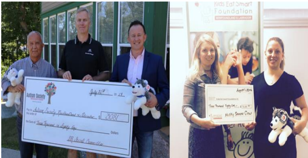
SeaRose fundraises for local charities, Kids Eat Smart and the Autism Society – August 2017