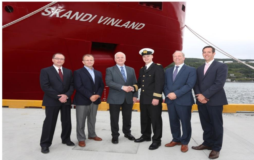
Husky welcomes the Skandi Vinland, which will provide support to subsea inspections, maintenance and repair, construction and offshore logistics – August 2017