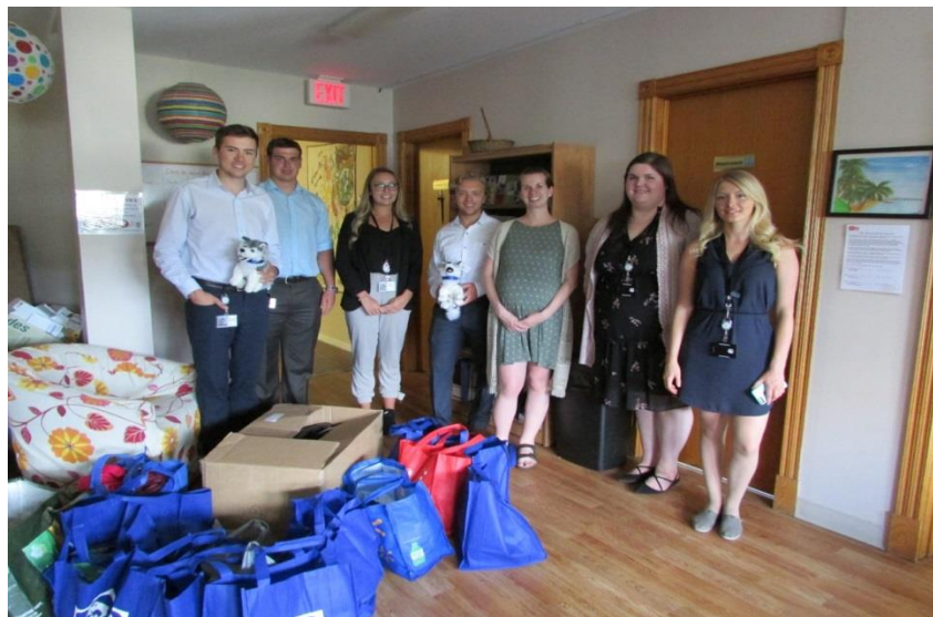
Husky work term students collect donations for Thrive Street Reach program – August 2017