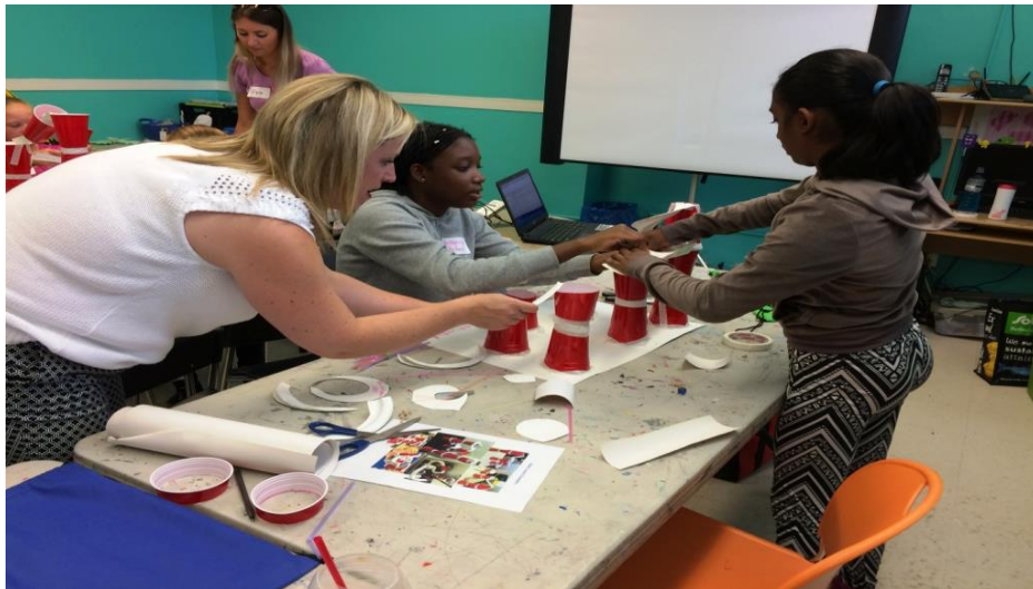
Husky volunteers attend Engineering Solutions: Design, Empower, Impact at the Mundy Pond Boys and Girls Club – August 2017