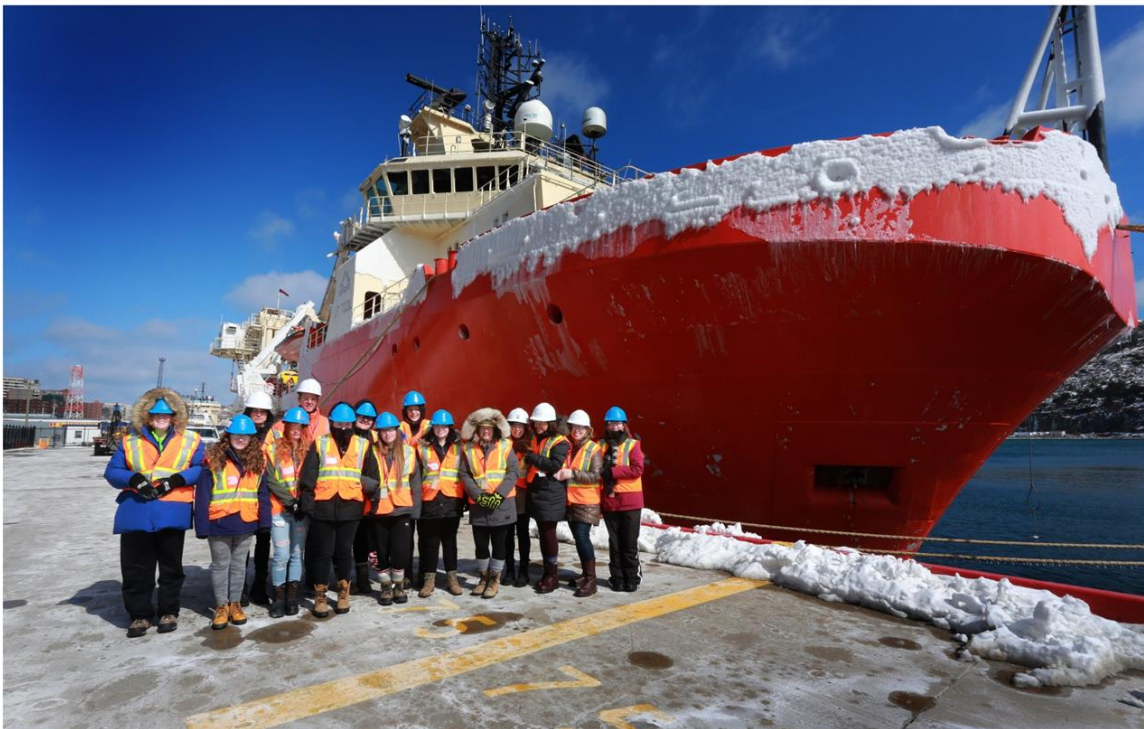
Techsploration participants on a vessel tour – March 2017