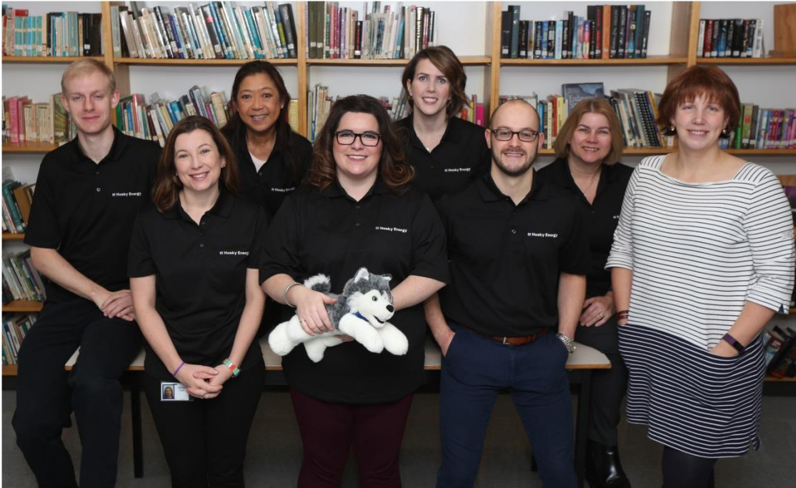
Husky staff provide mentorship in the Junior Achievement Program – January 2017