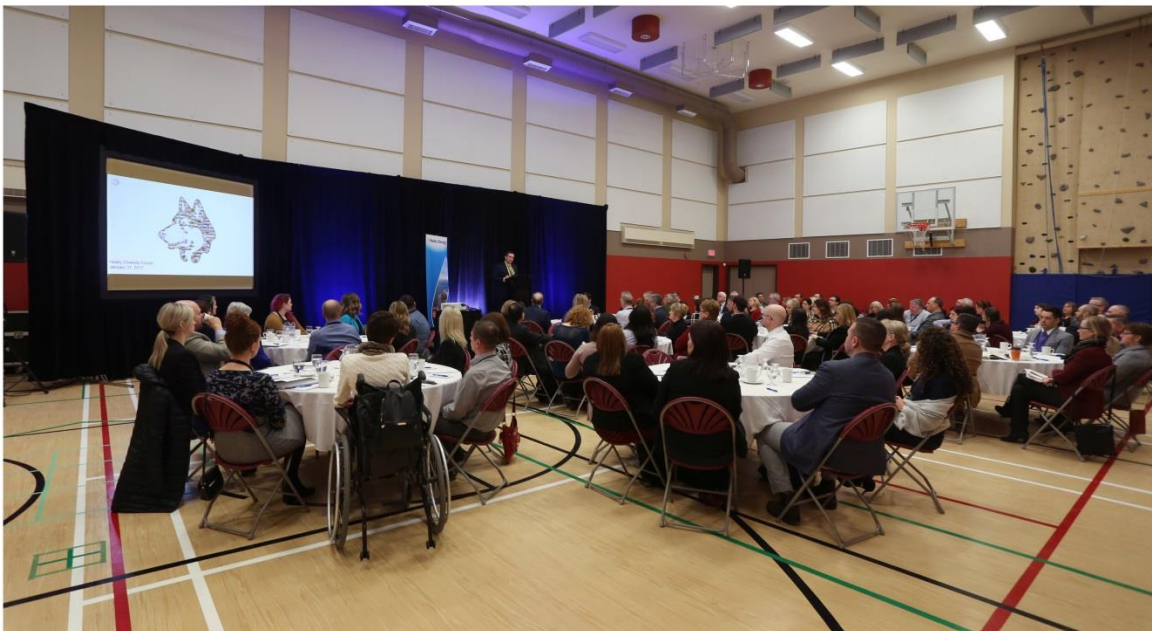
Husky hosts its Annual Diversity Forum – January 2017