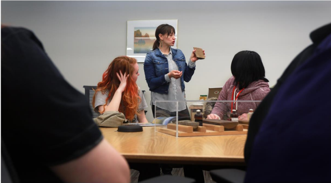
Husky offers facility tours and education for Techsploration participants – March 2017