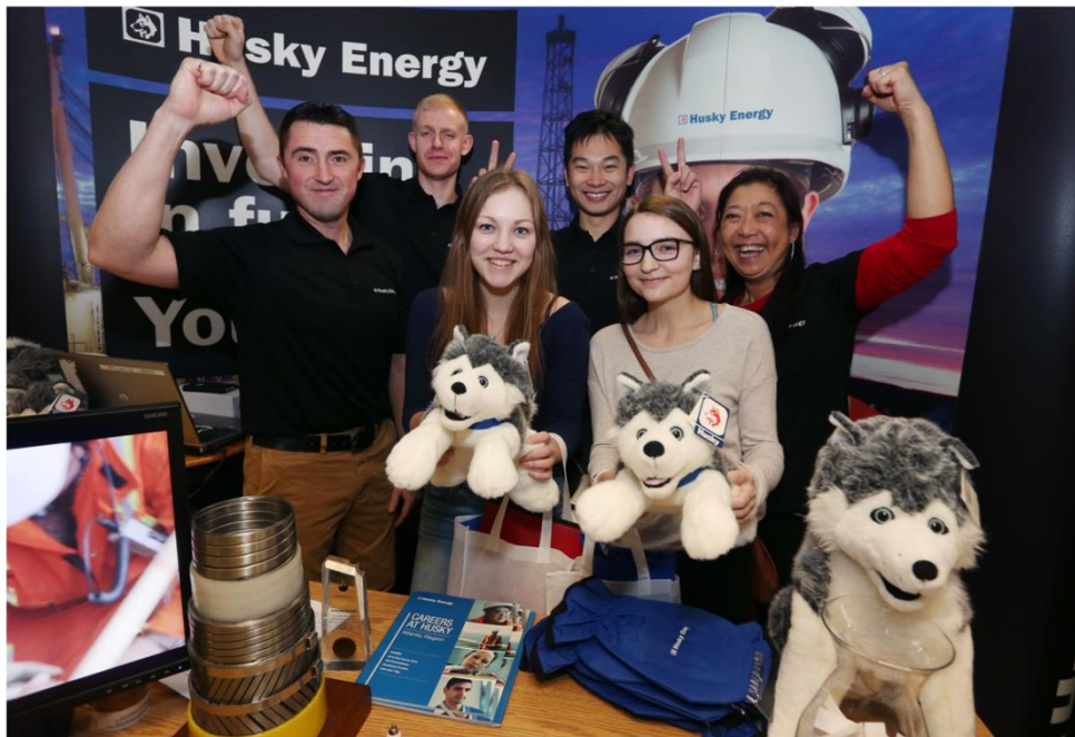
Husky employees attend MUN Energy Day as part of Oil and Gas Week – February 2016