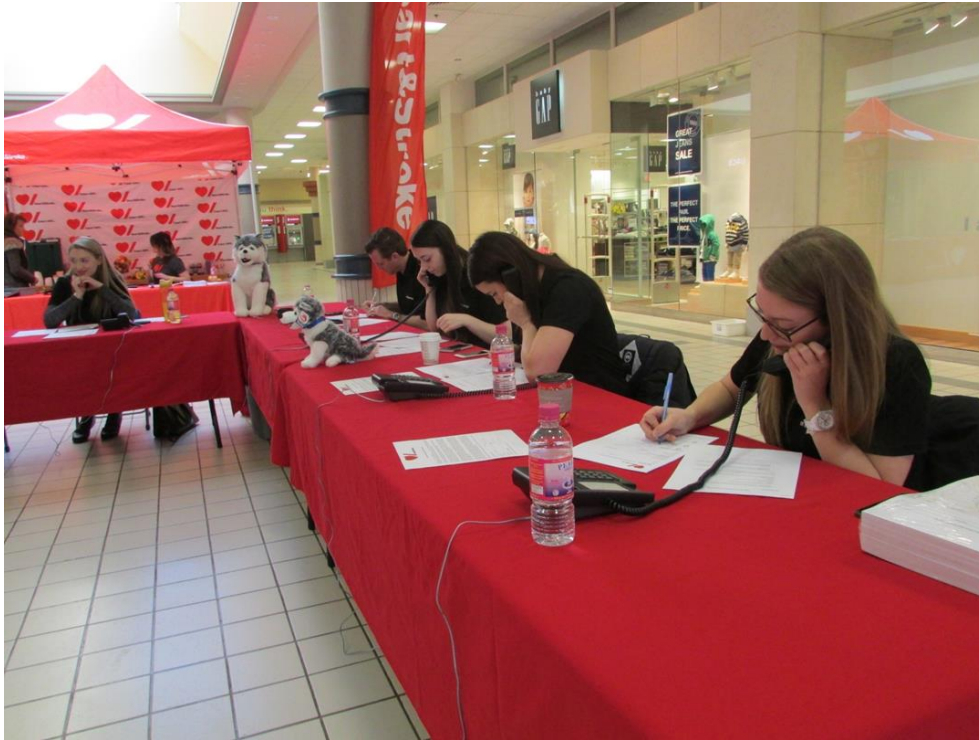
Husky volunteers take calls at the Heart and Stroke Foundation NL Radiothon – February 2017