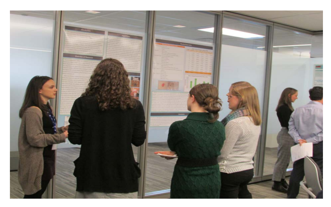
Science Fair finalists present their projects to Husky employees – May 2017