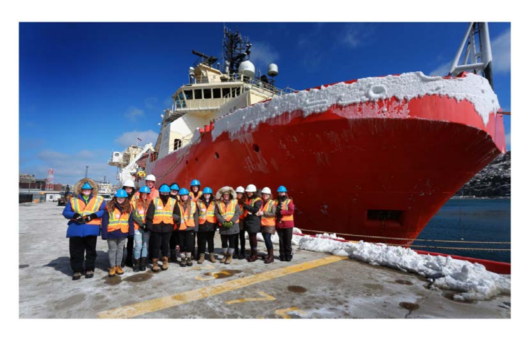
Techsploration participants on a vessel tour - March 2017