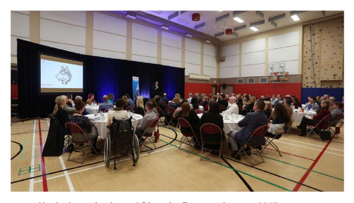
Husky hosts its Annual Diversity Forum – January 2017