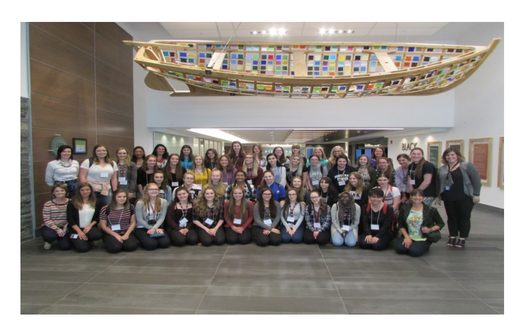
WISE students visit Husky office for 'Husky Day' to learn about company operations various industry professions – August 2017