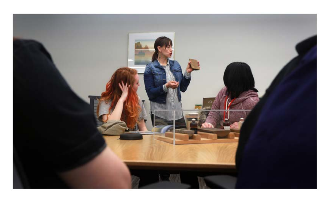
Husky offers facility tours and education for Techsploration participants March 2017