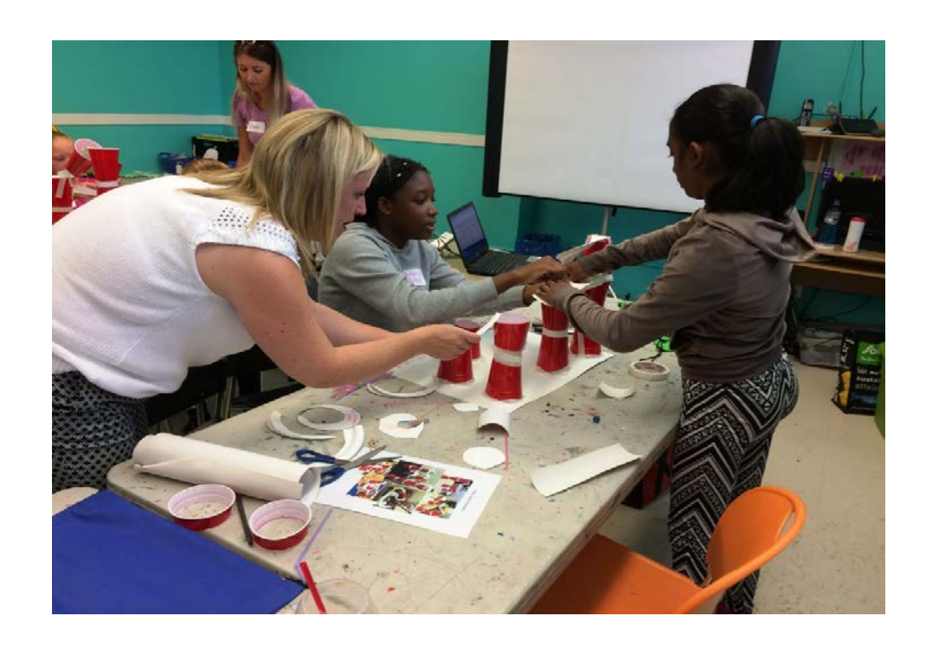
Husky volunteers attend Engineering Solutions: Design, Empower, Impact at the Mundy Pond Boys and Girls Club August 2017