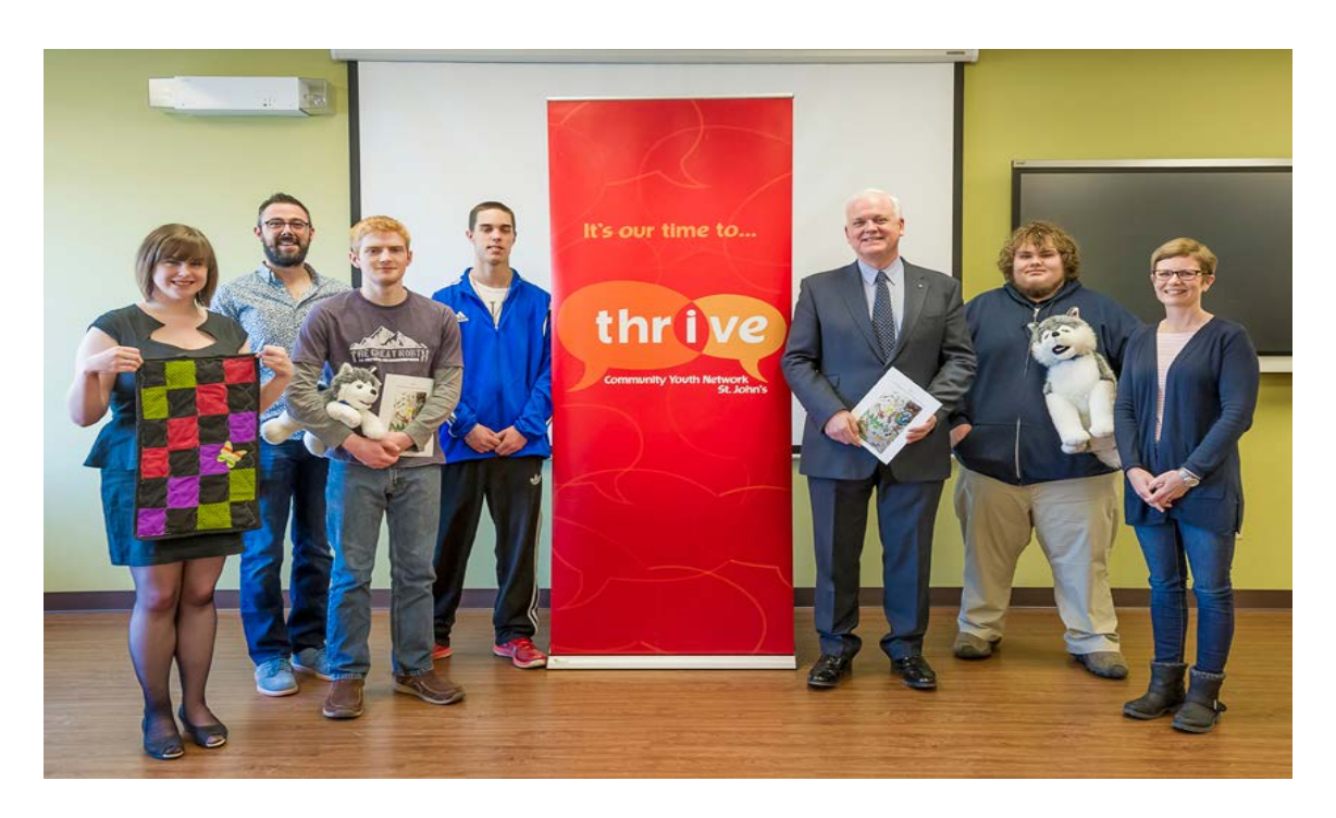
Husky donates to Thrive GED program – May 2017