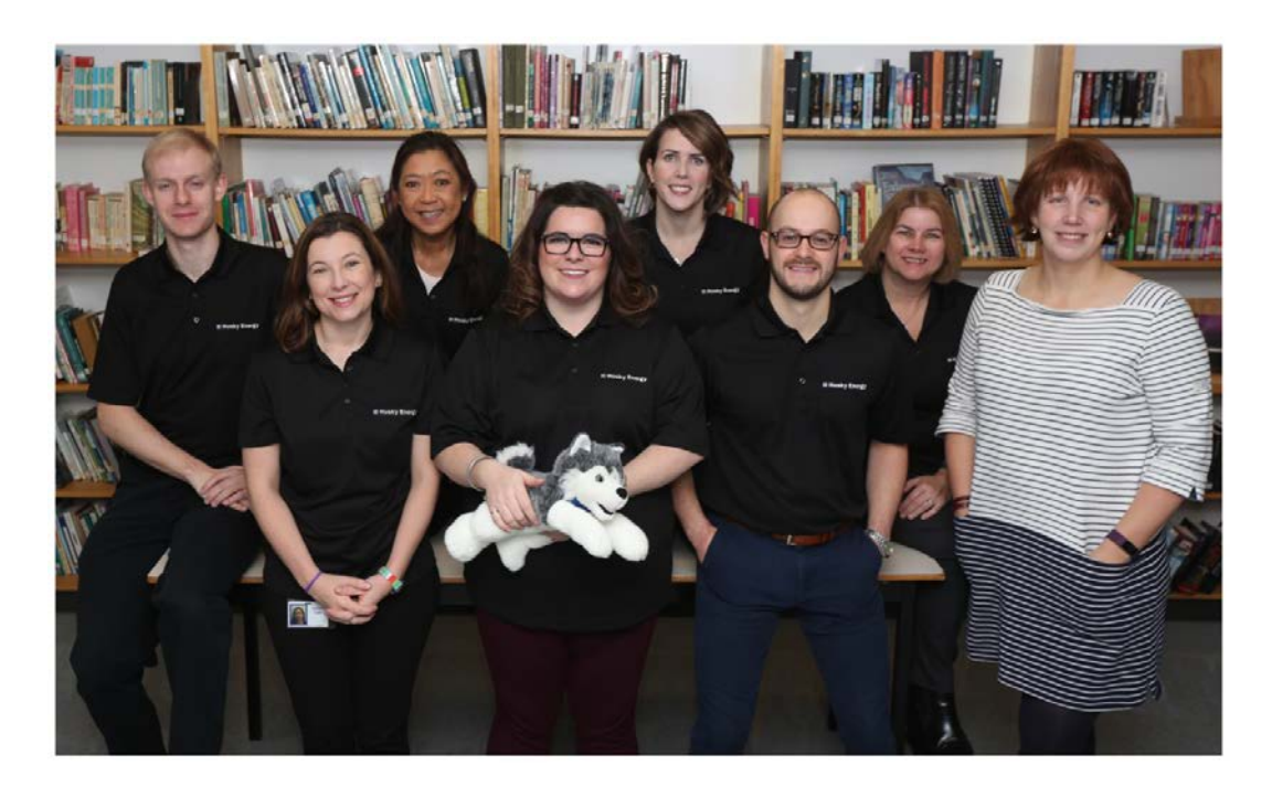
Husky staff provide mentorship in the Junior Achievement Program–January 2017