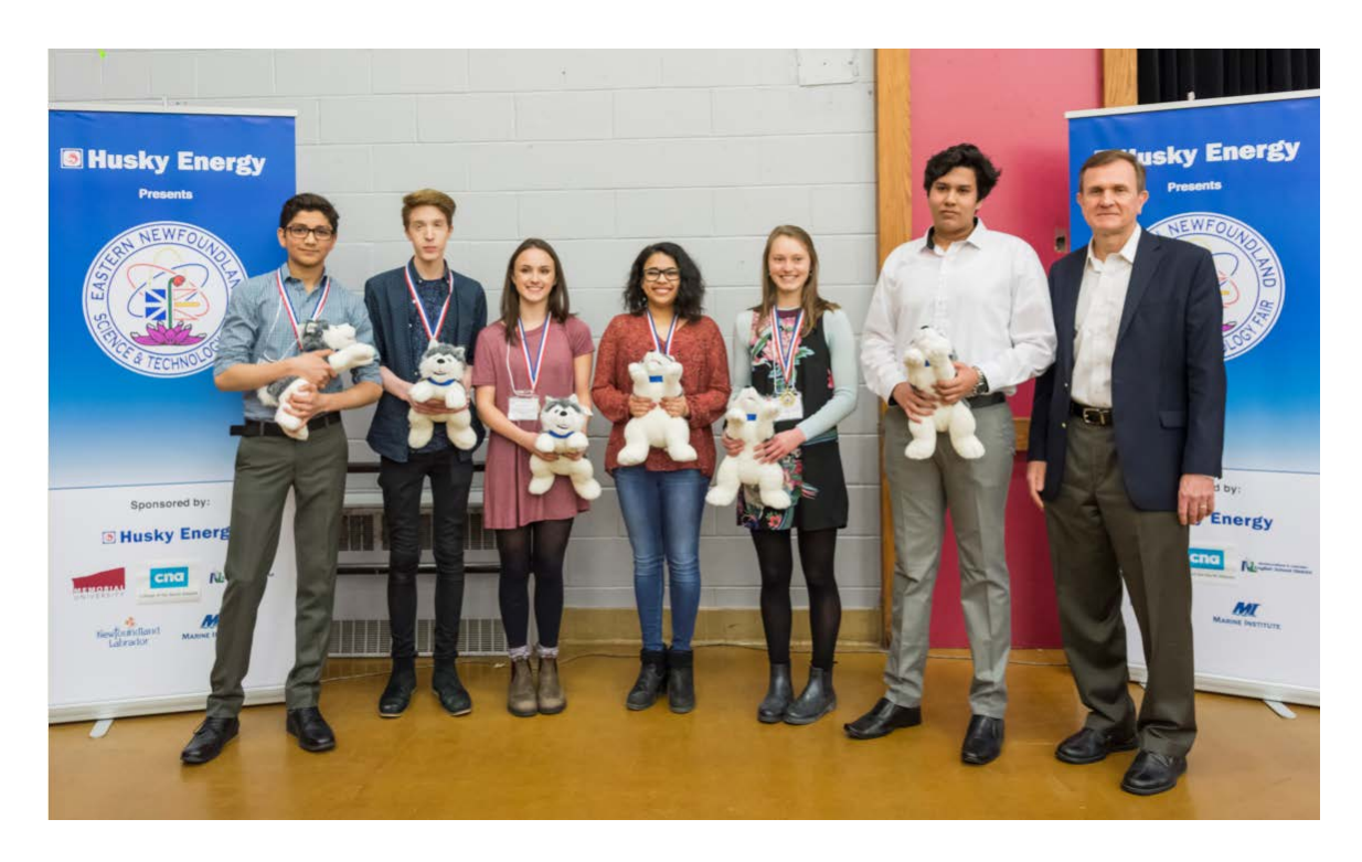
Husky Energy Eastern Science and Technology Fair - April 2017