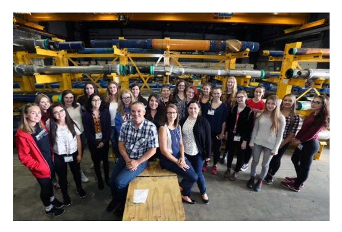
Husky organizes a day of activities for WISE participants - August 2016