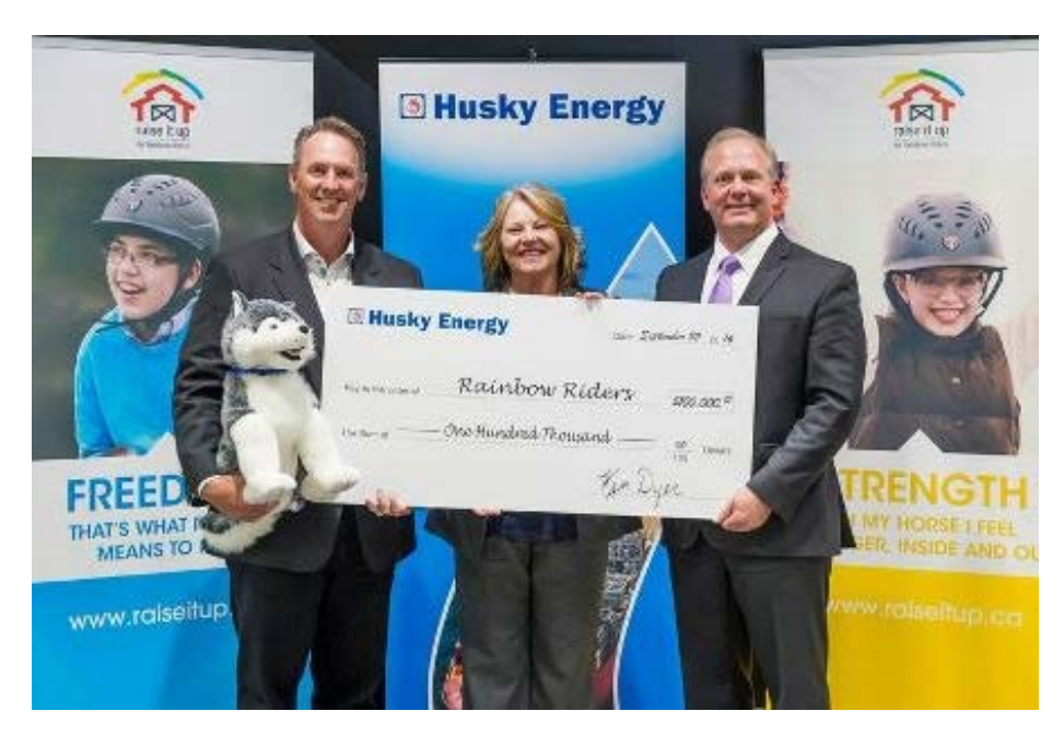
Husky donates $100,000 to Rainbow Riders Raise it Up campaign – September 2016