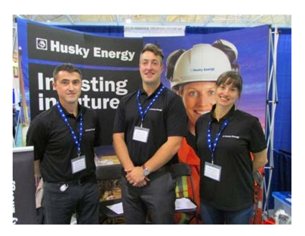
Husky representatives attend MUN Career and Graduate School Fair - September 2016