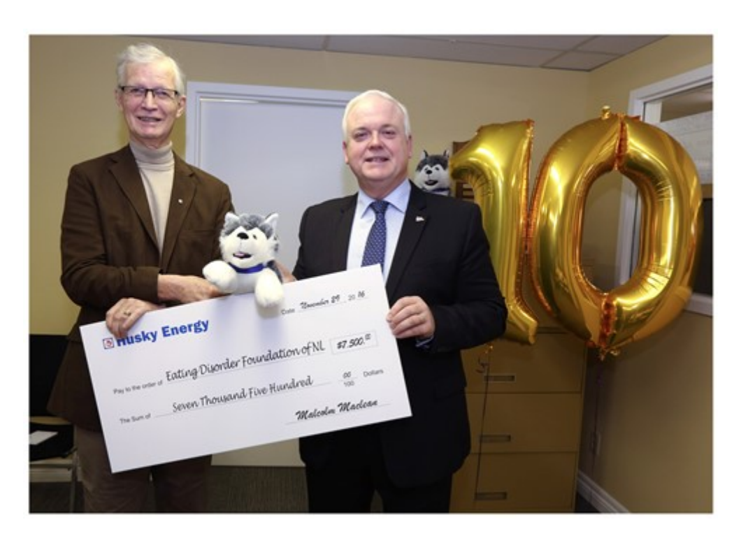
Husky makes contribution to the Eating Disorder Foundation - November 2016