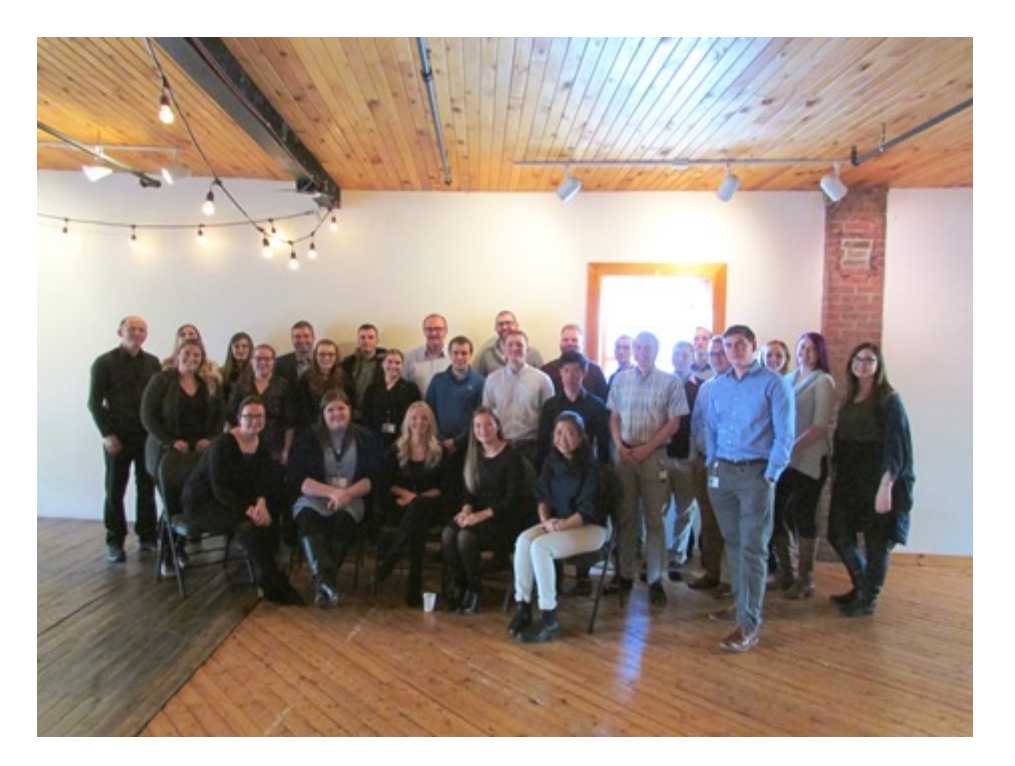
Husky's Women's Leadership Network holds a student mentoring event – December 2016