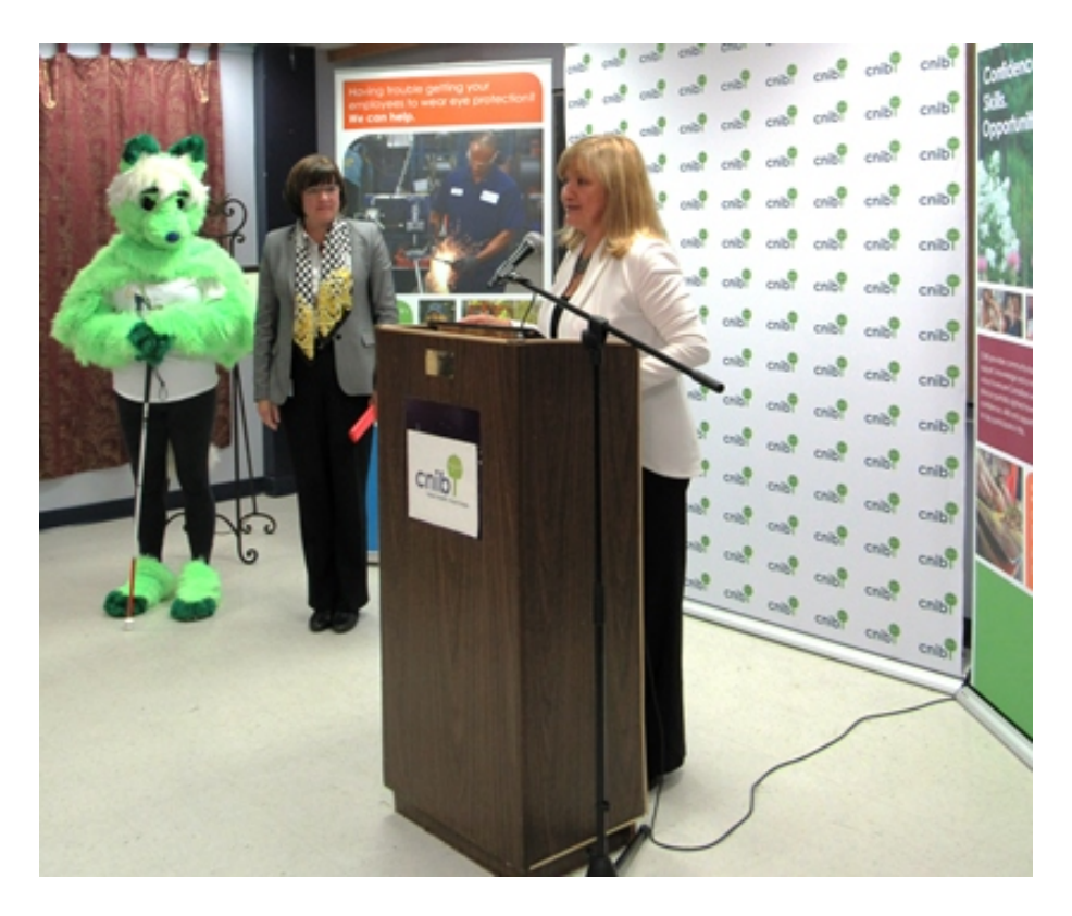
Husky receives the 2016 CNIB Community Partner Award – October 2016