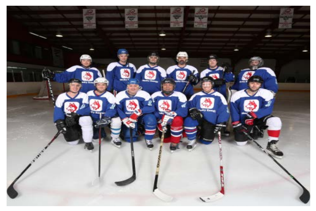
Husky staff participate in the Offshore Workers Memorial Fund Hockey Tournament -March 2016