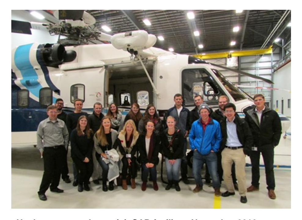
Husky co-op students visit SAR facility - November 2016