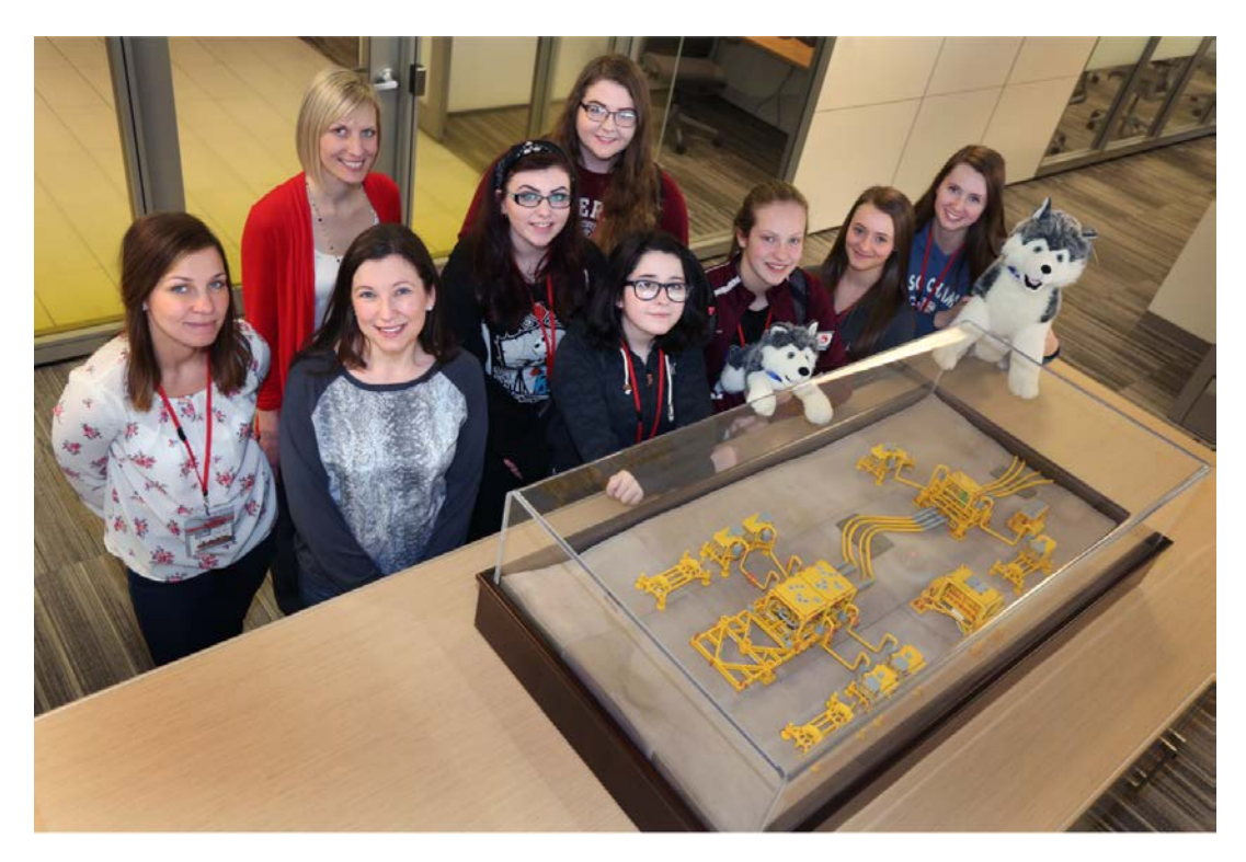
The Techsploration Program tours Husky facilities - April 2016