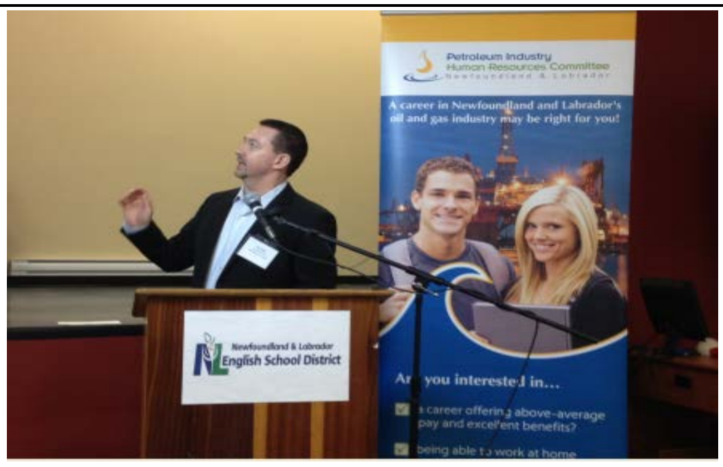
Husky Staff Participate in the Petroleum Industry Human Resource Committee's Educator's Forum in Gander – March 2016