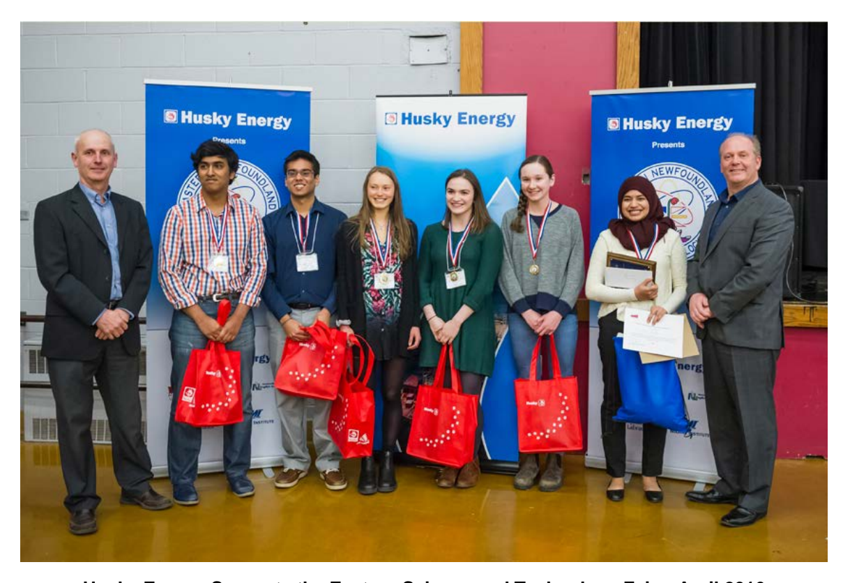
Husky Energy Supports the Eastern Science and Technology Fair – April 2016