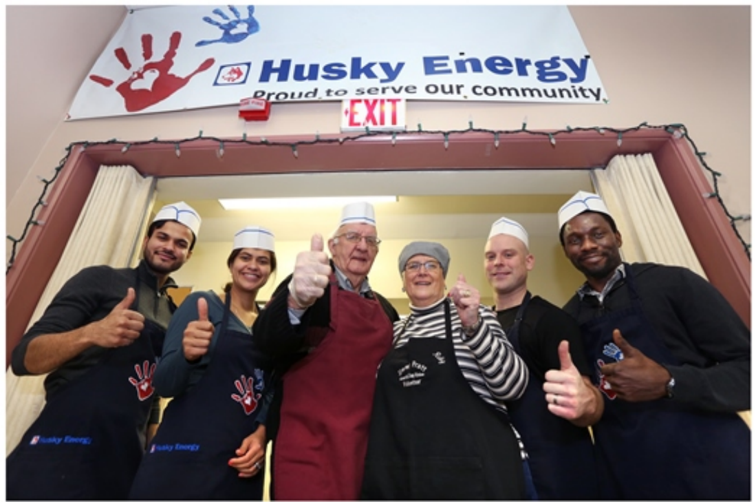
Husky staff volunteer at the Jimmy Pratt Breakfast Program - February 2016