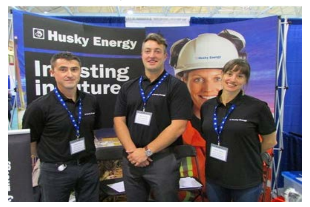
Husky representatives attend MUN Career and Graduate School Fair