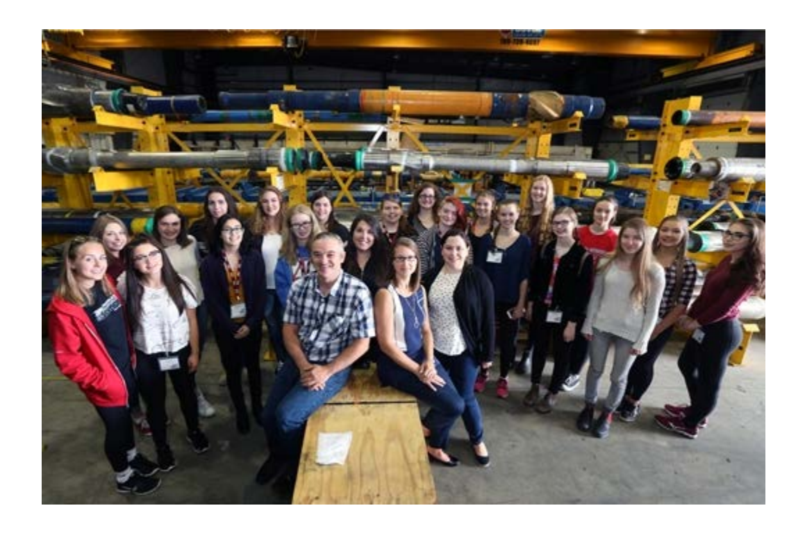
Husky organizes a day of activities for WISE participants – August 2016