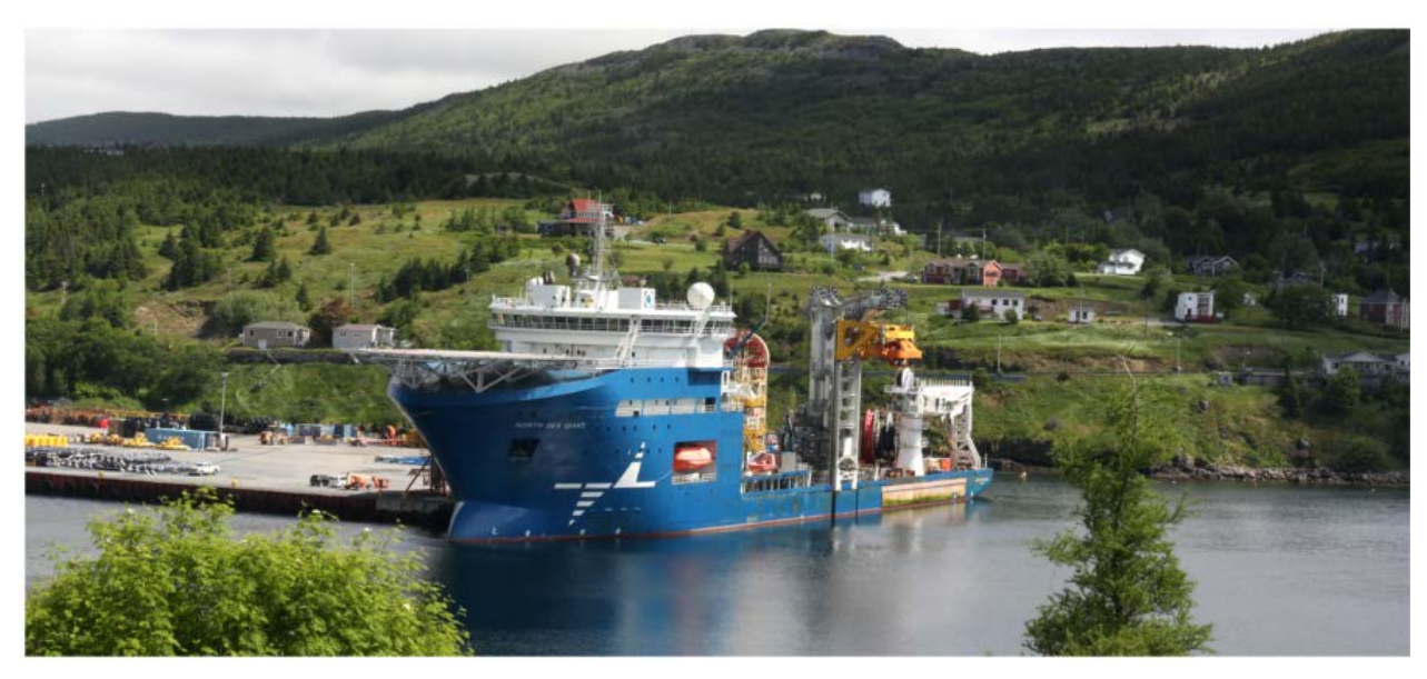
One of the largest and most advanced subsea construction vessels in the world, the North Sea Giant , arrives in Bay Bulls to support the 2016 SeaRose FPSO Annual Maintenance Program – June 2016