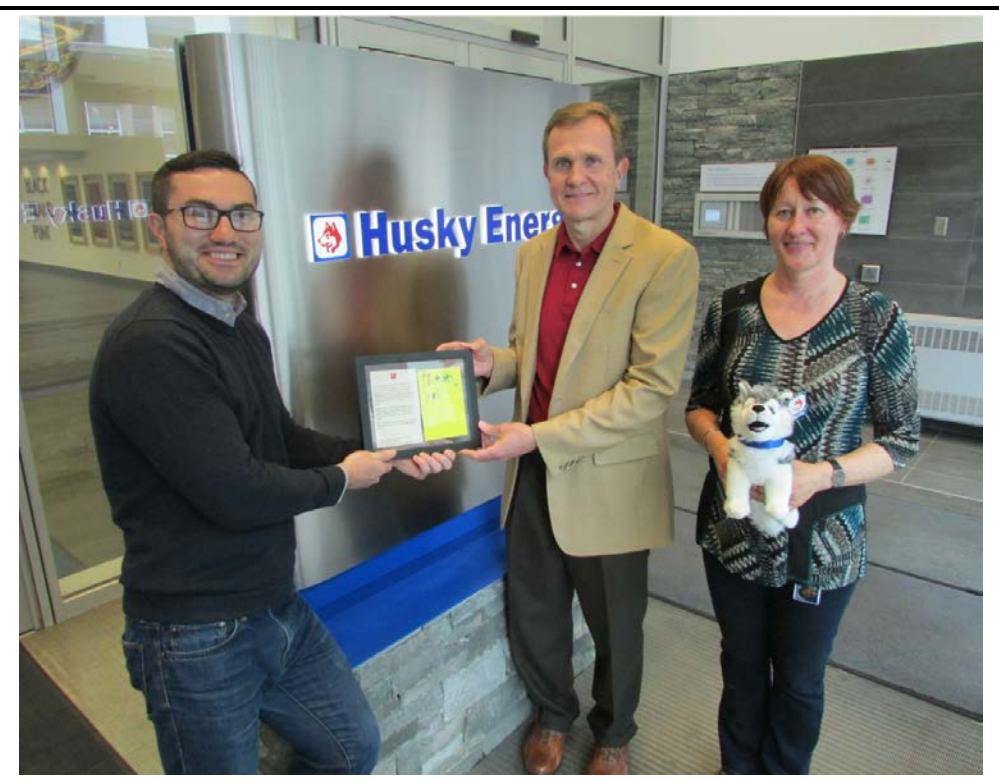
Easter Seals presents Husky with a Plaque of Appreciation-June 2016