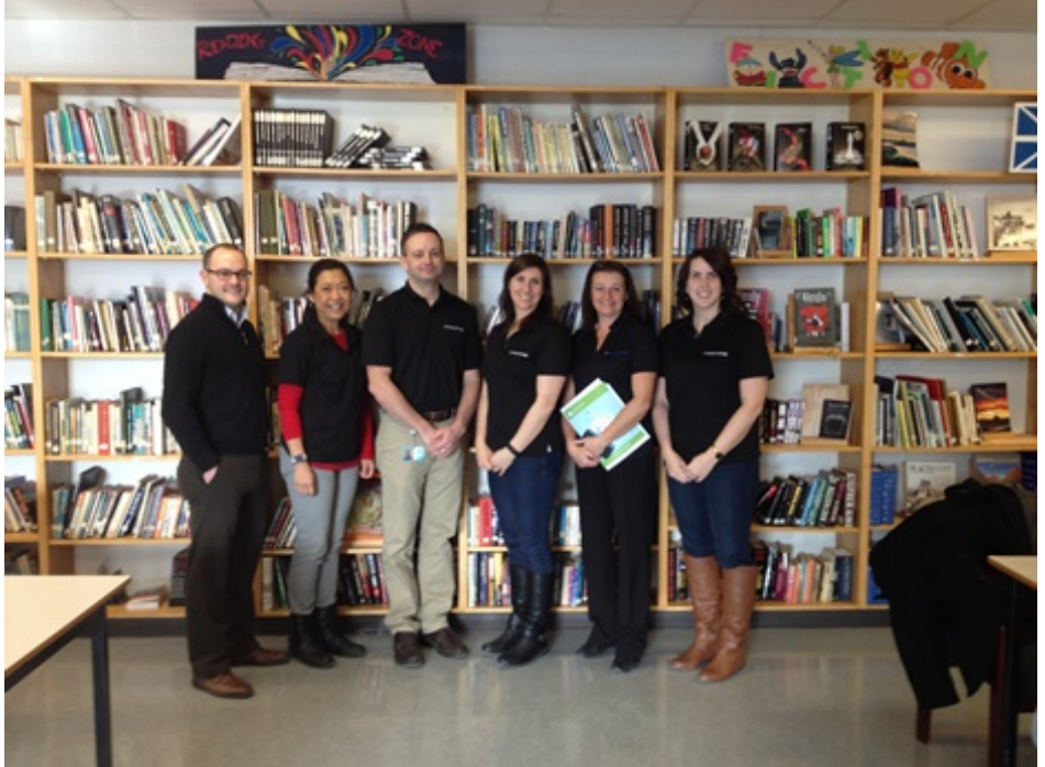
Husky staff provide mentorship in the Junior Achievement Program- January, 2016