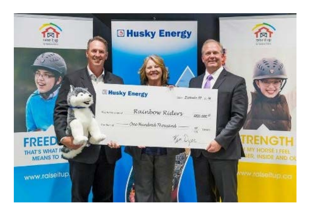
Husky donates $100,000 to Rainbow Riders Raise it Up campaign