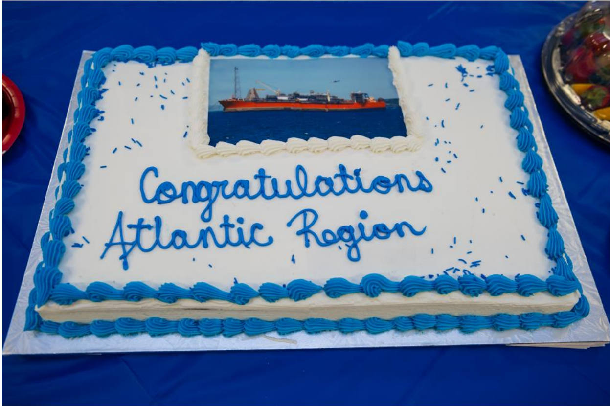
Husky celebrates 10 years of production from the SeaRose – November, 2015