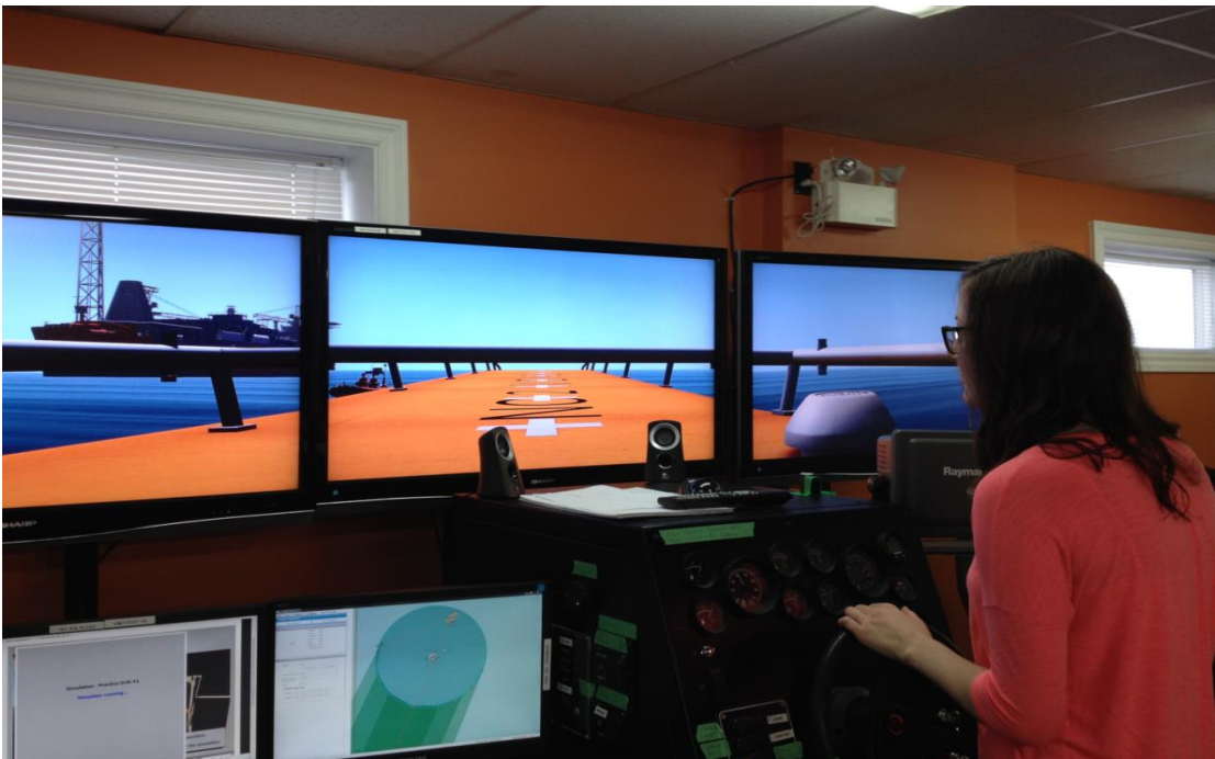
Husky work term students tour the Virtual Marine Technologies (VMT) facility