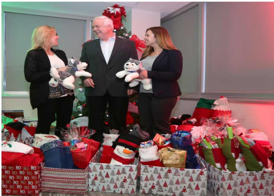
Husky donates Christmas stockings to Daffodil Place – December, 2015