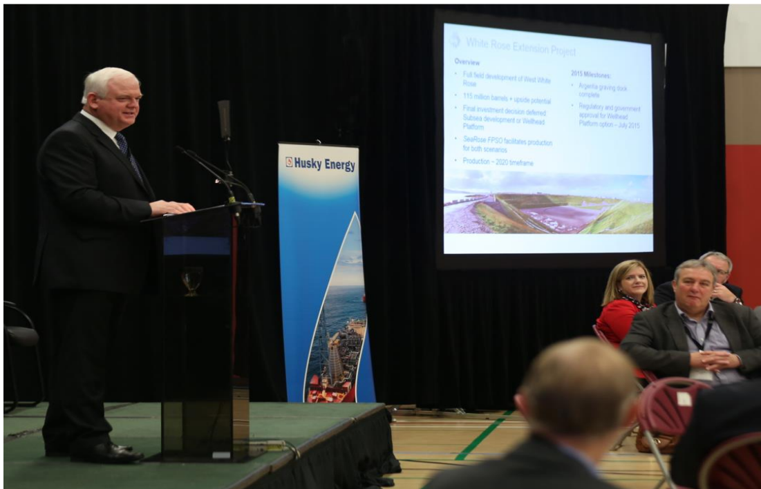
Husky hosts its annual Diversity Forum at the Easter Seals House