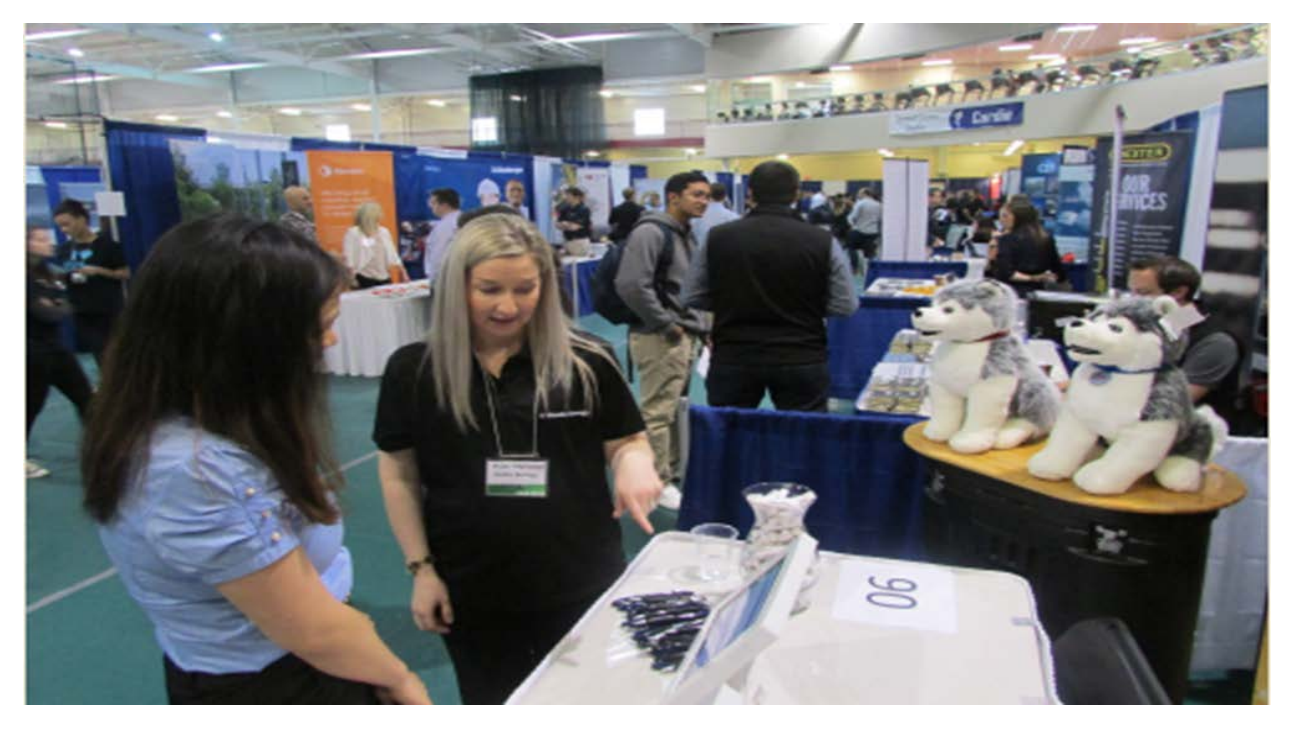
Husky Attends MUN Career Fair – August 2015