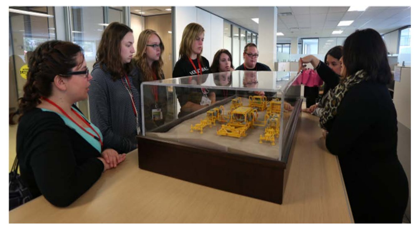
Husky Supports the WISE (Women in Science, Technology and Engineering) Program with Guided Tours and Information Sessions – August 2015