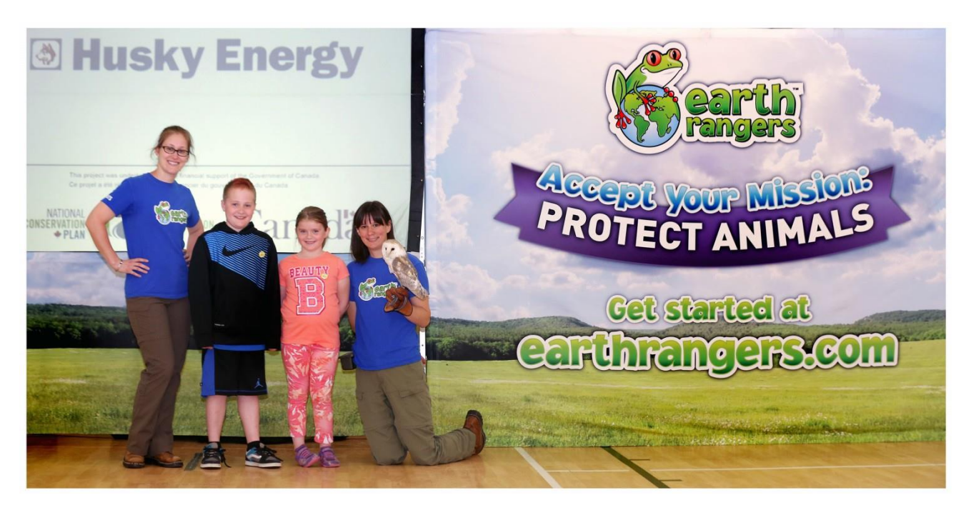
Earth Rangers Visit to Goulds Elementary June 2015