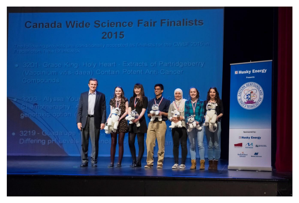
Husky Supports the 2015 Canada Wide Science Fair - April 2015