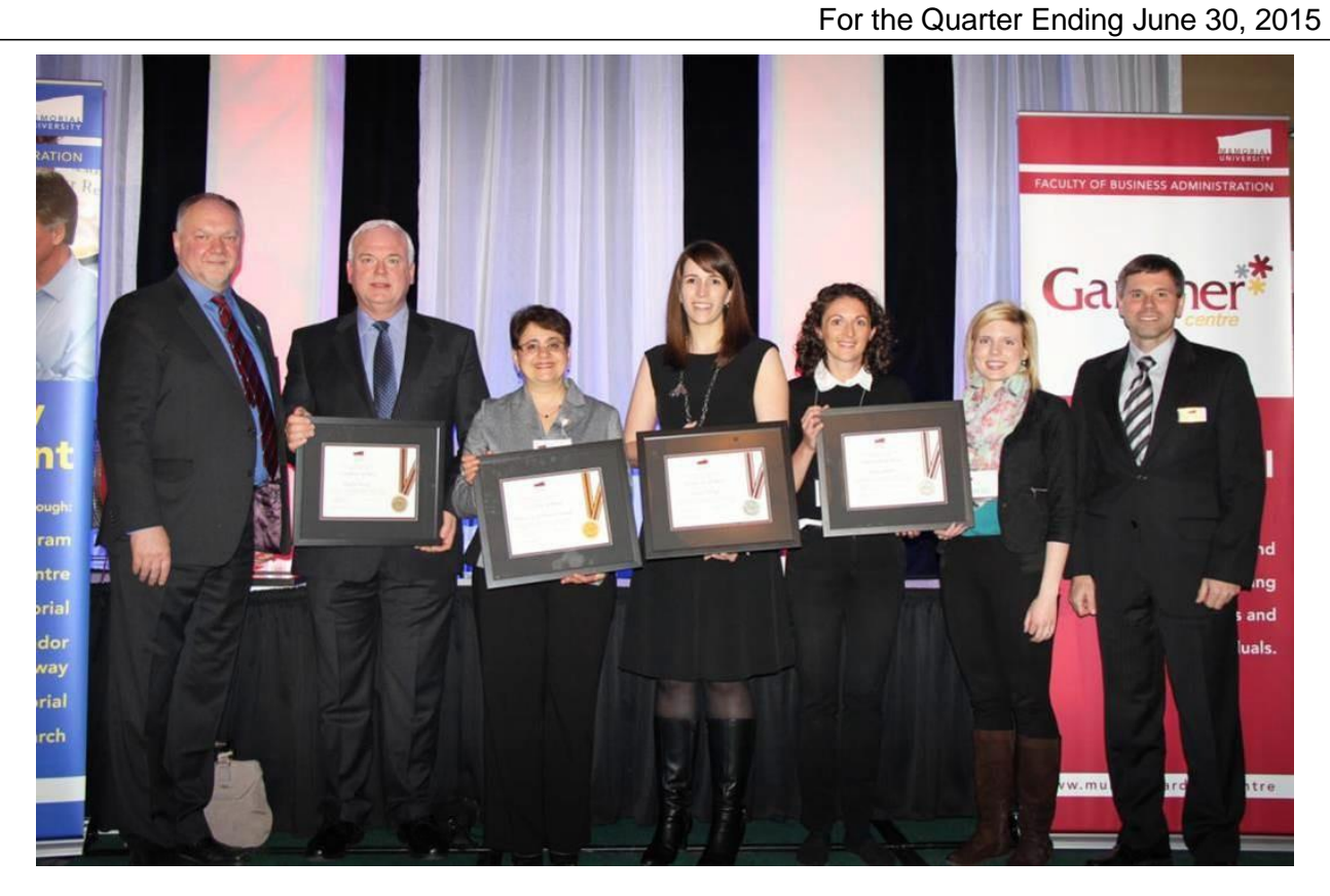
Husky Receives Award for 100 Hires of Business Co-op Students - May 2015