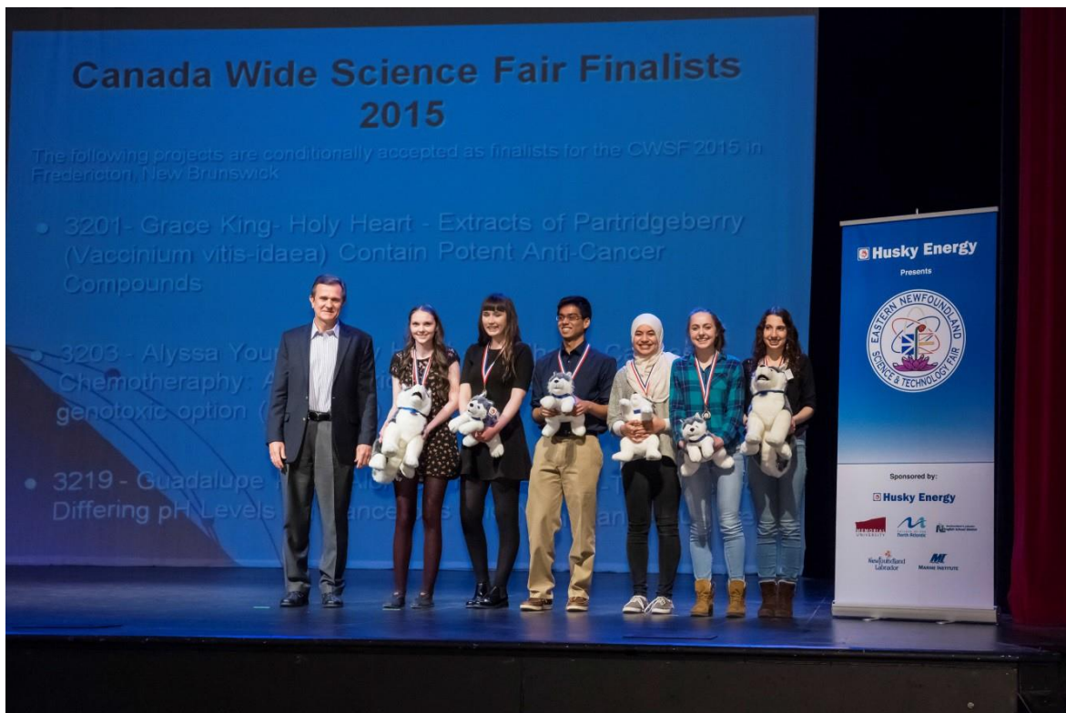
Husky Supports the 2015 Canada Wide Science Fair – April 2015