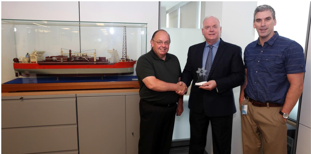
Husky Receives Thank You for Donation to Cancer Society – June 2015