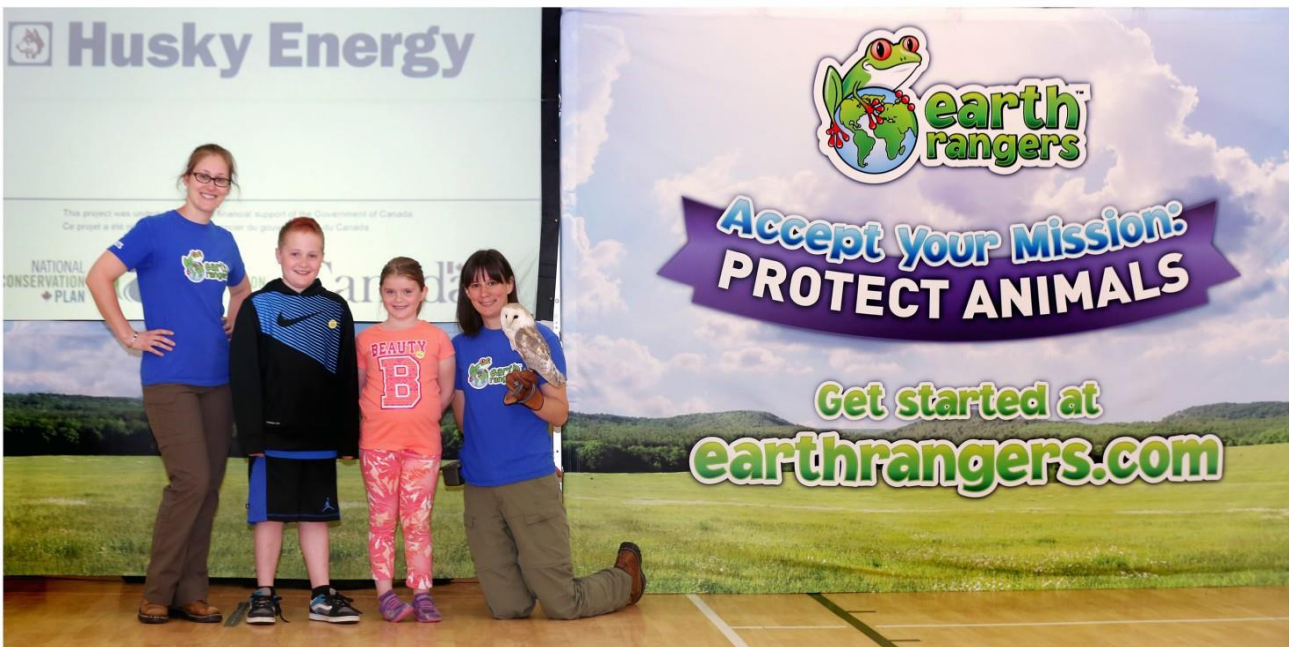
Earth Rangers Visit to Goulds Elementary June 2015