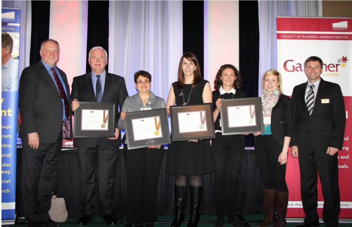
Husky Receives Award for 100 Hires of Business Co-op Students – May 2015