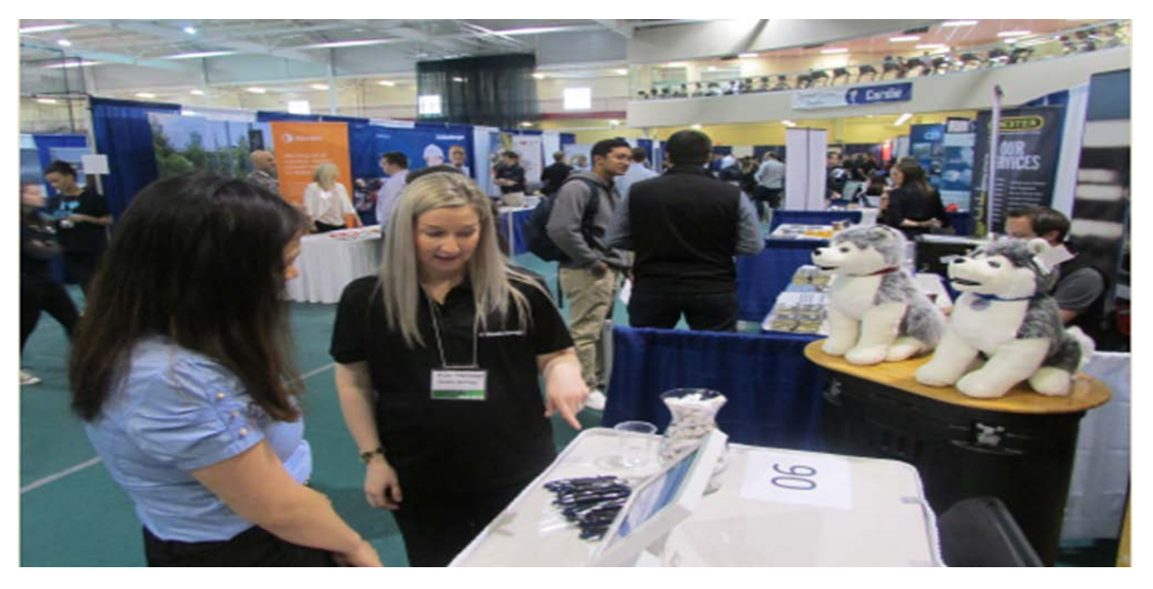
Husky Attends MUN Career Fair – August 2015