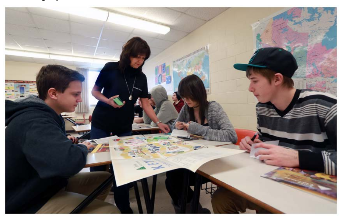
Junior Achievement – January 2015