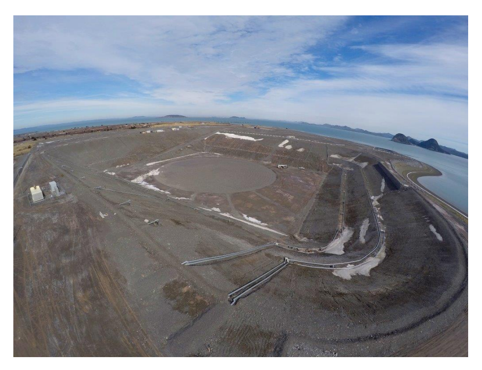
Completed Graving Dock at Argentia