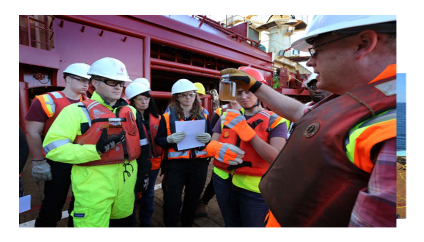
Husky Hosts Synergy Exercises - September 2015