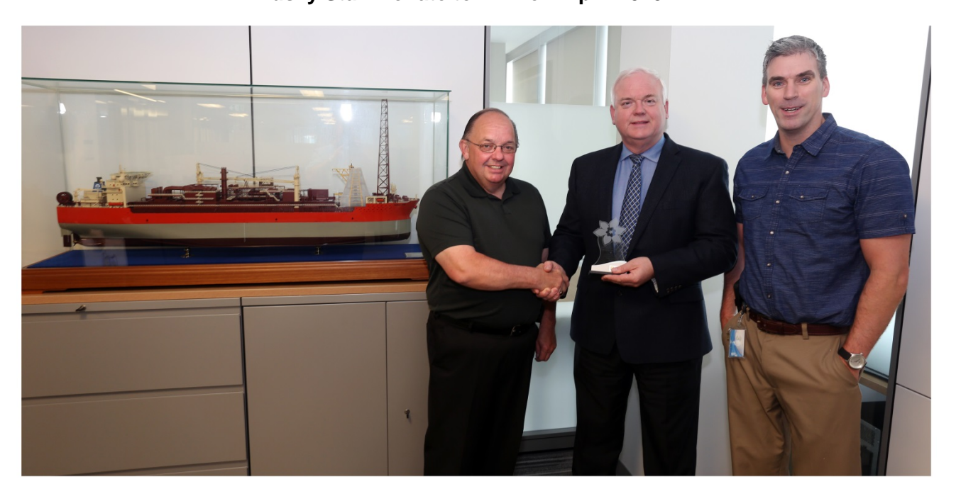
Husky Receives Thank You for Donation to Cancer Society – June 2015