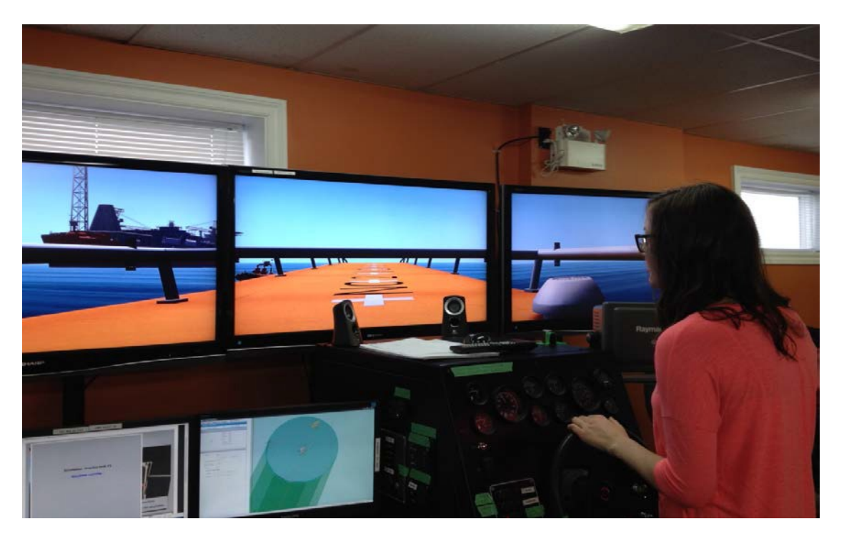
Husky Work Term Students Tour the Virtual Marine Technologies (VMT) Facility – December 2015