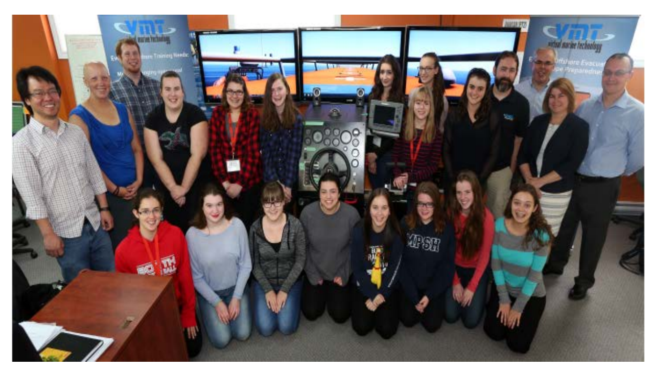
Husky Supports the WISE (Women in Science, Technology and Engineering) Program with Guided Tours and Information Sessions – August 2015