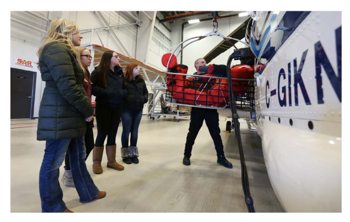
Tour of Cougar Helicopters – Techsploration – March 2015