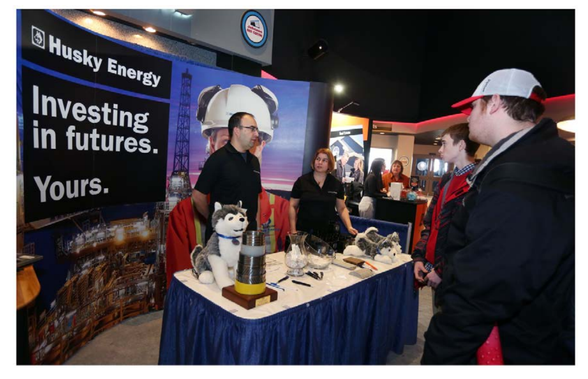
Energy Day 2015