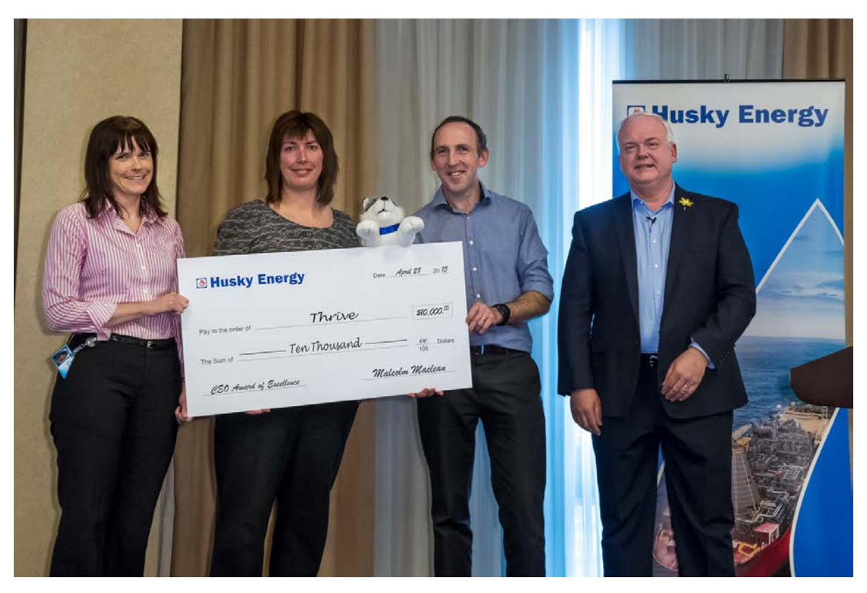
Husky Staff Donate to Thrive - April 2015