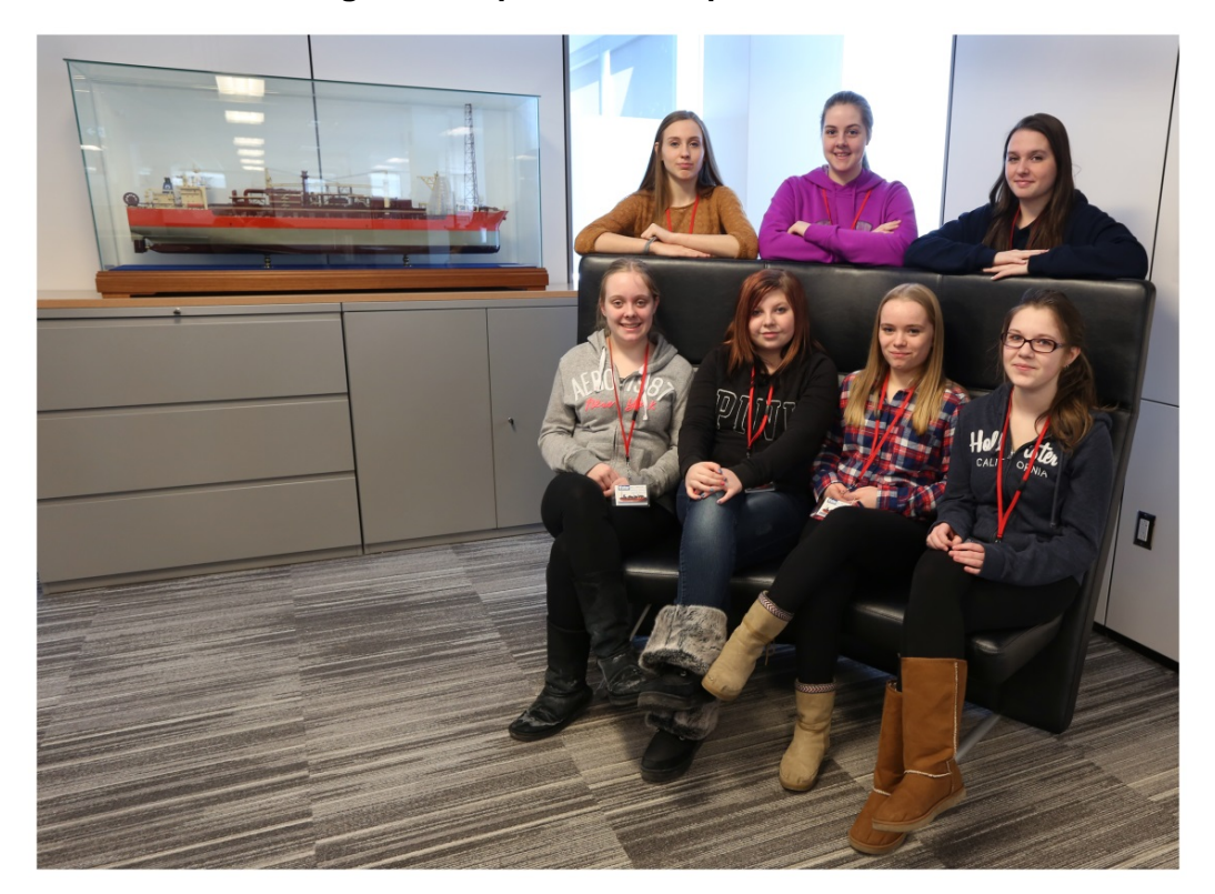
Tour of Husky Offices – Techsploration – March 2015