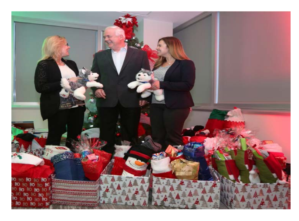
Husky Donates Christmas Stockings to Daffodil Place – December, 2015