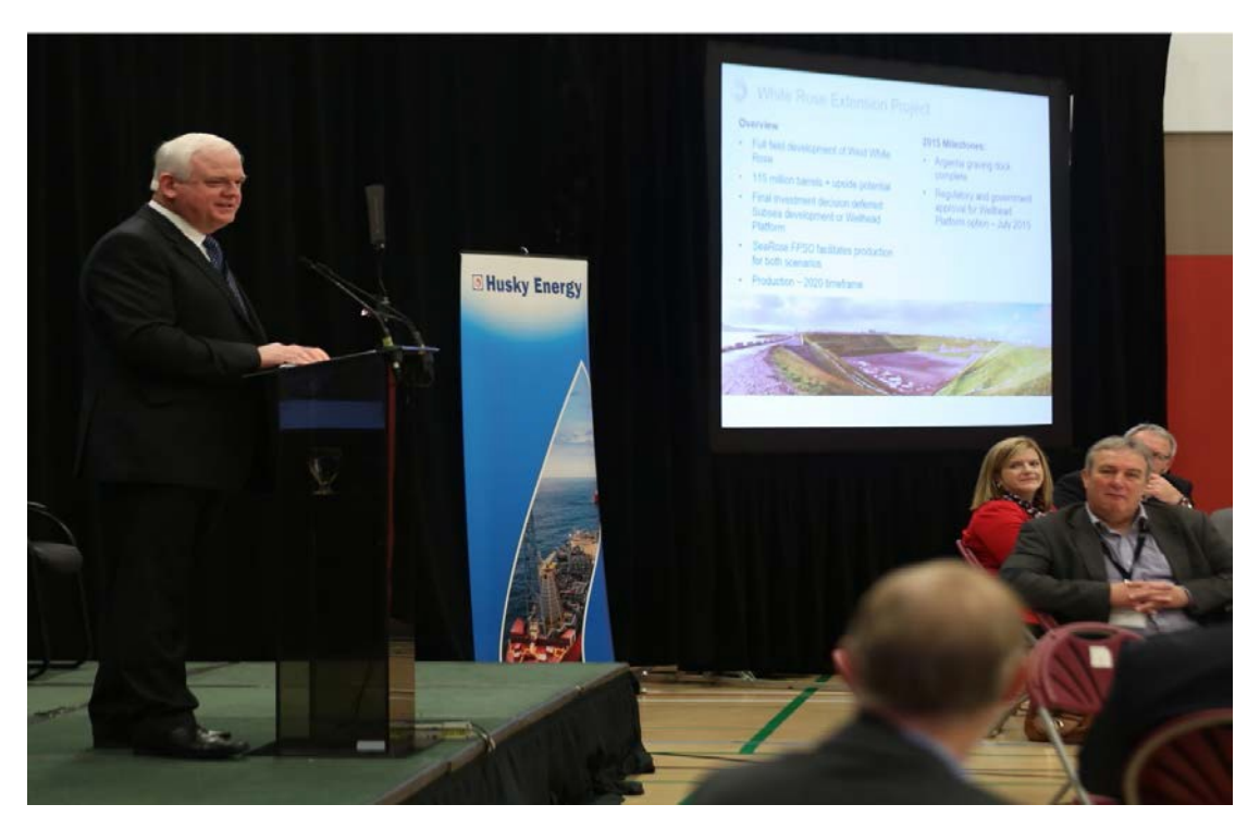
Husky Hosts its Annual Diversity Forum at Easter Seals House - November 2015