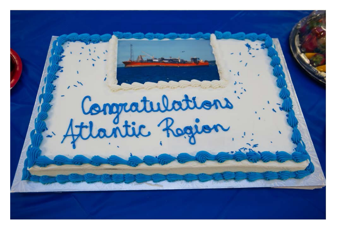
Husky Celebrates 10 years of Production from the SeaRose FPSO – November, 2015