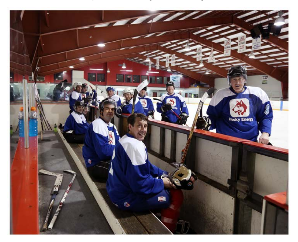
Husky Staff Support Fundraising for the Offshore Workers Memorial Fund