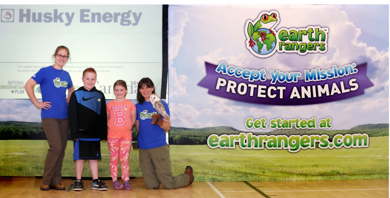
Earth Rangers Visit to Goulds Elementary June 2015