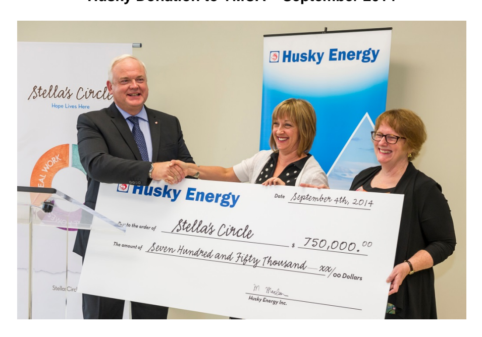
Husky Donation to Stella's Circle - September 2014