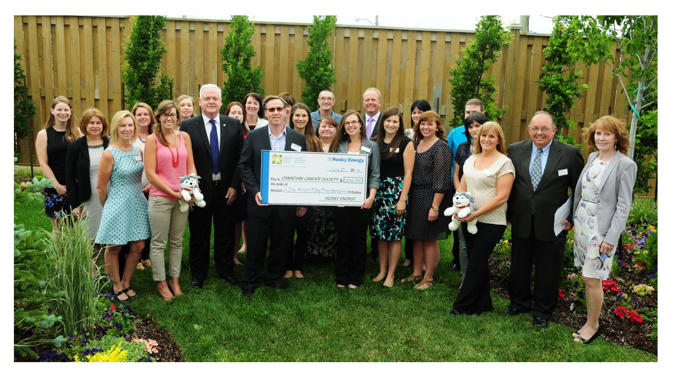
Husky Donation to Canadian Cancer Society – July 2014