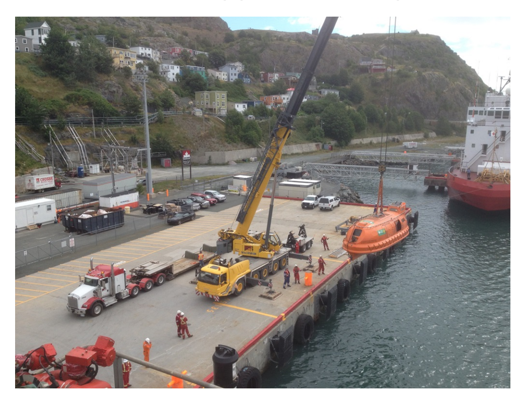
Preparation for Fit Testing of Wellservicer Lifeboat to SeaForce HRF