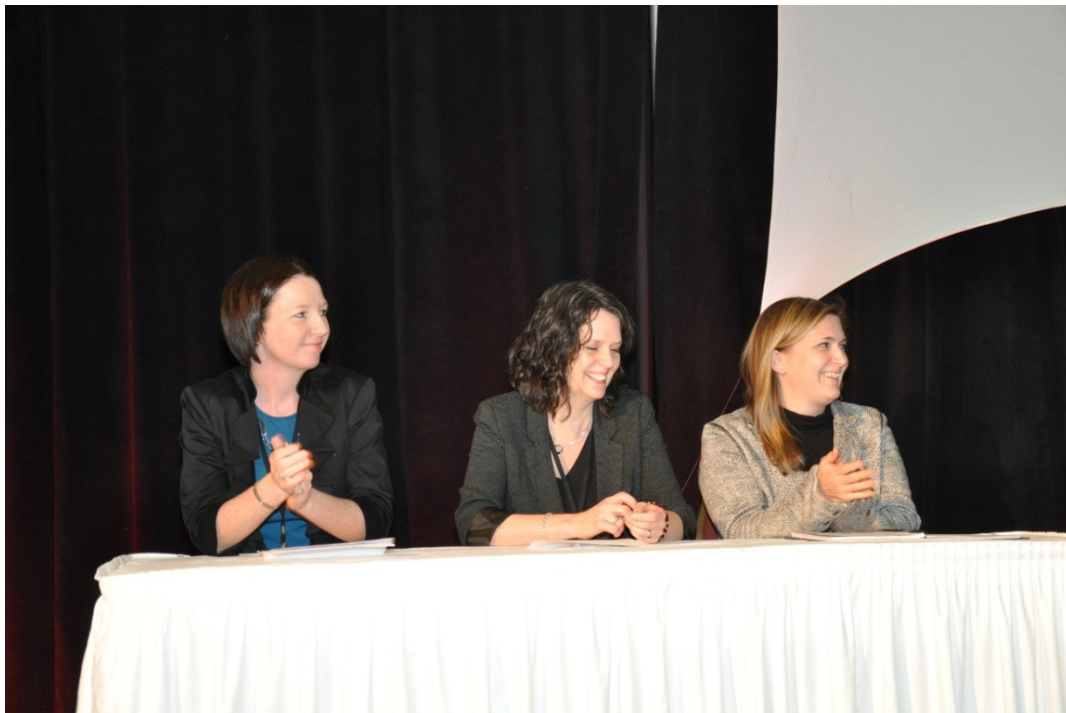
Husky Personnel Participate in “The Pitch” Panel at NLOWE’s 2014 Conference