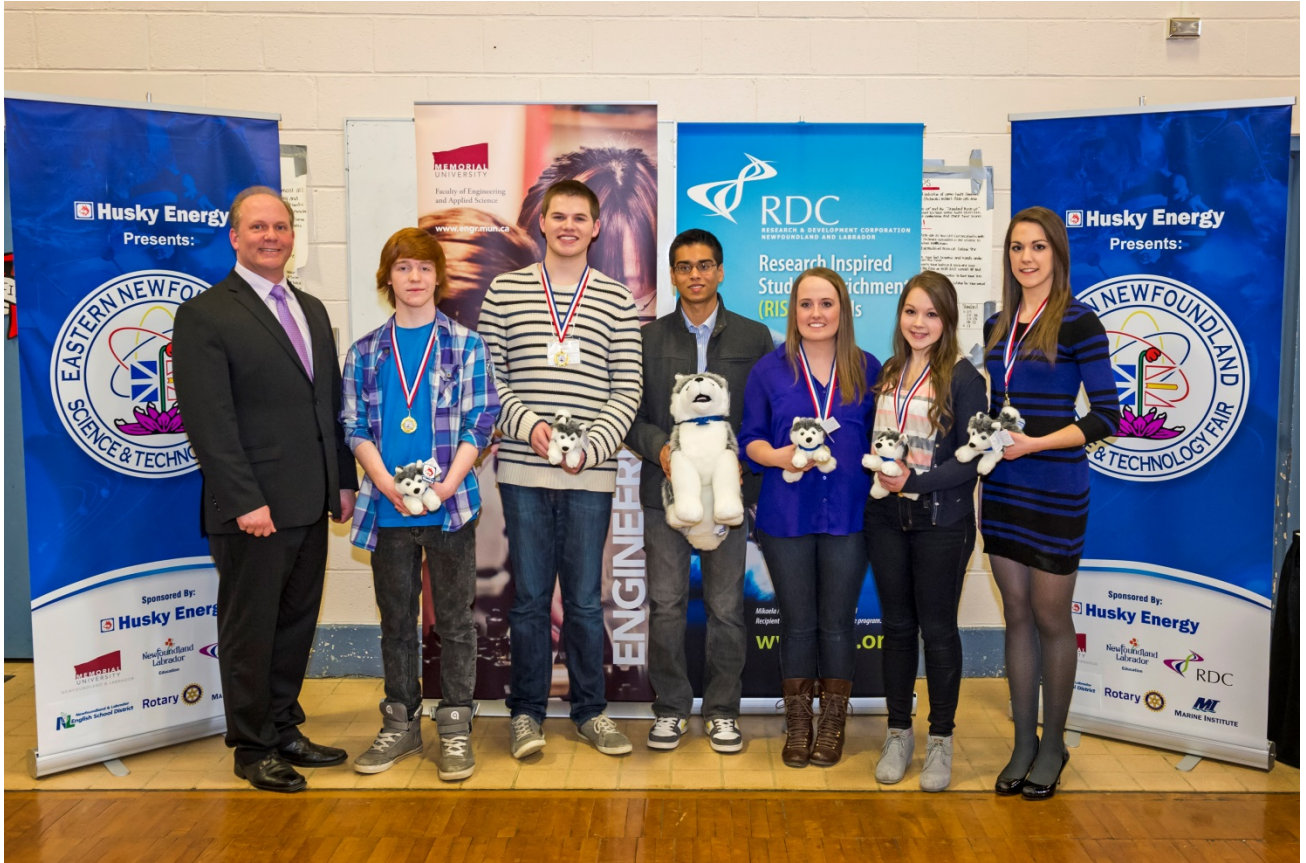
Husky Energy Eastern Newfoundland Regional Science Fair – April 2014