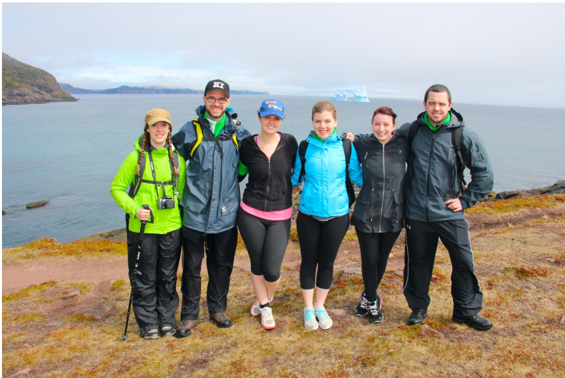
Husky staff participate in Tely Hike June 2014