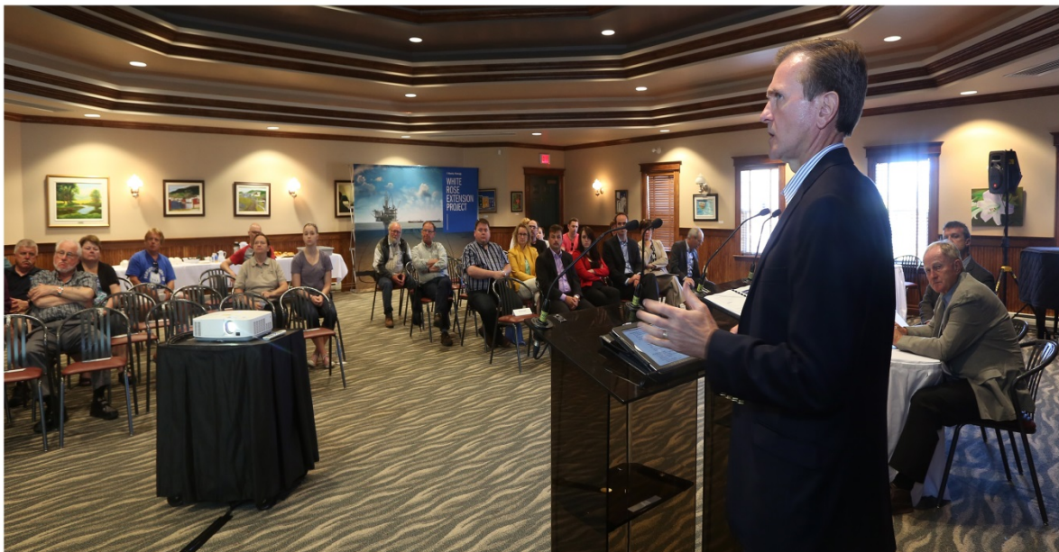
White Rose Extension Project Public Information Session in Placentia