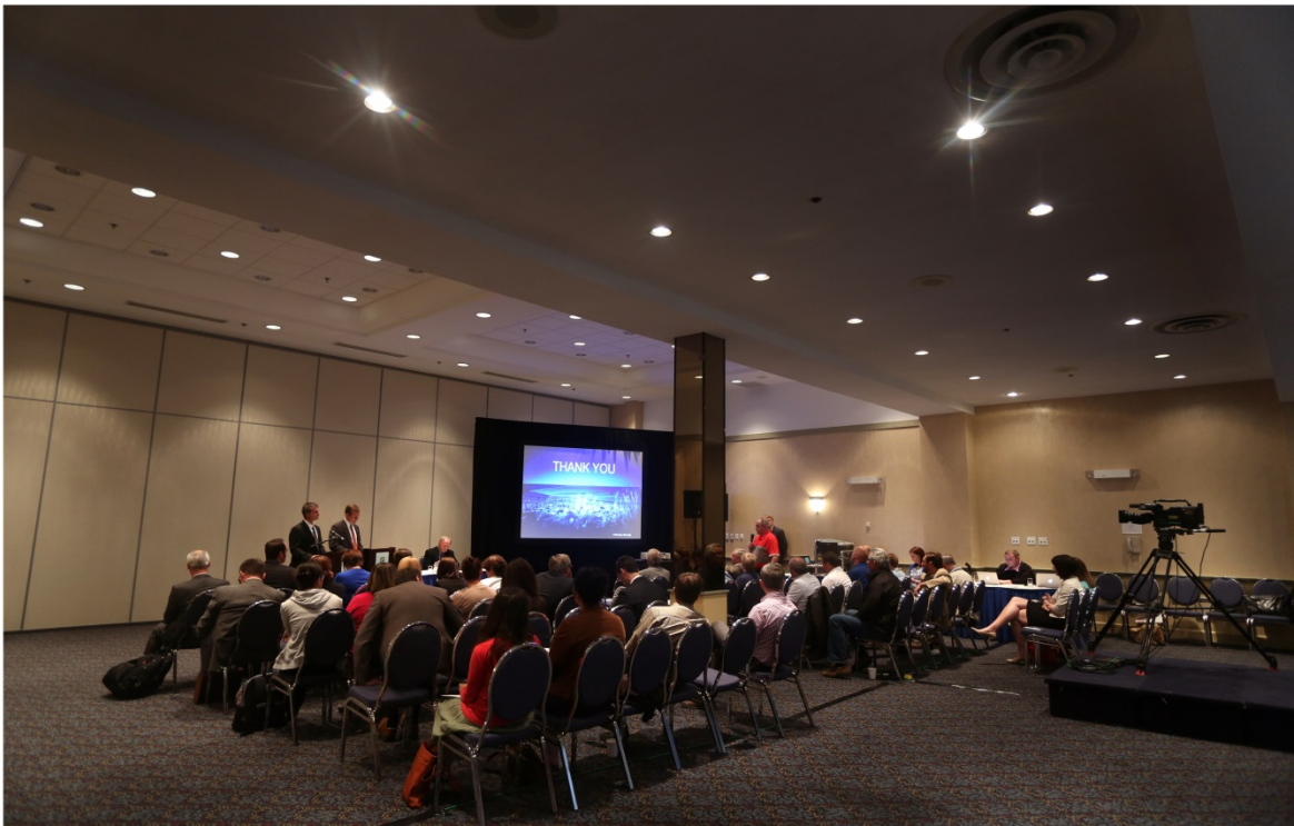
White Rose Extension Project Public Information Session in St. John's