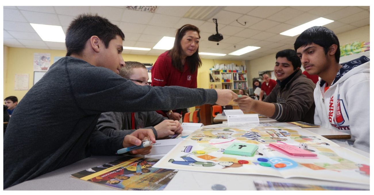
Junior Achievement - January 2014