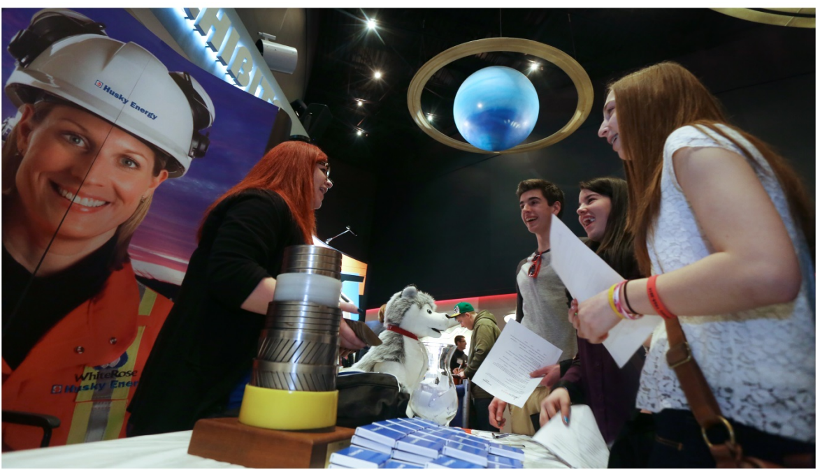
Energy Day – February 2014