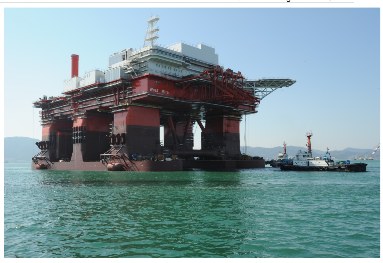
West Mira Launch - February 2014