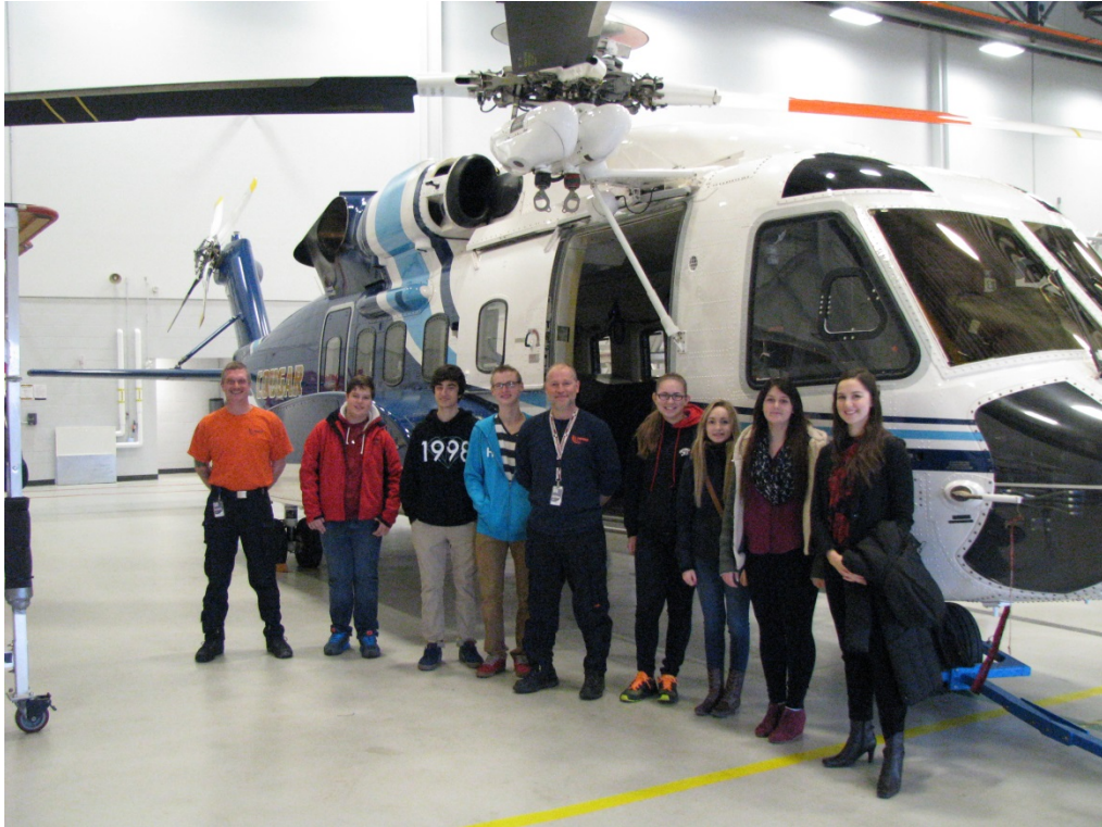
Take Our Kids To Work Day – November 2013