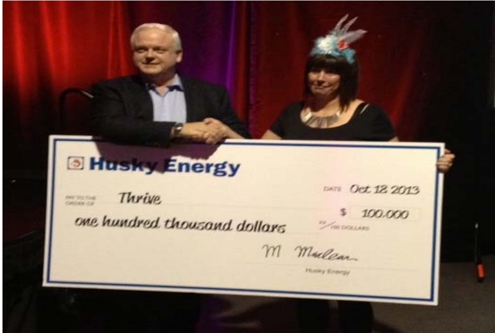
Thrive – October 2013