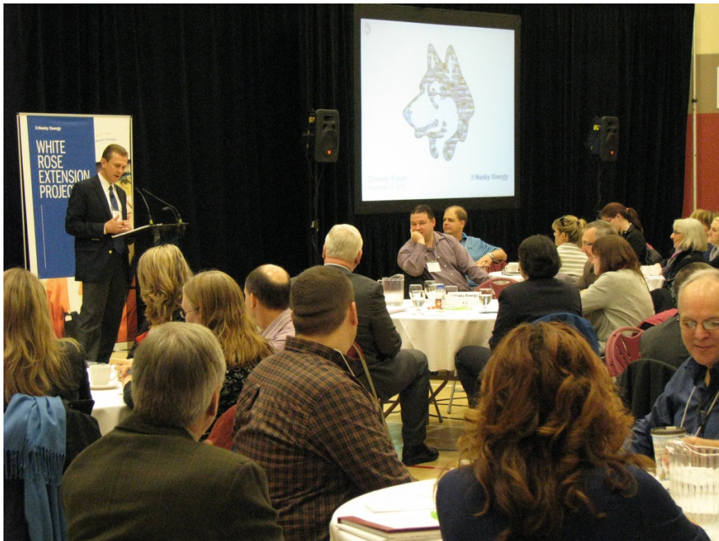
Husky Diversity Forum – November 2013