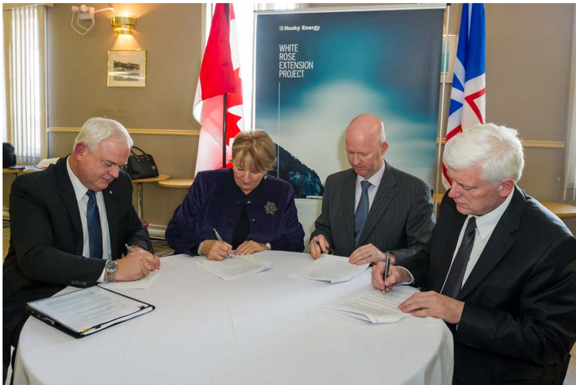
Signing of the WREP Framework Amending Agreement – October 2013