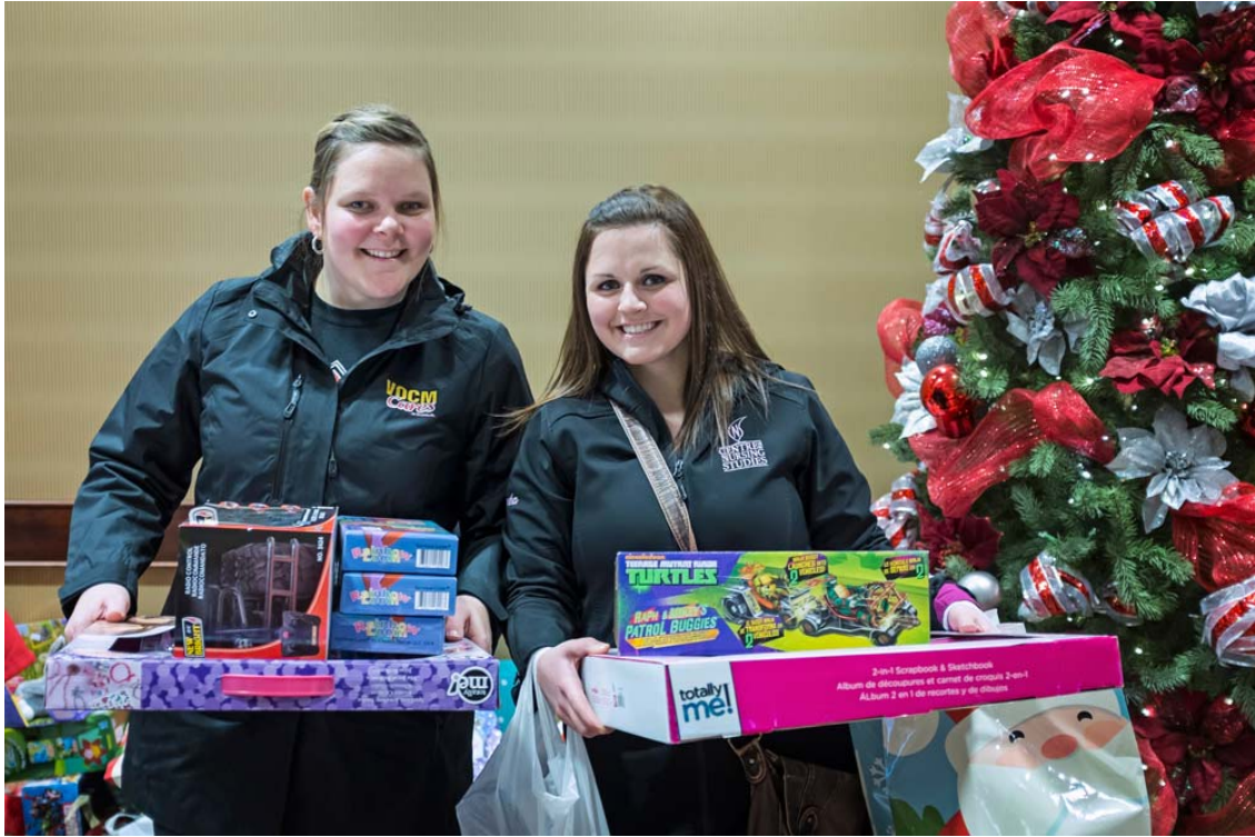
VBCM Happy Tree – December 2013