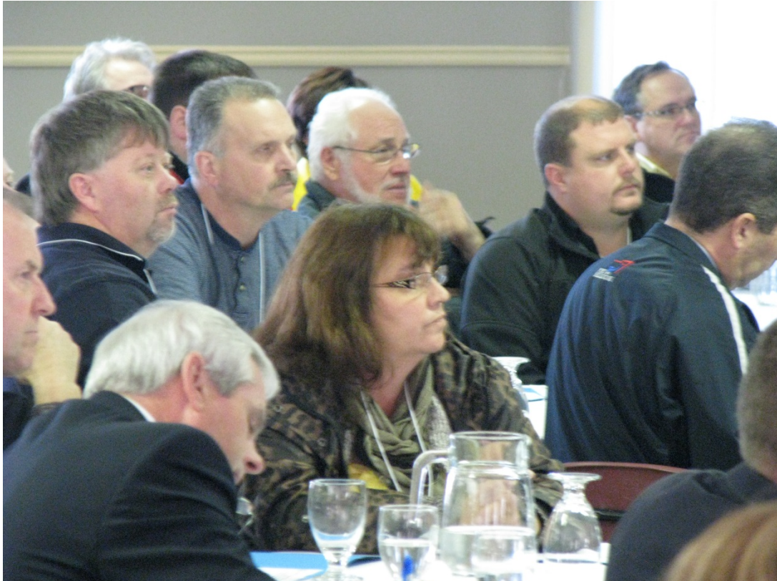
WREP Supplier Information Session – Placentia November 2013