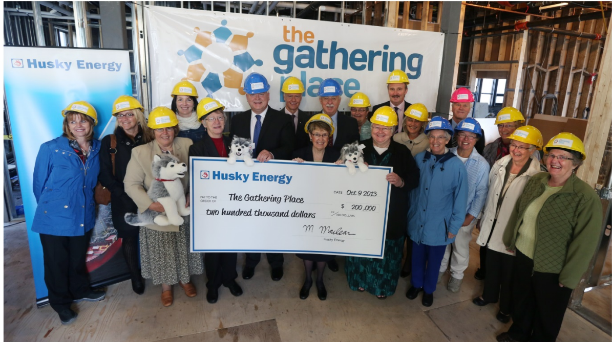
The Gathering Place – October 2013