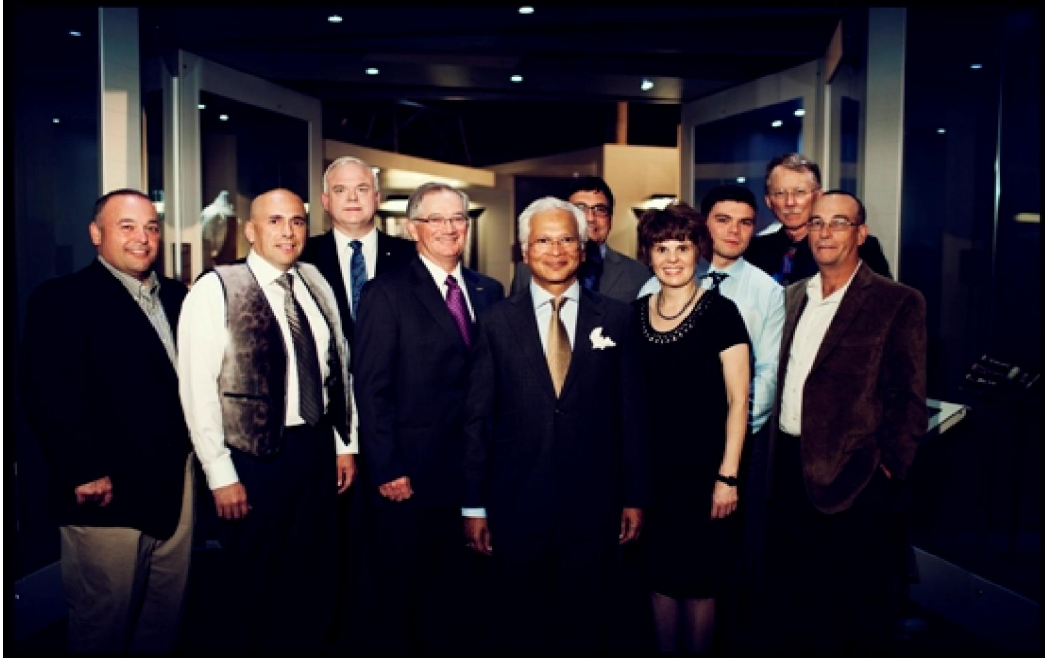
Official Opening of the Husky Energy Gallery at The Rooms – July 2013