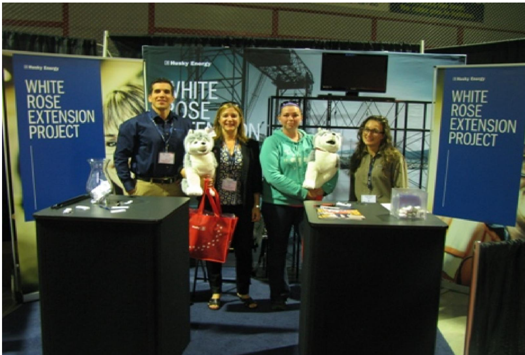
Placentia Bay Industrial Showcase – September 2013