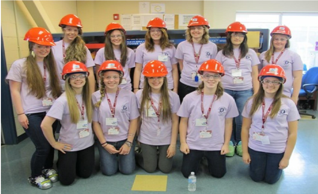
Husky's Day with the WISE students – September 2013