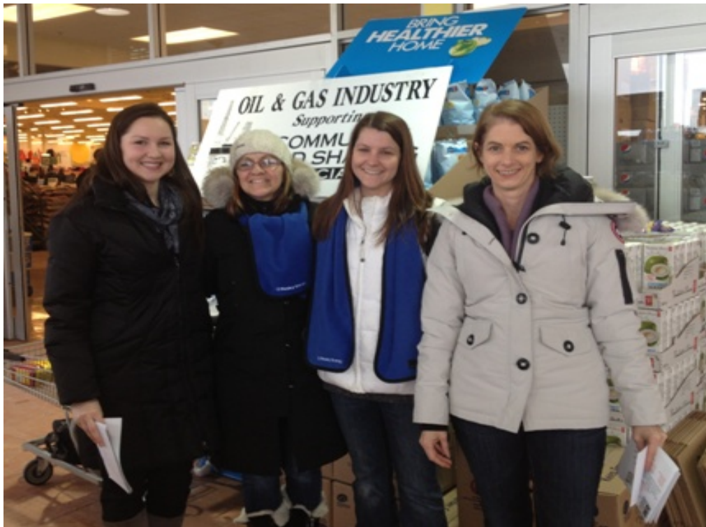
Oil and Gas Week Food Drive – February 2013