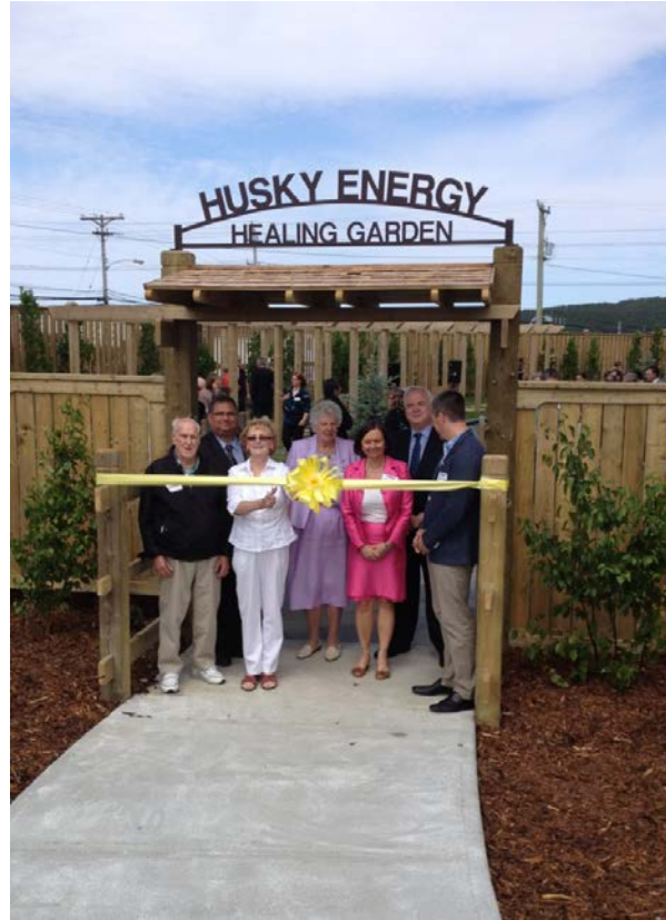
Opening of the Healing Garden at Daffodil Place – June 2013