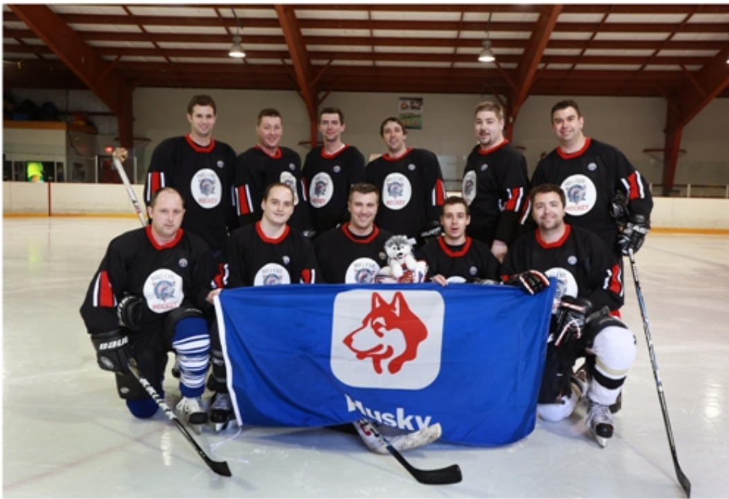
Wayne Duggan Memorial Hockey Tournament – April 2013