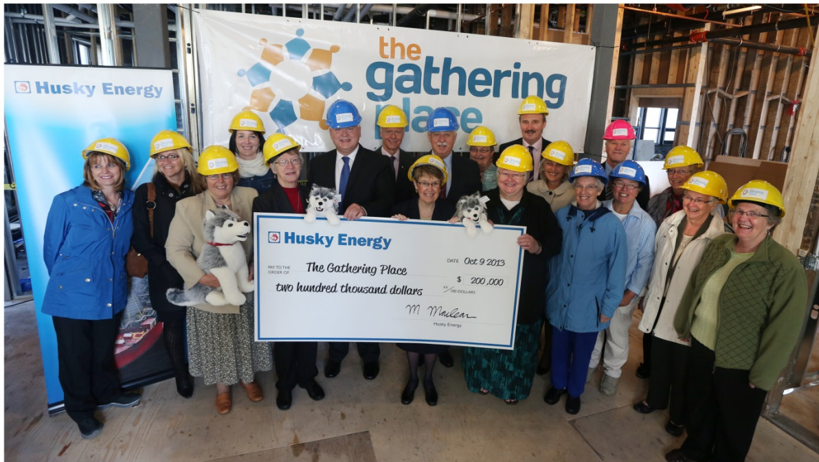
The Gathering Place – October 2013