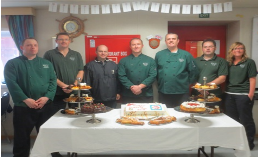
International Feast – Diversity Day on SeaRose – June 2013