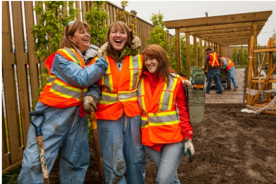
Husky Staff Helping Out in the Healing Garden – June 2013