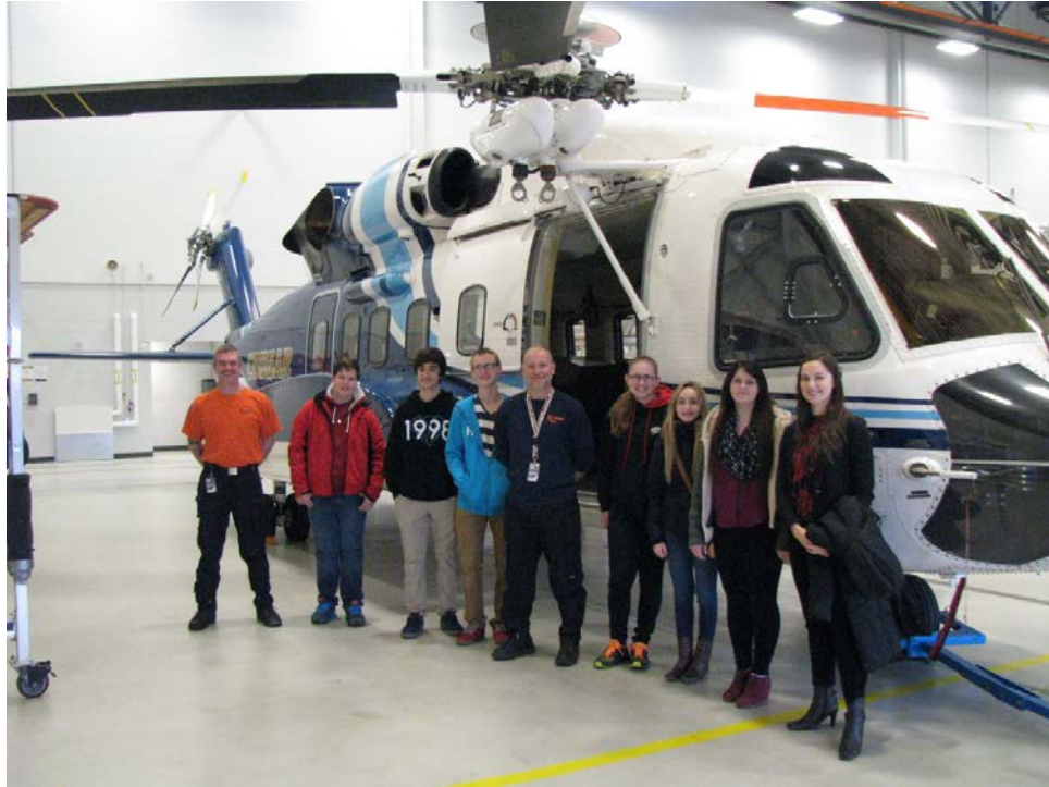
Take Our Kids To Work Day – November 2013