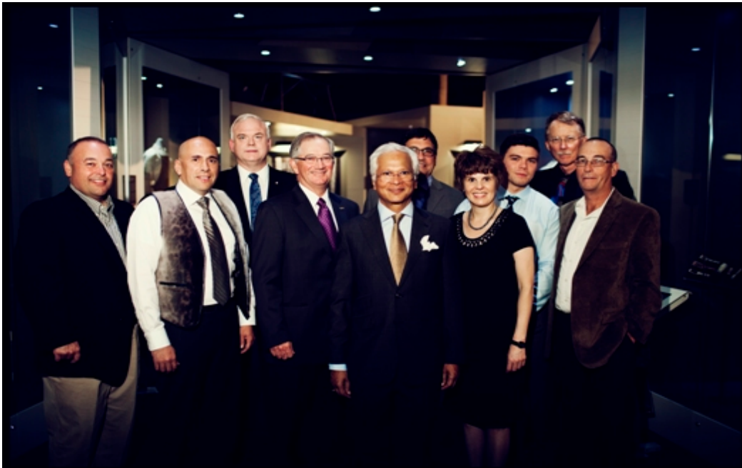
Official Opening of the Husky Energy Gallery at The Rooms – July 2013