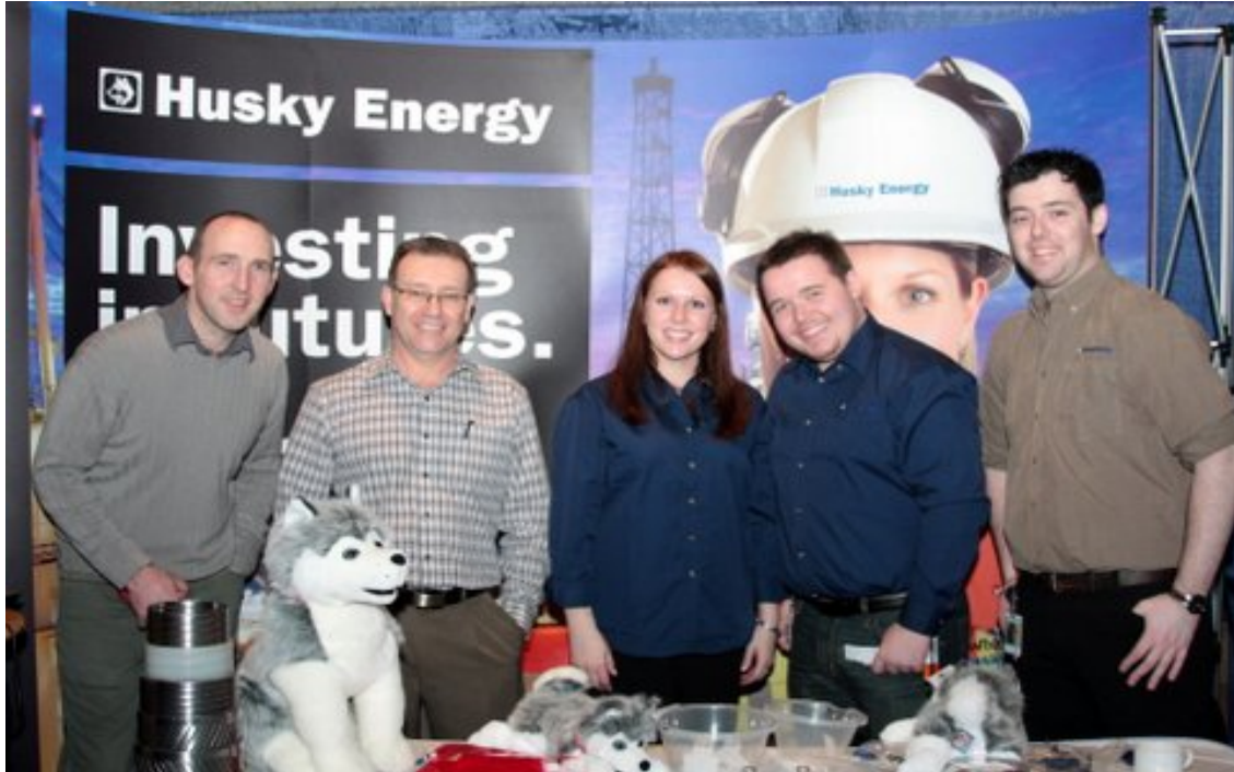
Energy Day at GeoCentre – February 2013