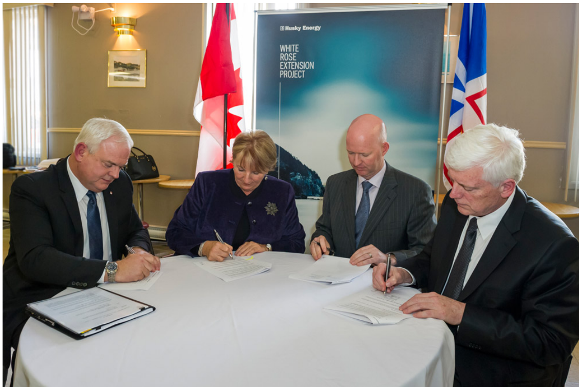
Signing of the WREP Framework Amending Agreement – October 2013