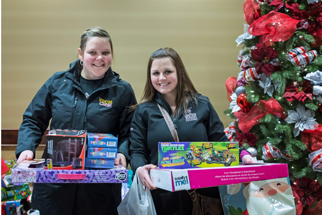
VOCM Happy Tree – December 2013