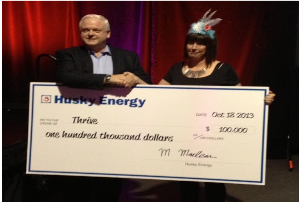
Thrive – October 2013