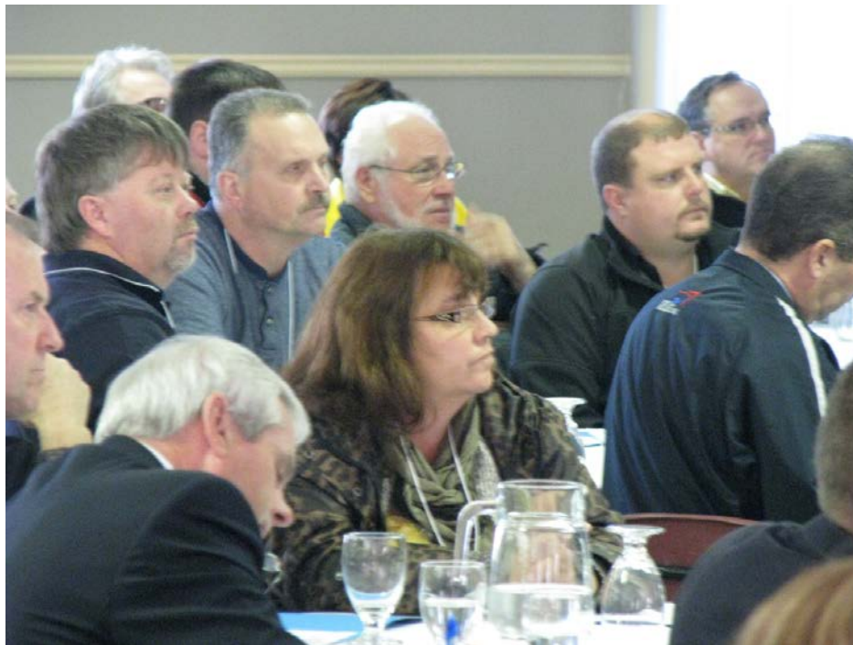
WREP Supplier Information Session – Placentia November 2013