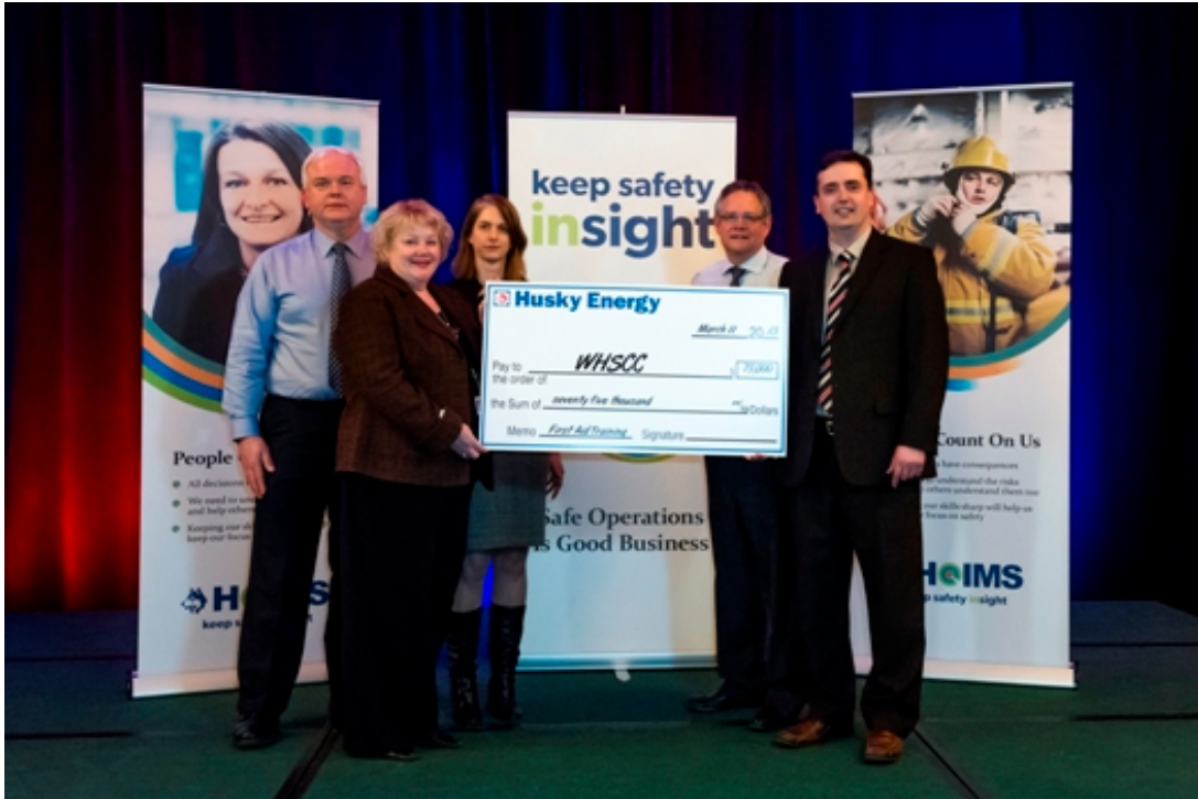
Donation to WHSCC to Add First Aid & CPR Training to Workplace Safety 3220 March 2013