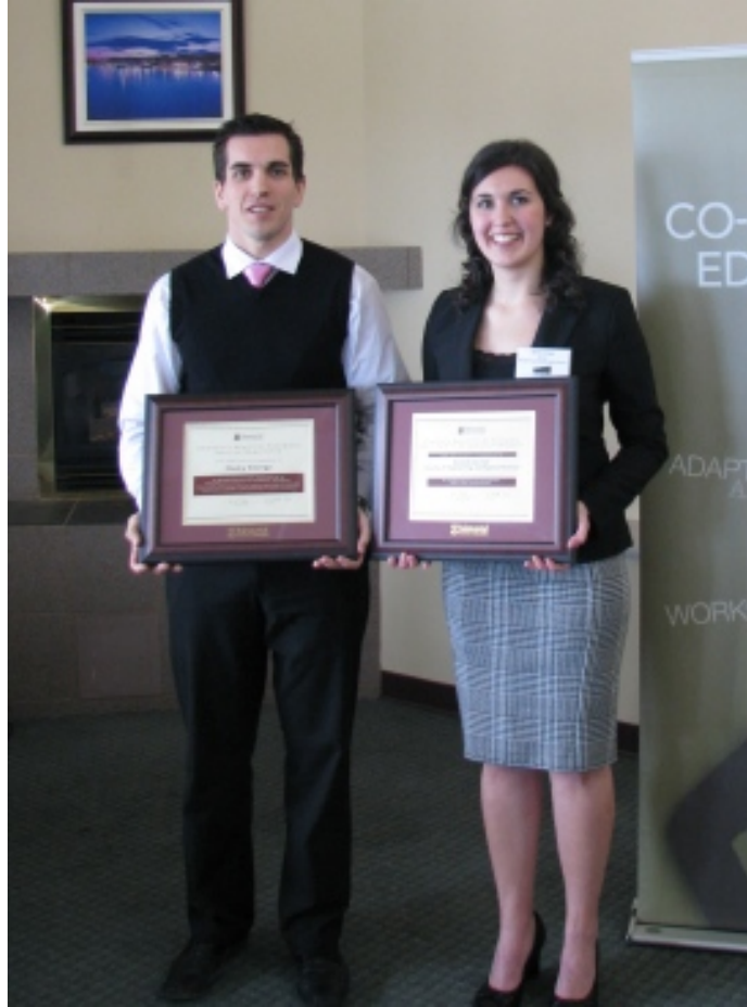
Husky Receives Exemplary Workterm Award from Memorial – April 2013