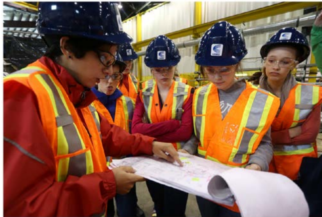
Techsploration Visit to Metal World – May 2013