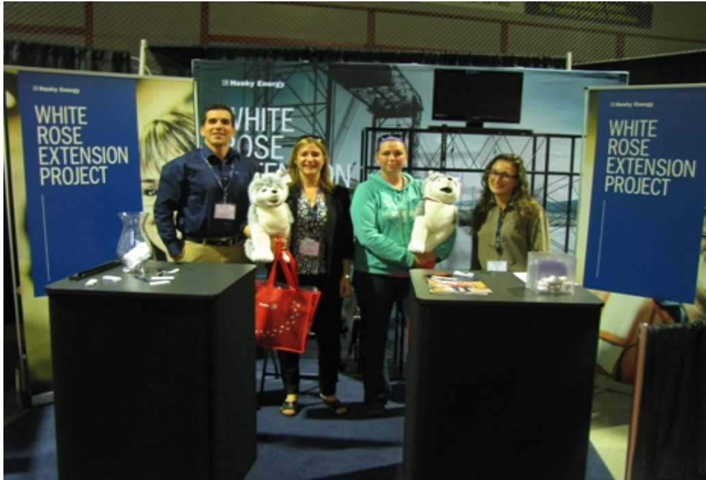
Placentia Bay Industrial Showcase – September 2013