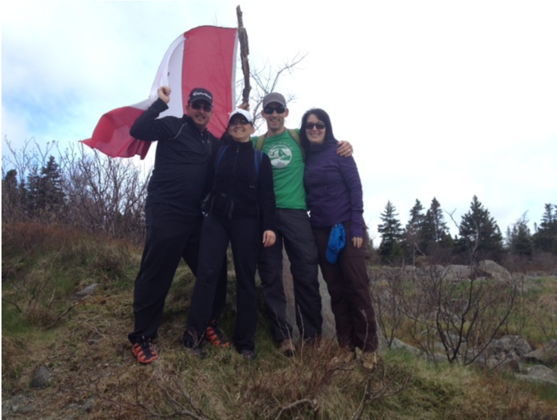
Husky Staff Participate in Tely East Coast Trail Hike – June 2013