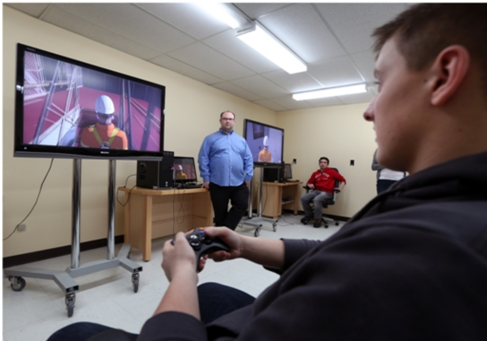
Energy Day Tour of Virtual Marine Technologies – February 2013