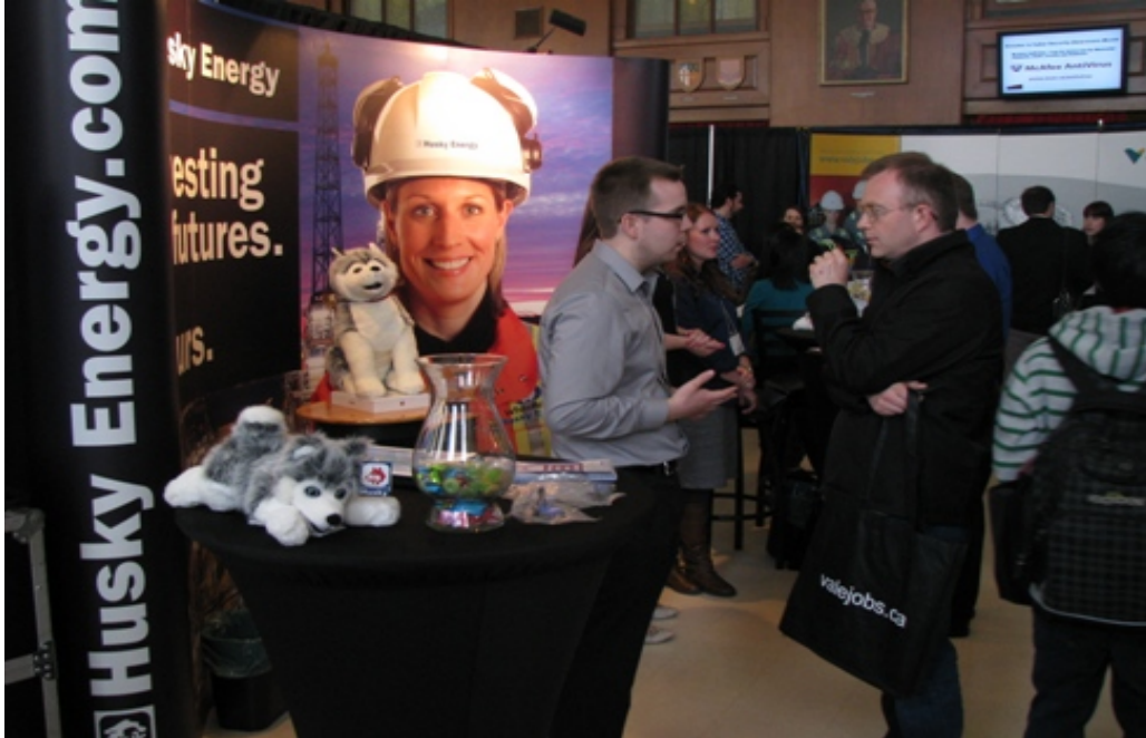
MUN Alumni Career Fair – May 2013