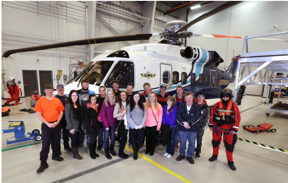
Energy Day Tour of Cougar Helicopters – February 2013