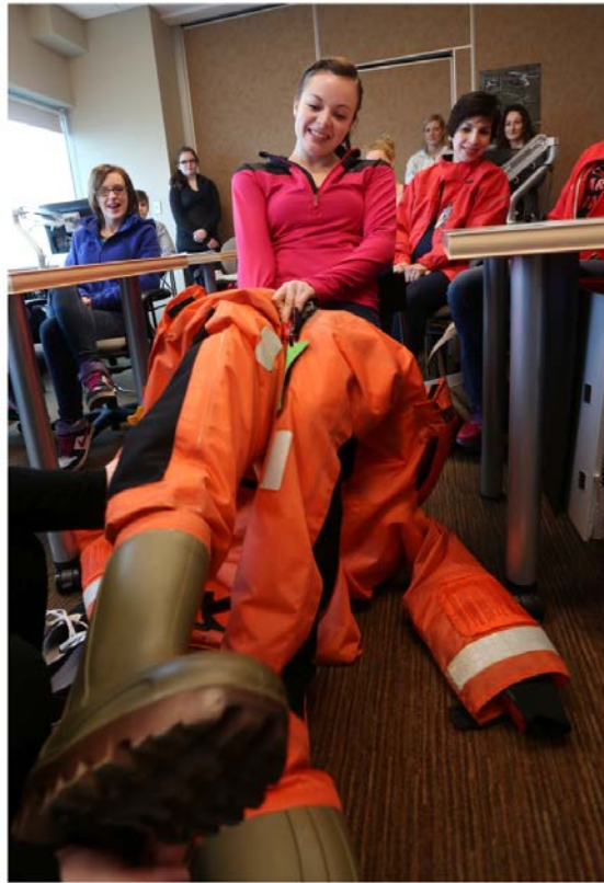
Techsploration Visit to Cougar – May 2013