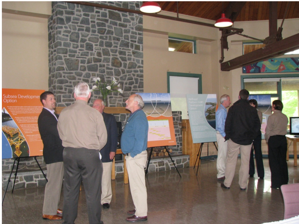
White Rose Extension Project Open House – St. John's – June 2012