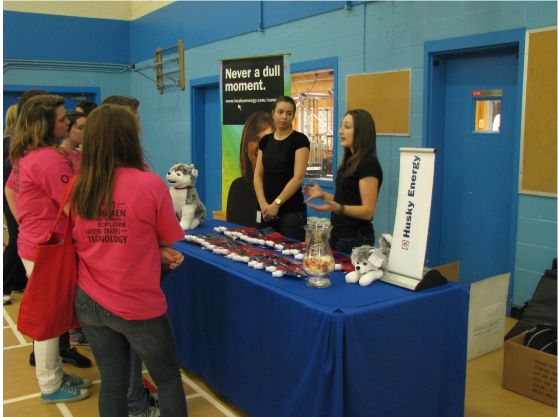
Techsploration – May 2012