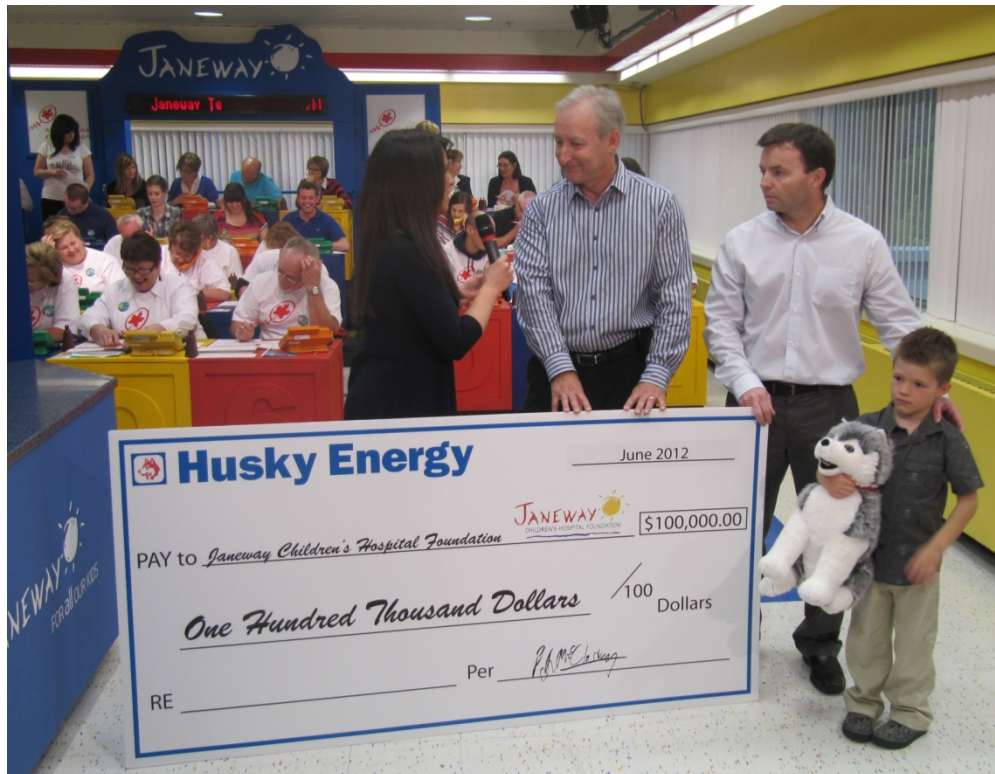
Janeway Telethon – June 2012