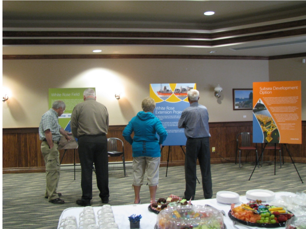
White Rose Extension Project Open House – Placentia – June 2012