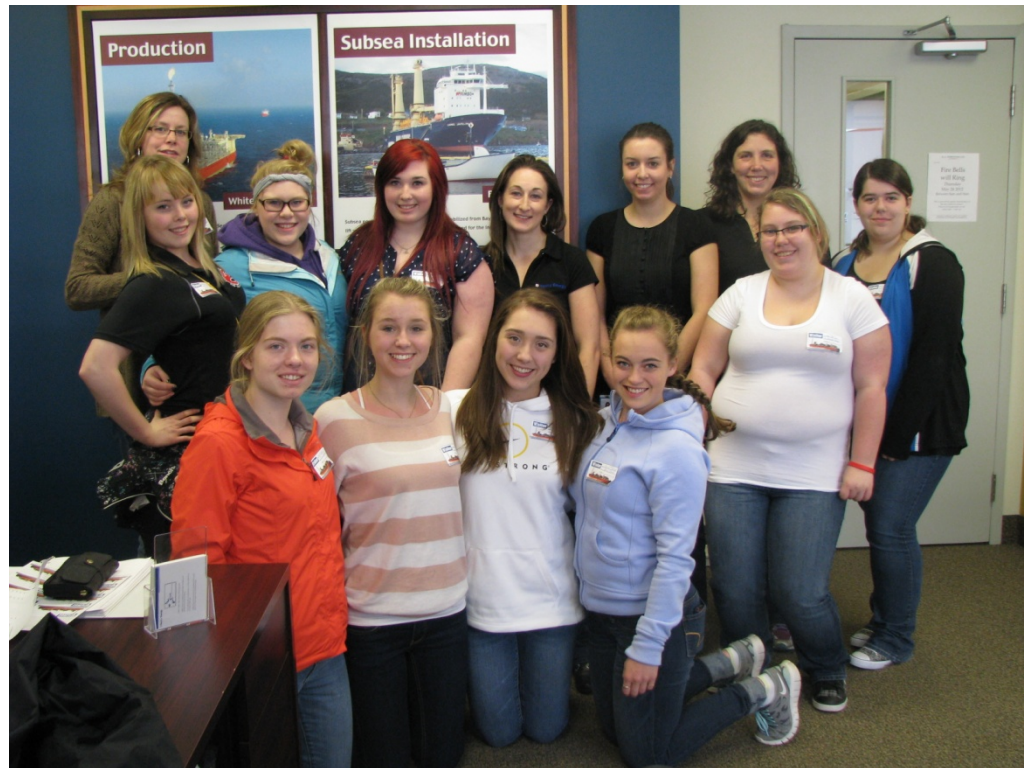
Techsploration – May 2012