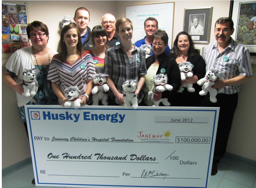
Husky Telephone Volunteers – Janeway Telethon – June, 2012