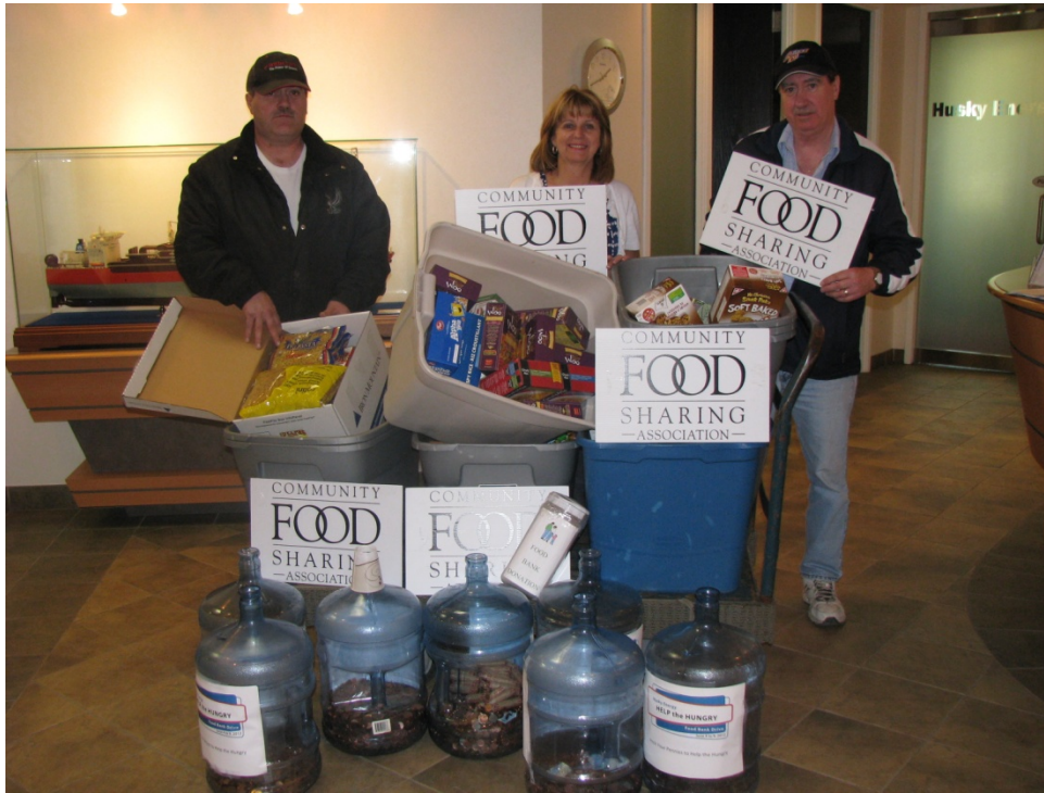
Help the Hungry Campaign – June 2012