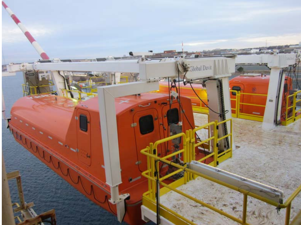
New Lifeboats Installed on GSF Grand Banks at Halifax Shipyard – February 2012