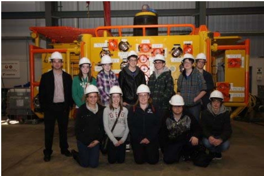
Energy Day Students Tour Cameron Facility – February 2012