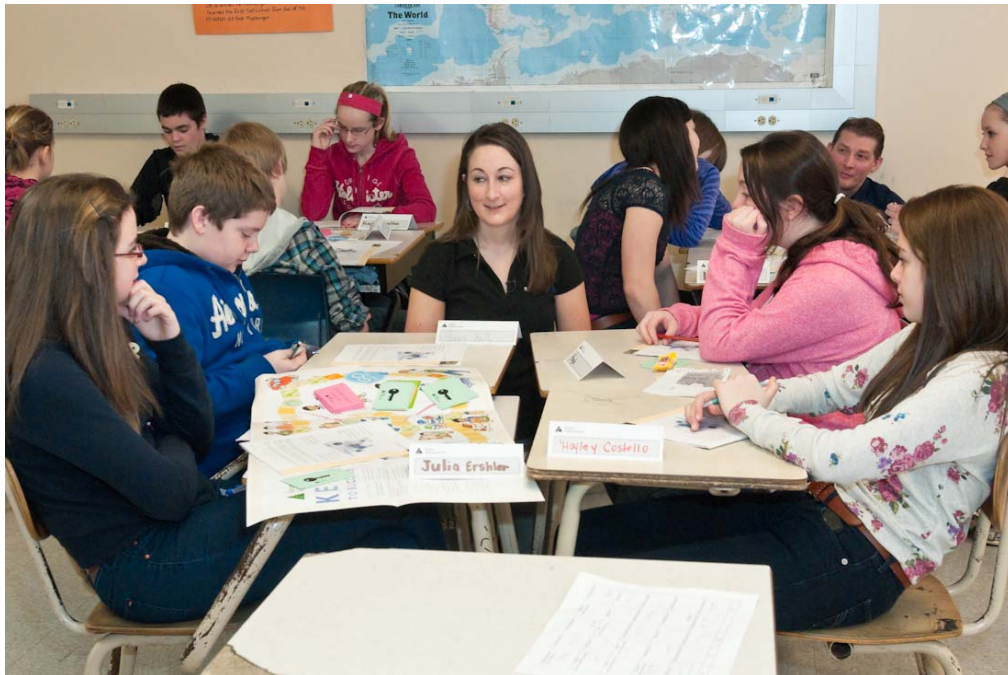
Husky Staff Participate in Junior Achievement Program – February 2012