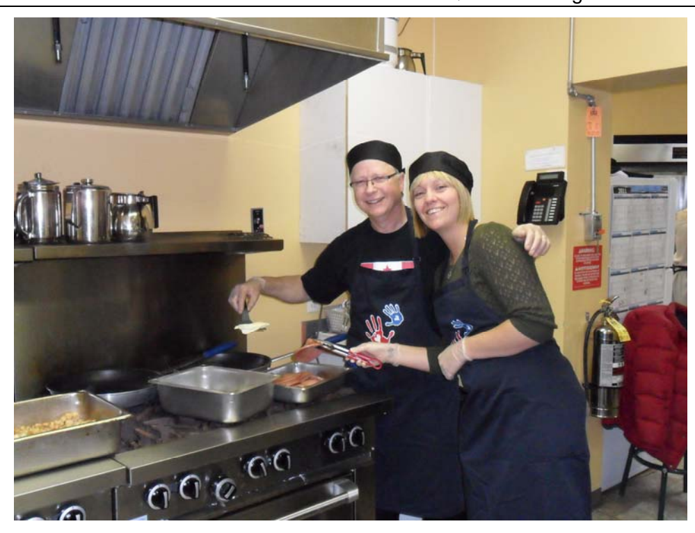
Husky Staff Volunteer at the Jimmy Pratt Centre - December 2011