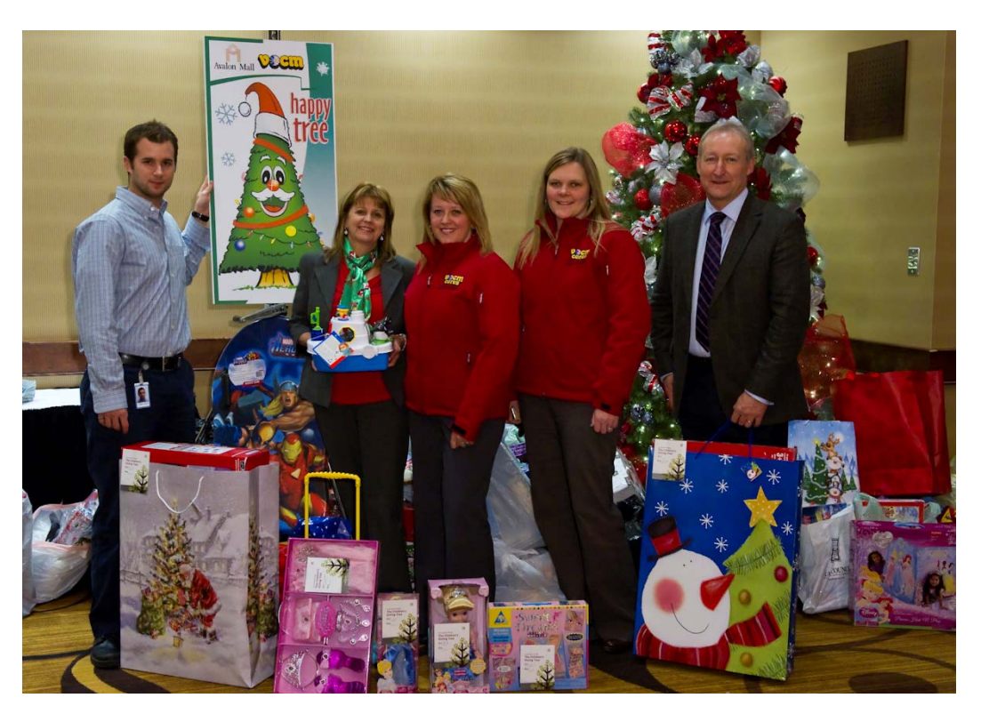
Happy Tree Donations- December 2011