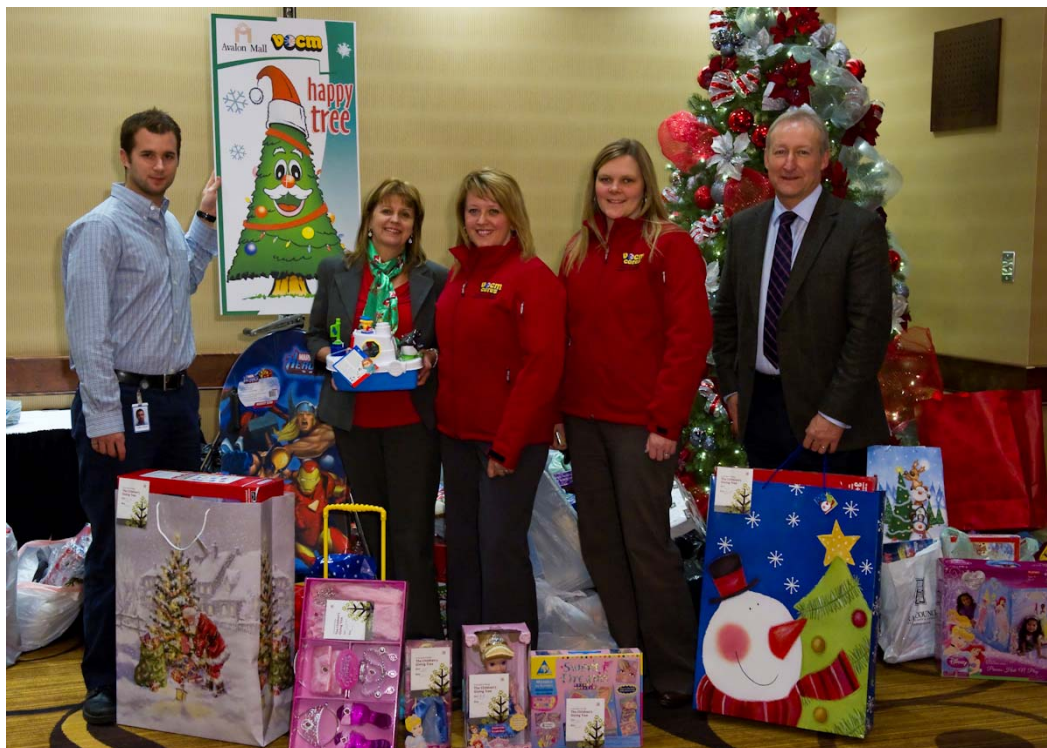
Happy Tree Donations– December 2011