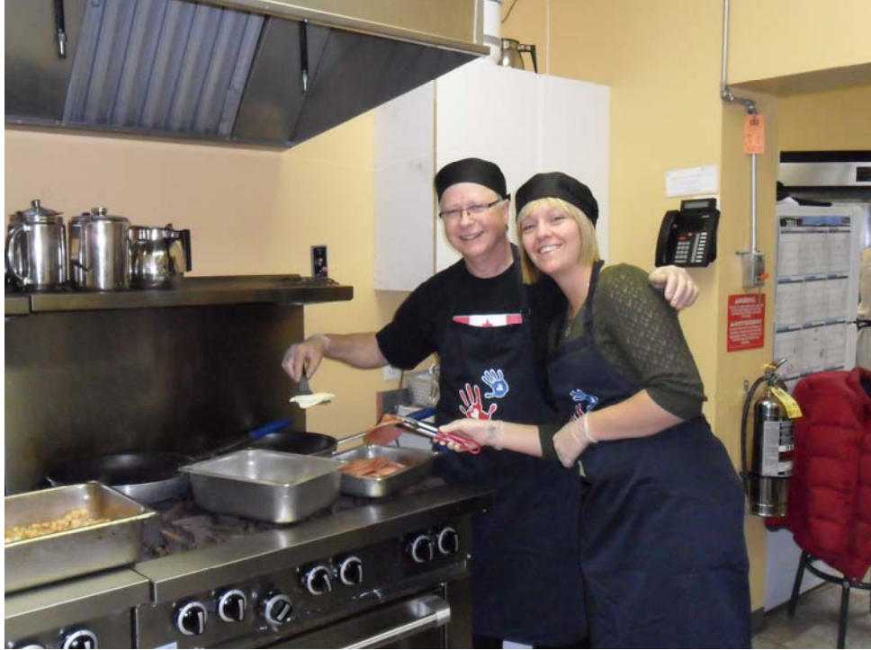
Husky Staff Volunteer at the Jimmy Pratt Centre – December 2011