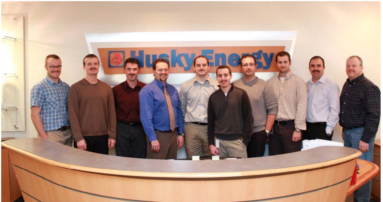
Husky Energy's staff participates in Movember challenge – November 2011