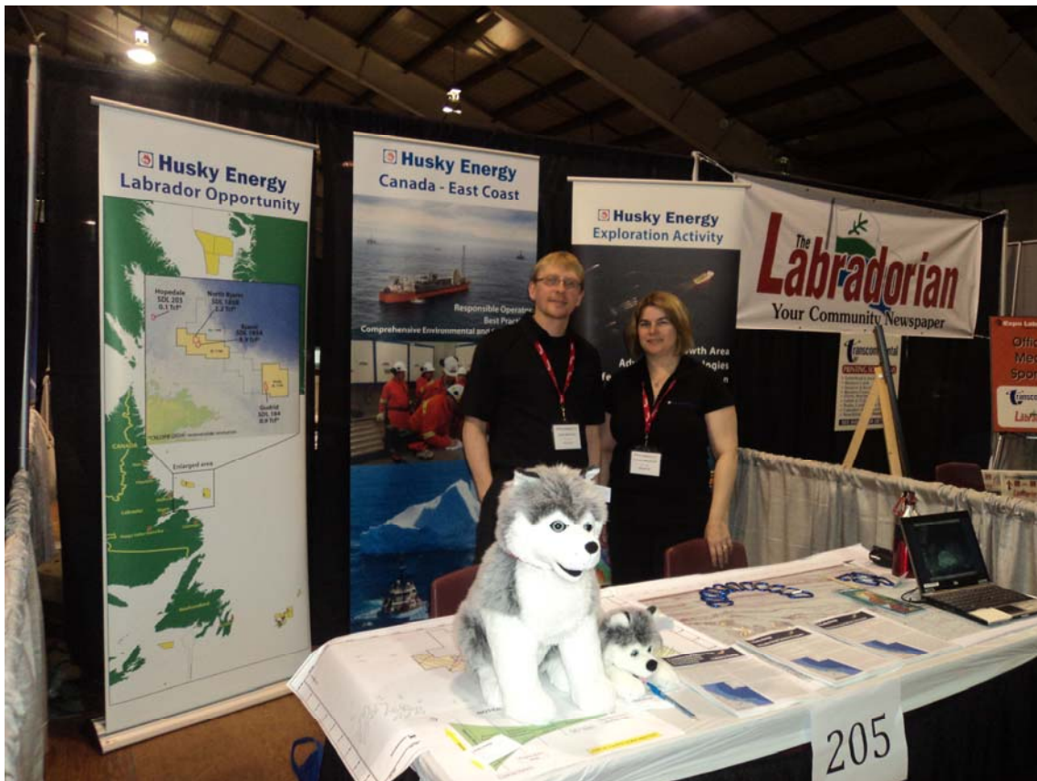
Husky Booth at Expo Labrador June 2011