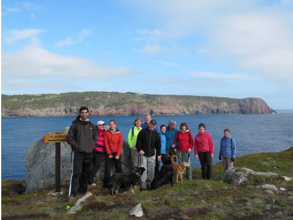
East Coast Trail Tely Challenge June 2011