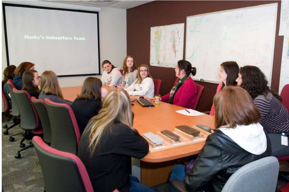
Techsploration May 2011