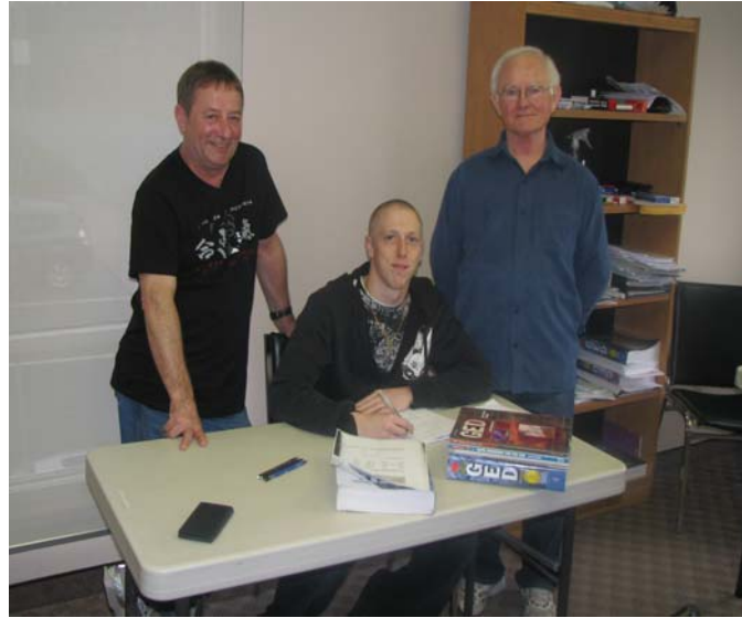
Husky Supports Community Youth Network's Youth-at Promise Program May 2011