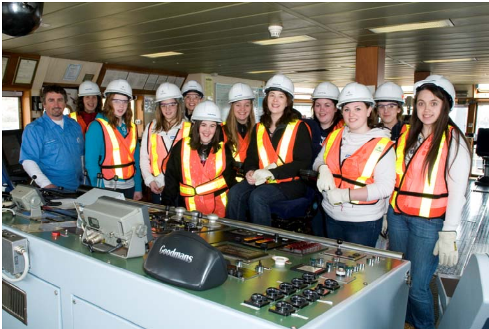
Techsploration May 2011