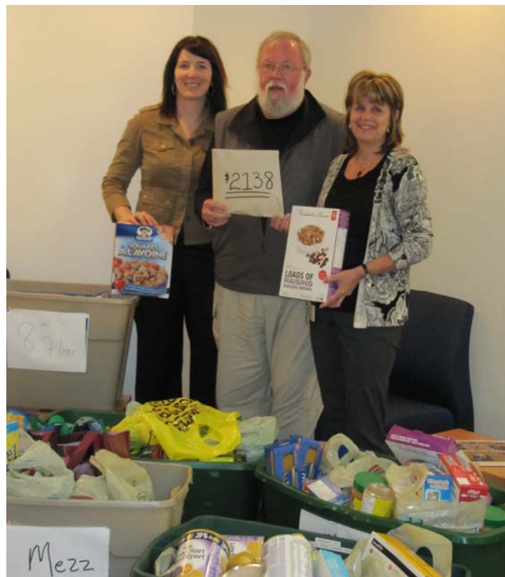
Help the Hungry Campaign June 2011