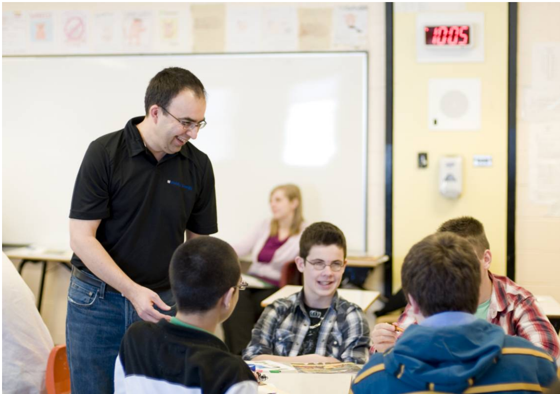
Junior Achievement Program at St. Kevin's, Goulds February 2011