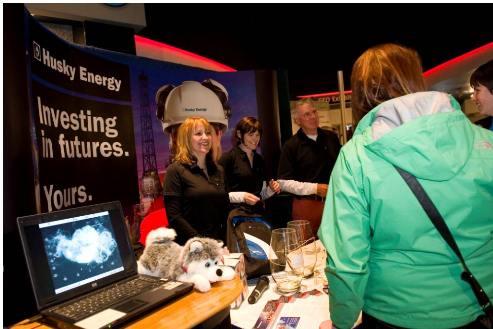
Energy Day at the Johnson Geo Centre March 2011