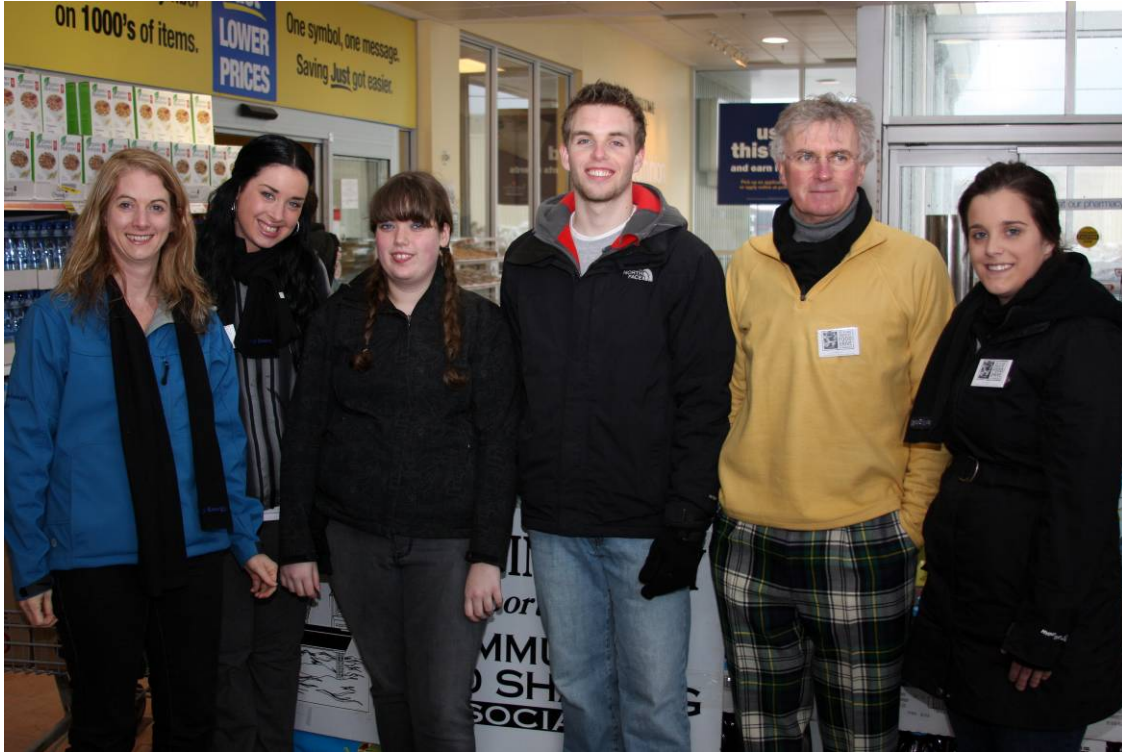
Oil & Gas Week Food Drive February 2011