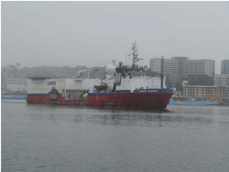
The Harrier Explorer completed a 2D seismic survey in the Sydney Basin