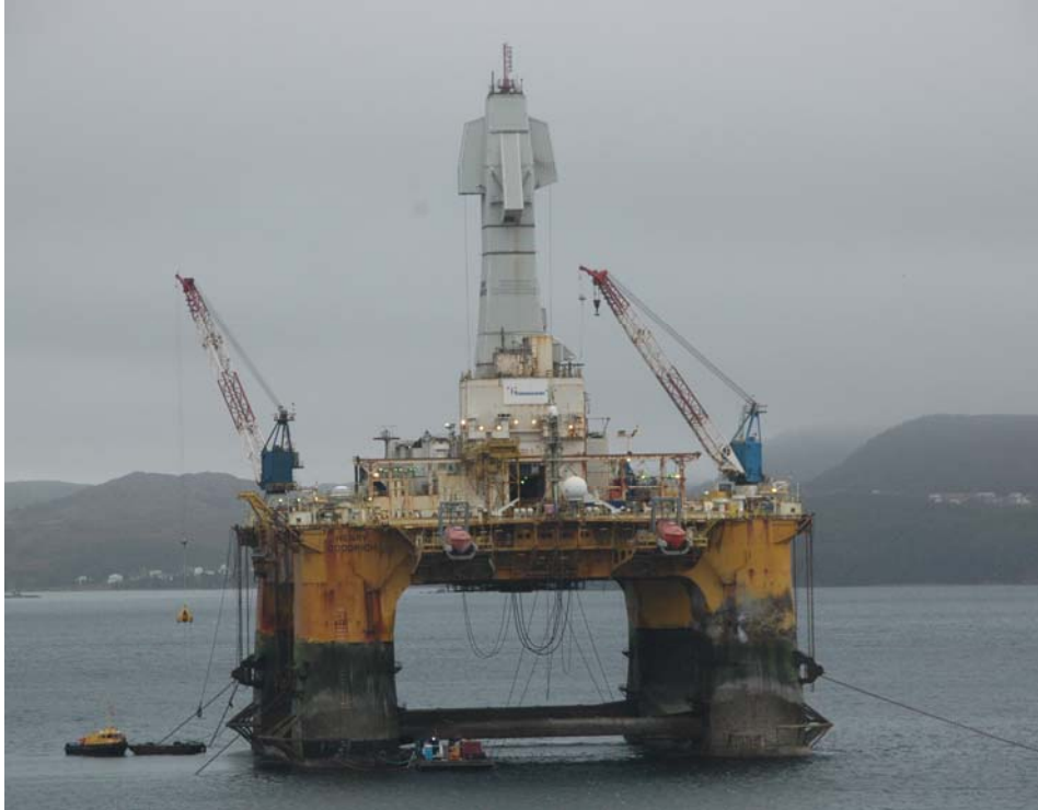
The Henry Goodrich underwent Phase 1 of its Special Periodic Survey in Marystown