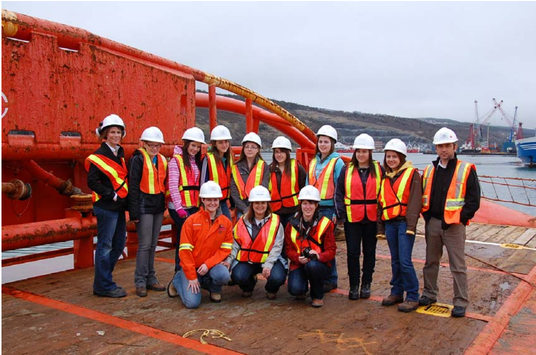
Atlantic Hawk - Techsploration May 2010