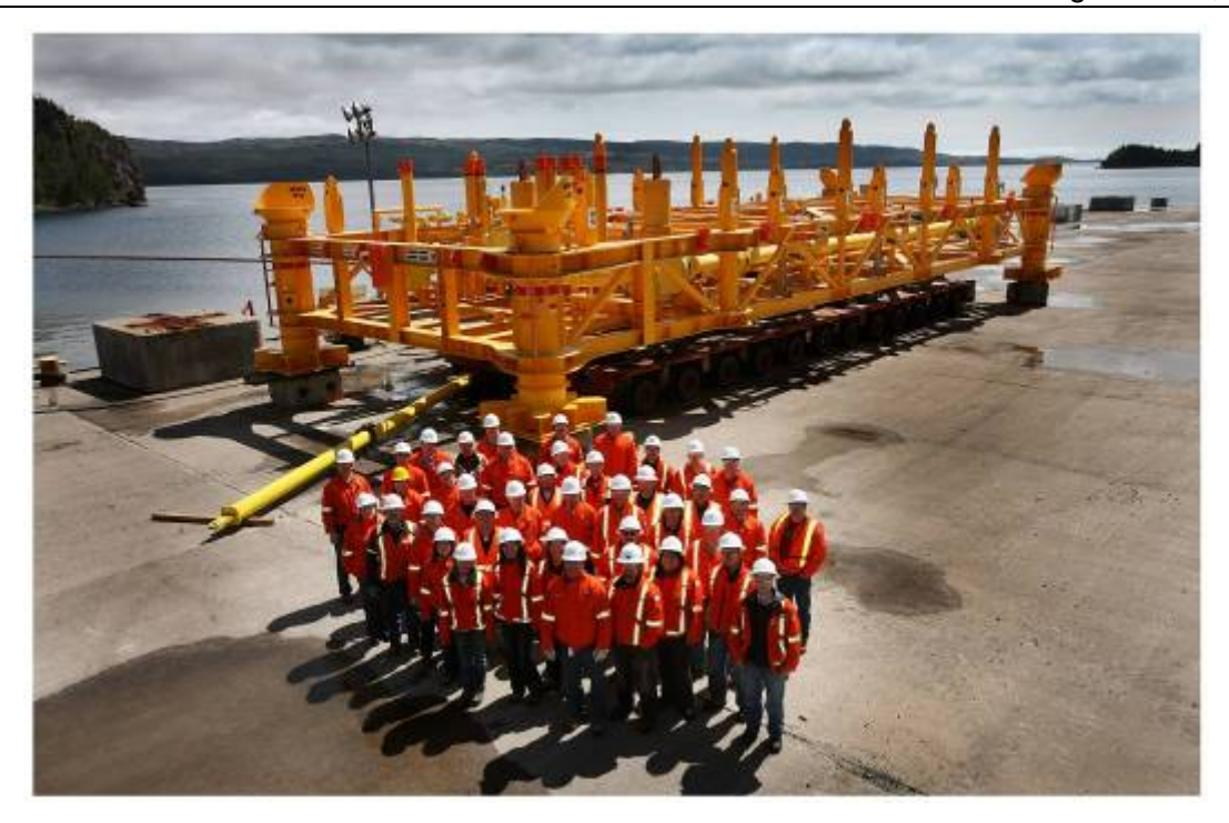
Site Team at Bull Arm