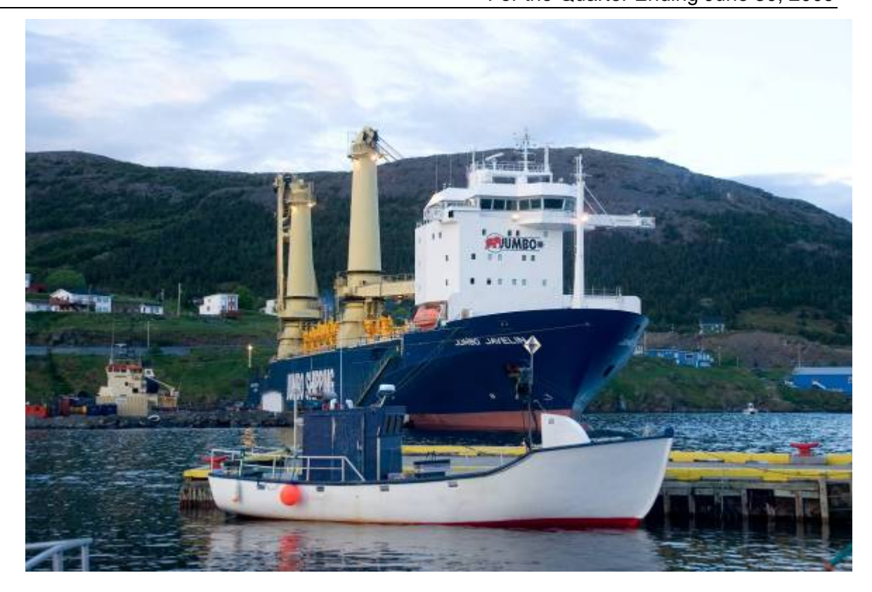
Jumbo Javelin Heavy Lift Vessel in Bay Bulls