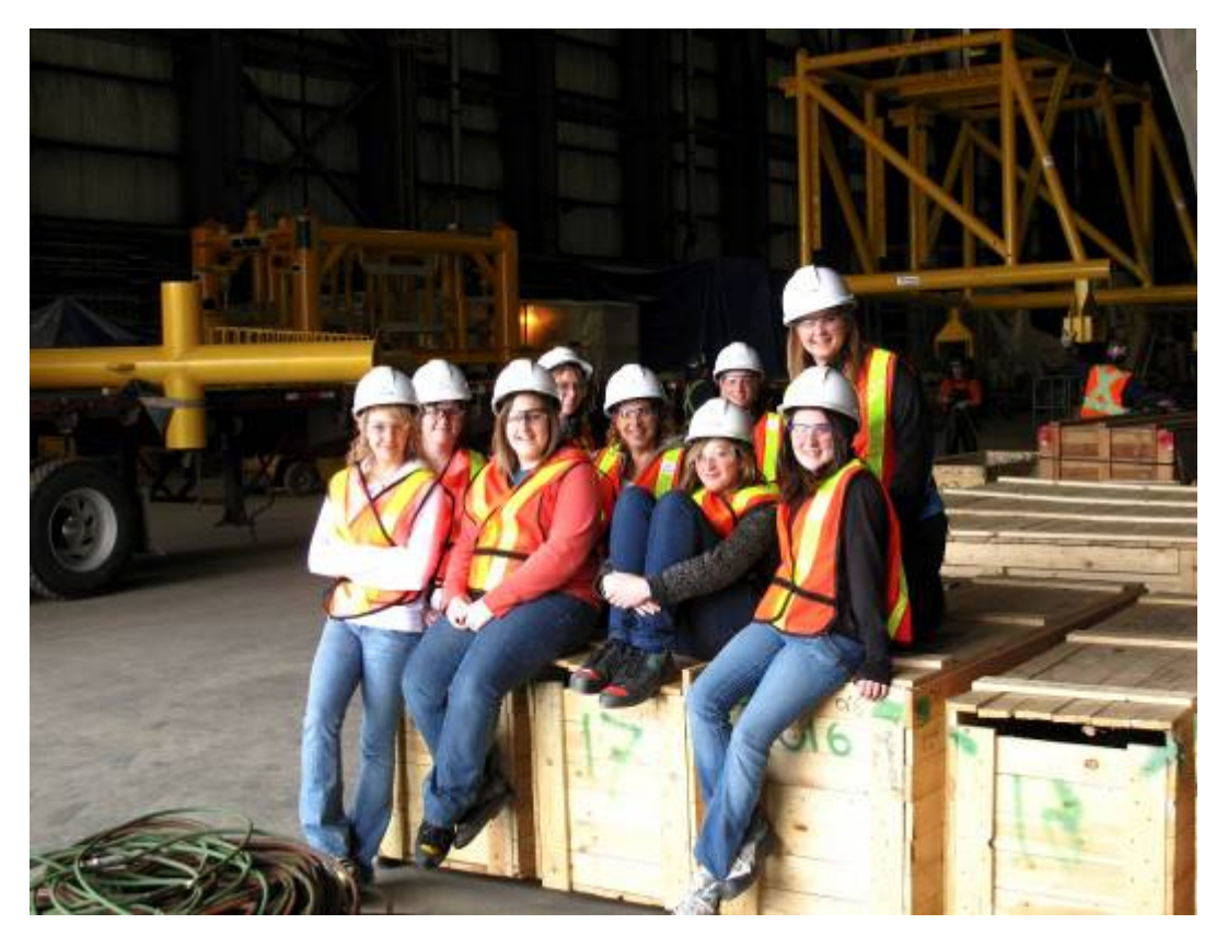
Grade Nine Girls from Arnold's Cove Tour the Bull Arm site as part of Techsploration