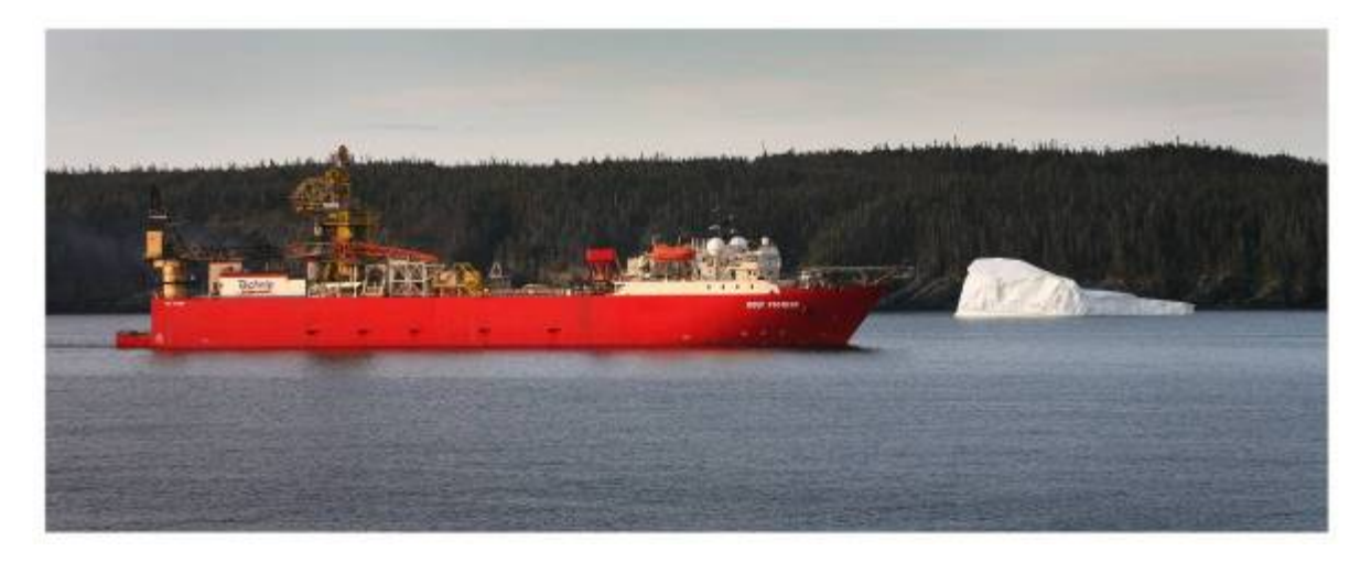
Deep Pioneer Departing Bay Bulls for White Rose Field