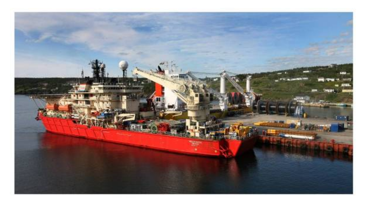
Well Service diving support vessel in Bay Bulls