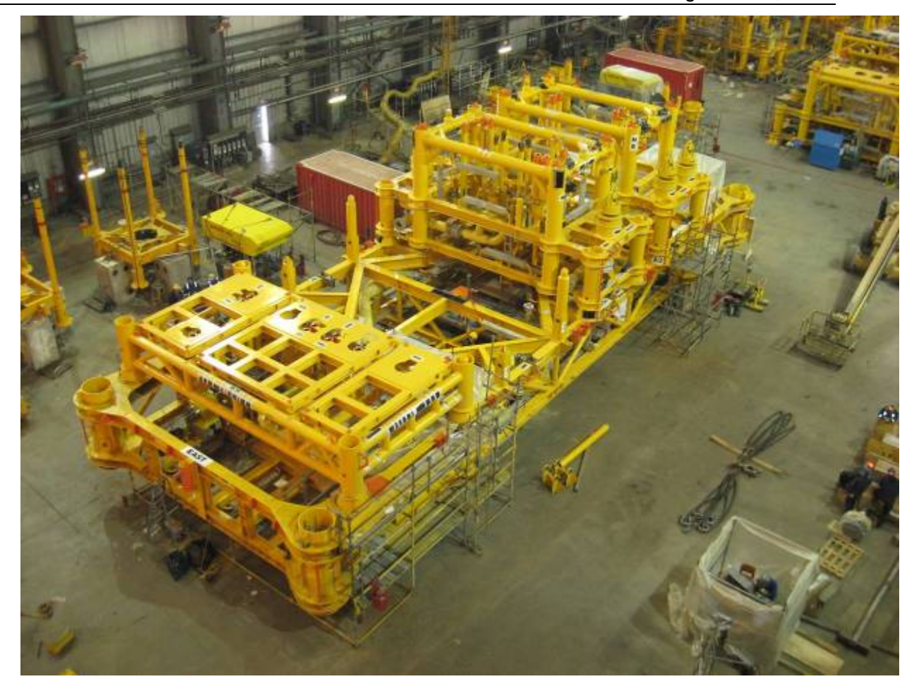
Main Support Frame 2 with modules and roof in at Bull Arm