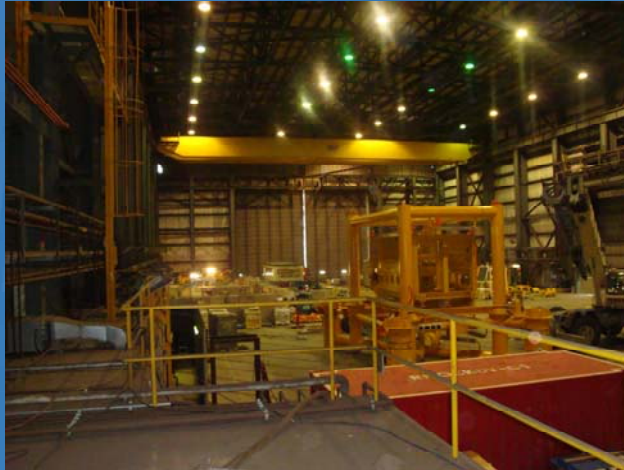
SIT Work Area – March 27, 2009