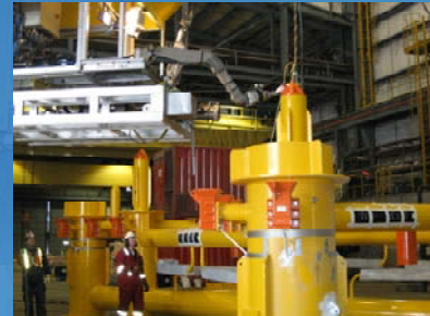
Mock ROV with SDU Base