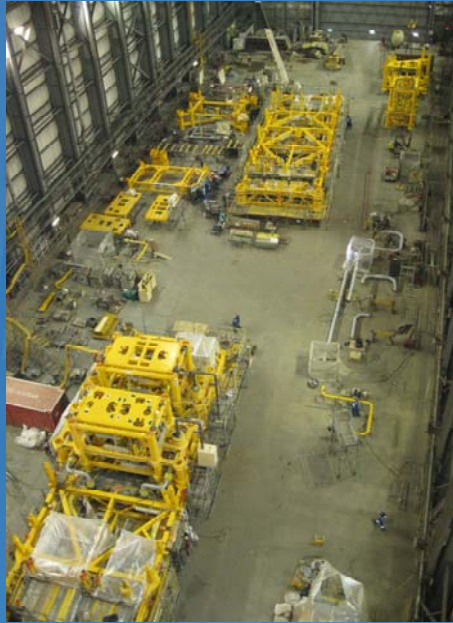
Module Hall – Apr 03, 2009