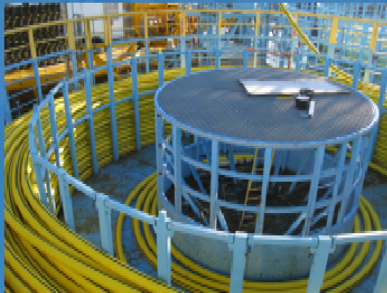
Umbilical on Carousel