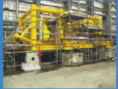
Production Flowline Termination Module