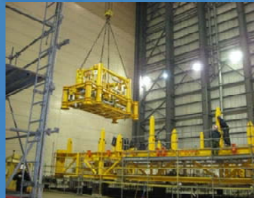
Trial Fit Water Injection Module #1