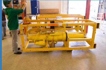
MPFM – Multi Phase Flowmeter