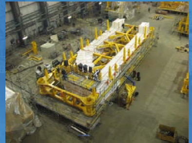
MSF #1 being Insulated