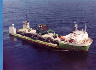
Rock Dumping Vessel – Tideway Rollingstone