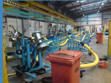
HFL Test area Duco