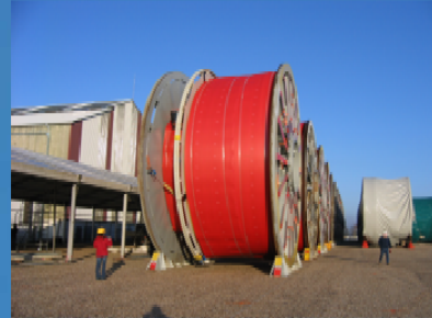
North Amethyst Packaged Flowline