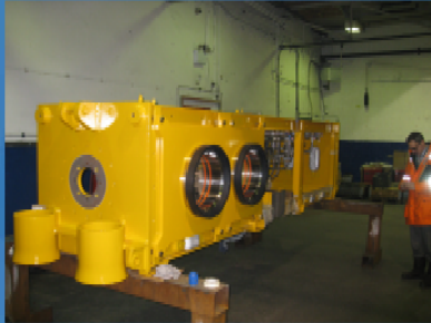
Umbilical Termination Assembly (UTA)