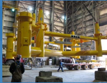
SDU #1 Foundation