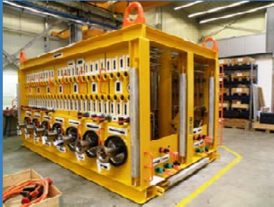
Subsea Distribution Unit #1 during FAT