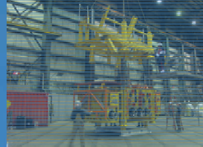
Jumper Deployment Frame Test