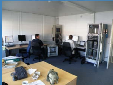
ICSS/MCS Test Area