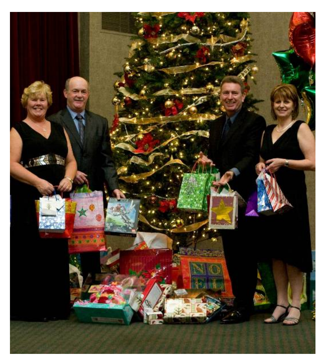
Husky Employees Contribute to the VOCM Happy Tree – Christmas 2008