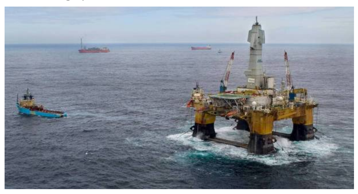
Henry Goodrich Under Tow in the White Rose Field