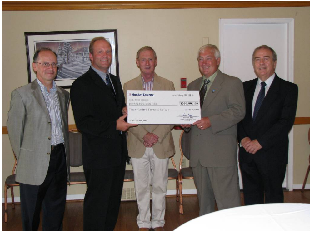
Husky Contributes $300,000 to the Bowring Park Foundation in August 2008