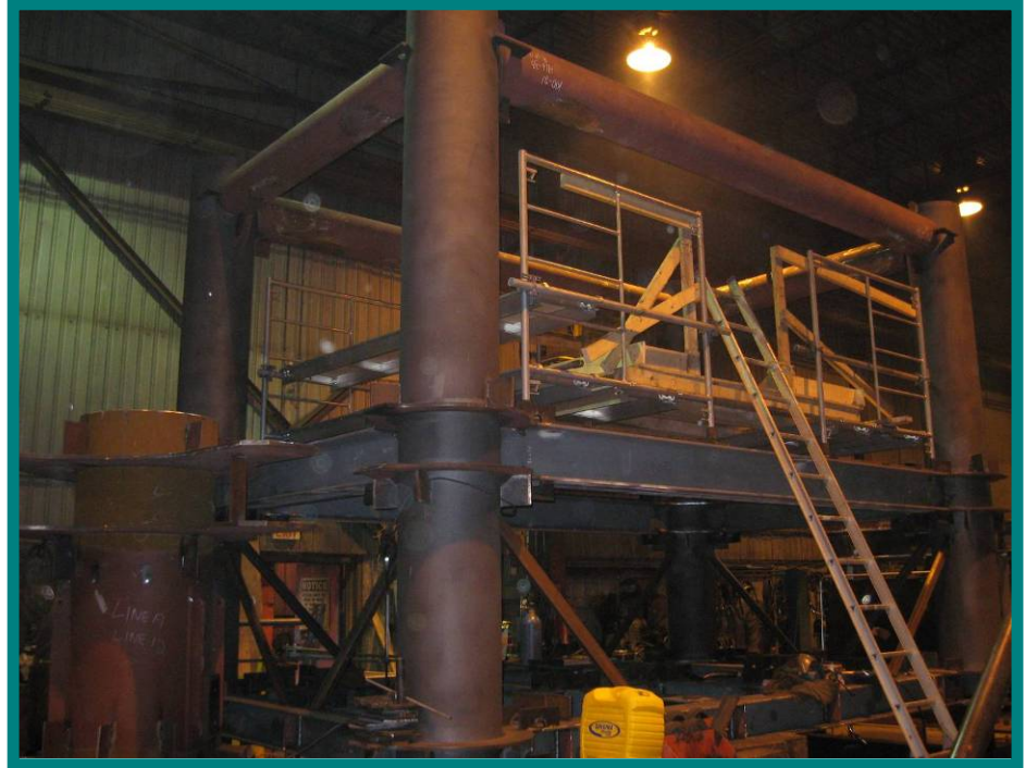
Production Manifold at Metal World