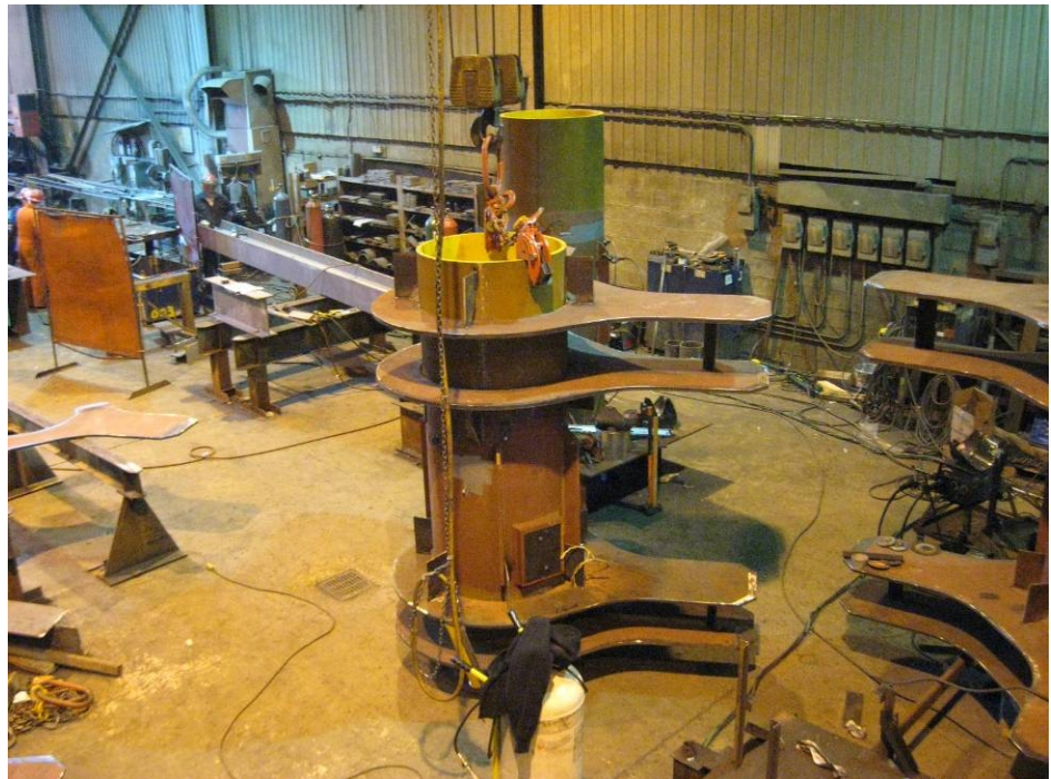
Pile Sleeve for MSF No. 2 at Metal World