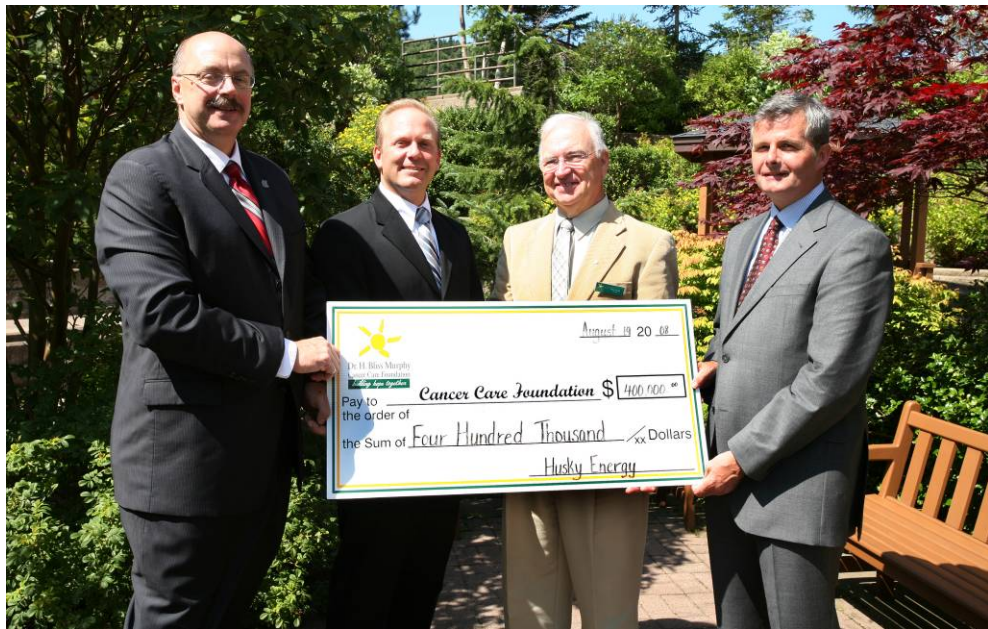
Husky Contributes $400,000 to the H. Bliss Murphy Cancer Clinic in August 2008