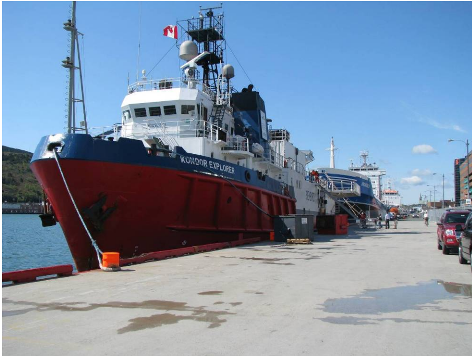
CGG Veritas Seismic Source Vessel Kondor in Port at St. John's, June 4, 2008