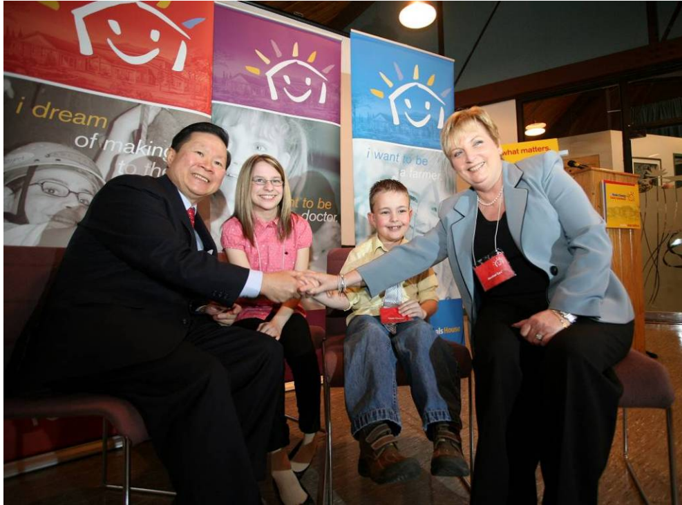
Husky Donates 750,000 towards the construction of Easter Seals House