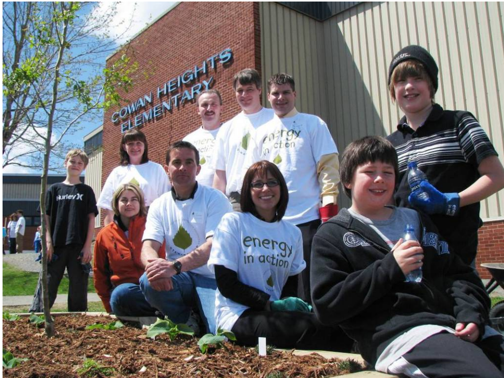
Husky Employees Participate in Energy in Action Day