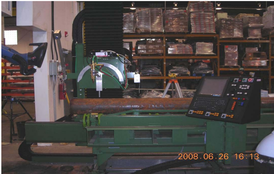
New Pipe Cutting Equipment at CPSI / NECL