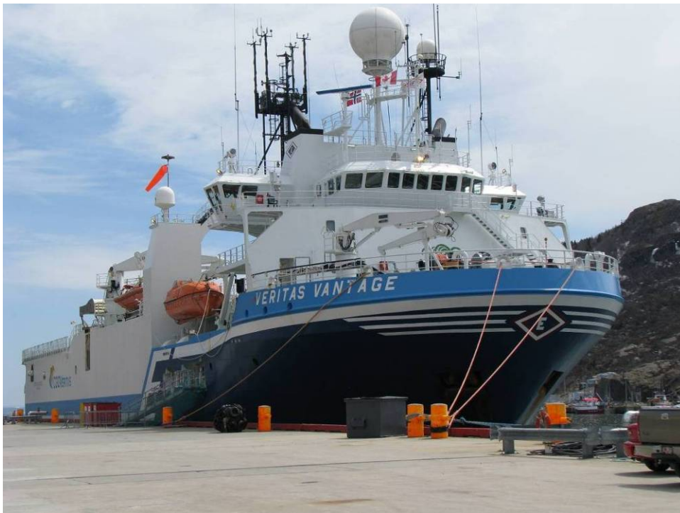
CGG Veritas Seismic Vessel Vantage in St. John's, May, 2008