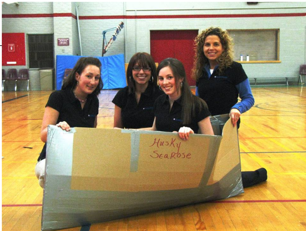
Husky employees participate in Techsploration Presentations at CONA