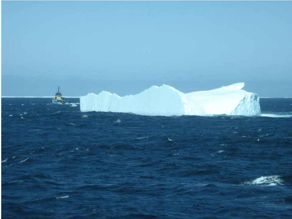
Iceberg under tow at White Rose Field – April 2008