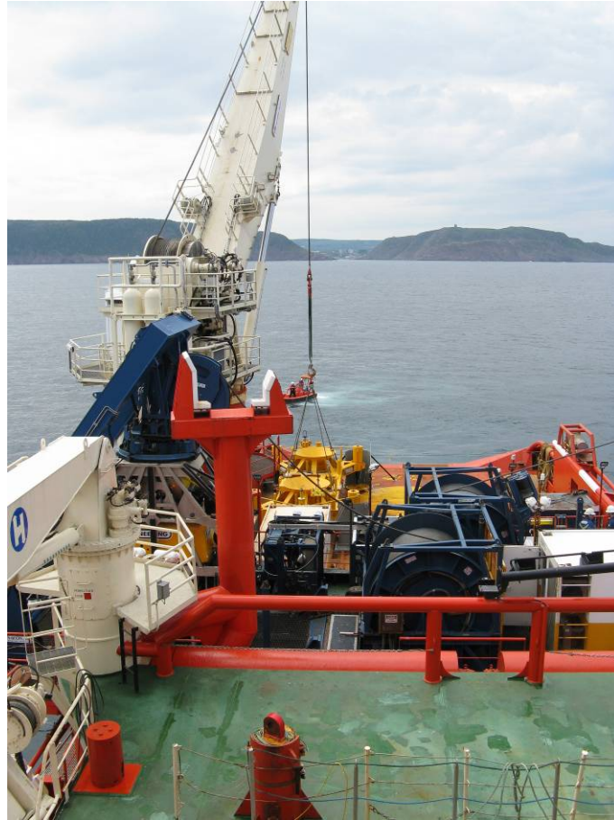
Wet Test of a TGB