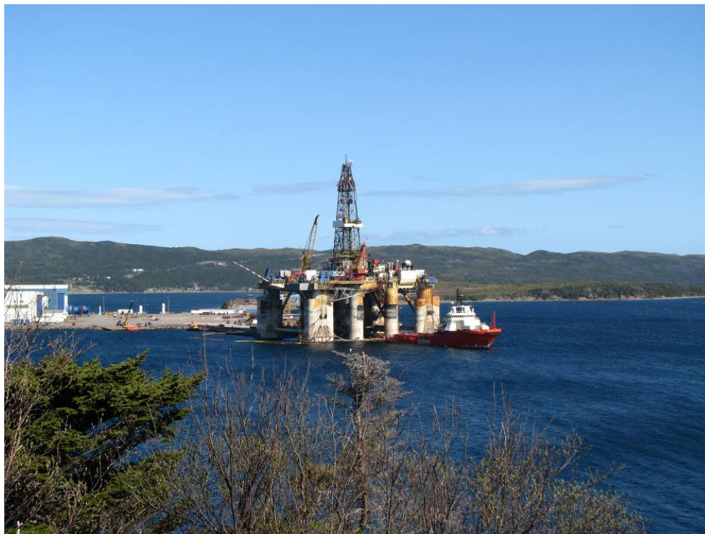
Glomar Grand Banks in Marystown – April 2008