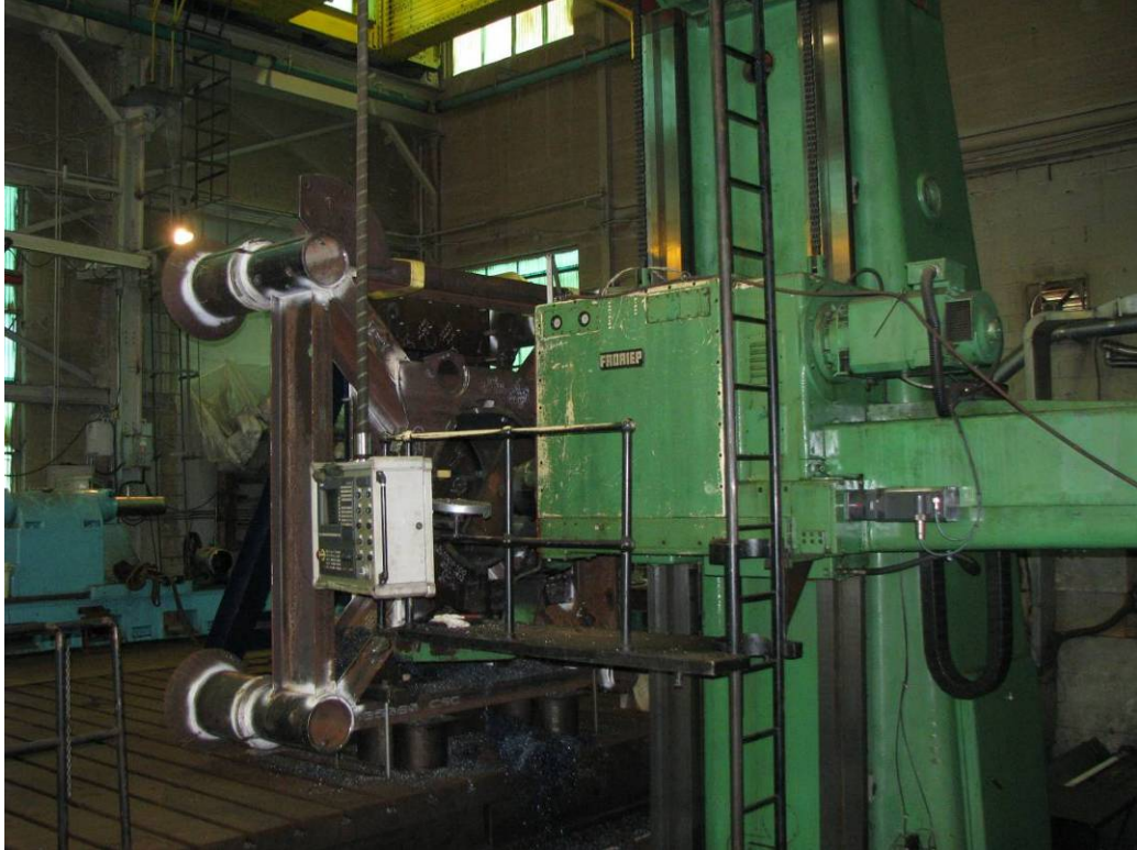
Machining of one of the Permanent Guide Bases for North Amethyst at NewDock