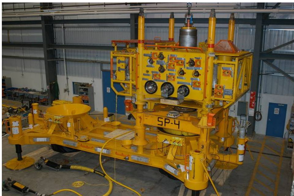
TGB with PGB and Subsea Tree at Cameron – St. John's