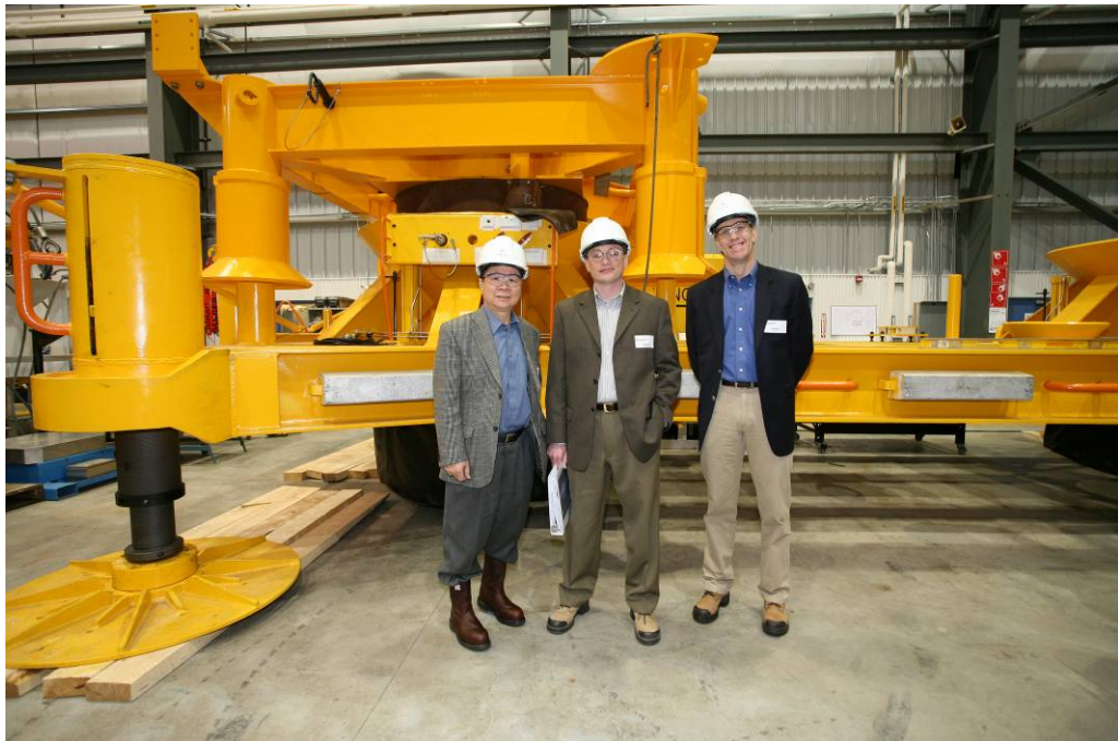
Temporary Guide Base (TGB) in Cameron Test Facility in Donavans