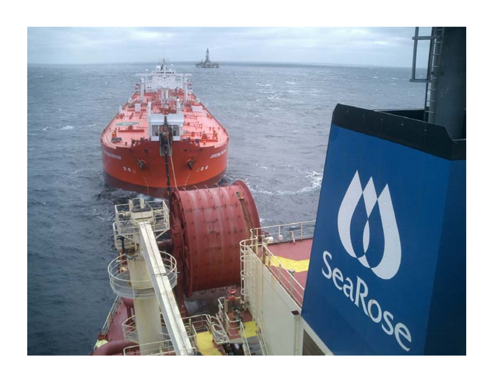
100<sup>th</sup> Offload From the SeaRose to the Catherine Knutsen March 31, 2008