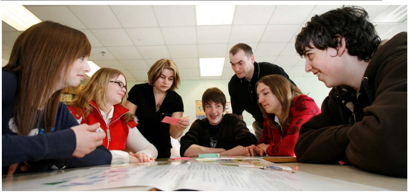
Husky Employees Participate in Junior Achievement - Economics of Staying in School Program at St. Kevin's Junior High School on March 12, 2008