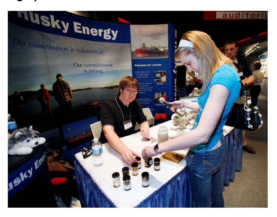
Husky Exhibits at Energy Day During Oil & Gas Week Feb 22, 2008