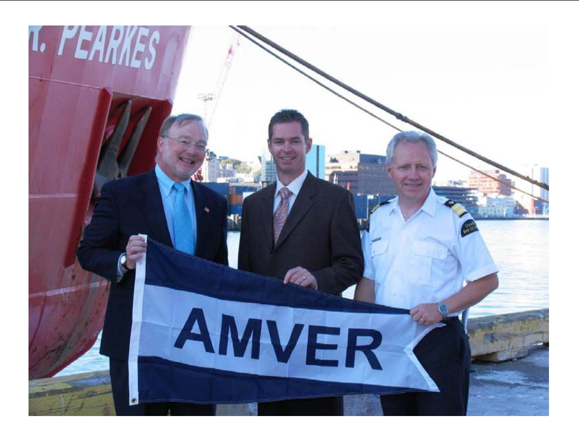
Husky is Presented with the AMVER Award By the Canadian Coast Guard