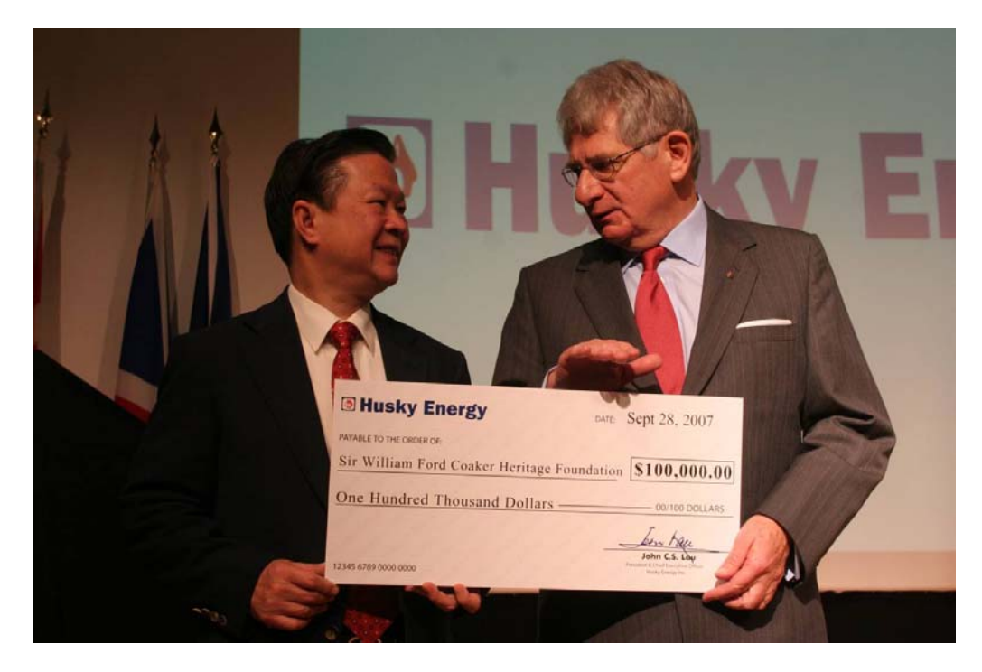
Husky Contributes $100,000 to the Sir William Ford Coaker Heritage Foundation September 28, 2007