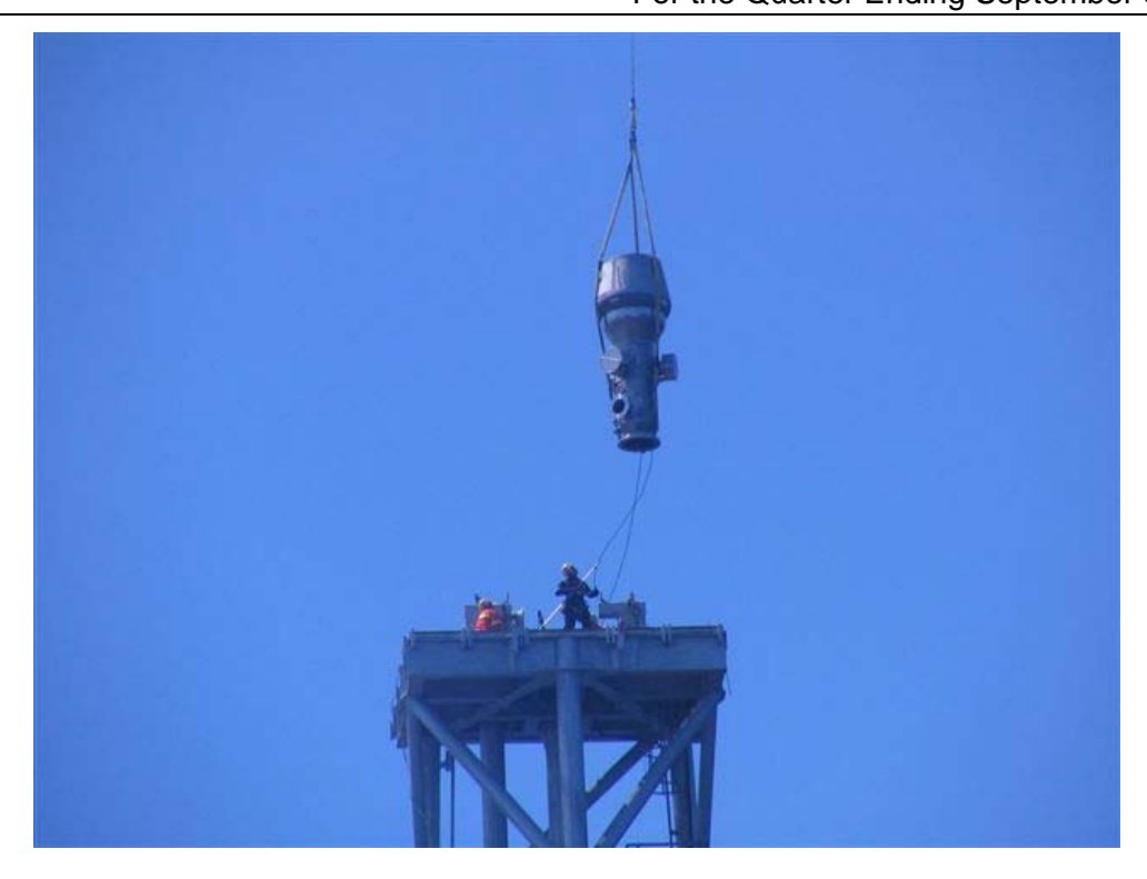
Change out of the Flare Tip during the Maintenance Turnaround onboard the SeaRose FPSO in July 2007