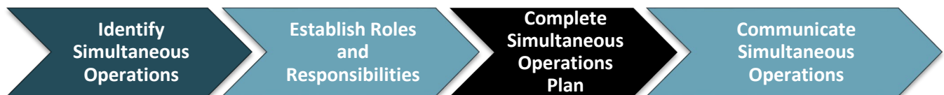
Figure 1: Simultaneous operations components

This standard sets requirements such that these hazards can be managed by an entity's safe control of work processes. The requirements are organized as shown in Figure 1 .